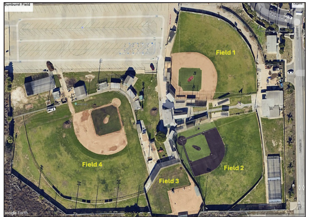
The field locations that make up Sunburst Field on the Joint Forces Training Base (JFTB) property.

The City of Los Alamitos continues to advance its commitment to serving residents through expanded recreational access, long-term facility stewardship, and strong interagency collaboration. Through two significant agreements approved by the City Council, Los Alamitos is strengthening its ability to deliver high-quality services across the community—both by assuming operational responsibility for Sunburst Field and by renewing a long-standing joint use partnership with the Los Alamitos Unified School District (LAUSD).