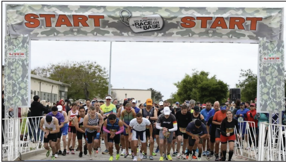
The 2025 UWS Race on the Base first wave of triathletes at the Joint Forces Training Base (JFTB).

Athletes and spectators are invited to the Joint Forces Training Base, Los Alamitos, for competitive racing as the annual Reverse Triathlon and 5K Run/Walk return on Saturday, February 28, 2026.