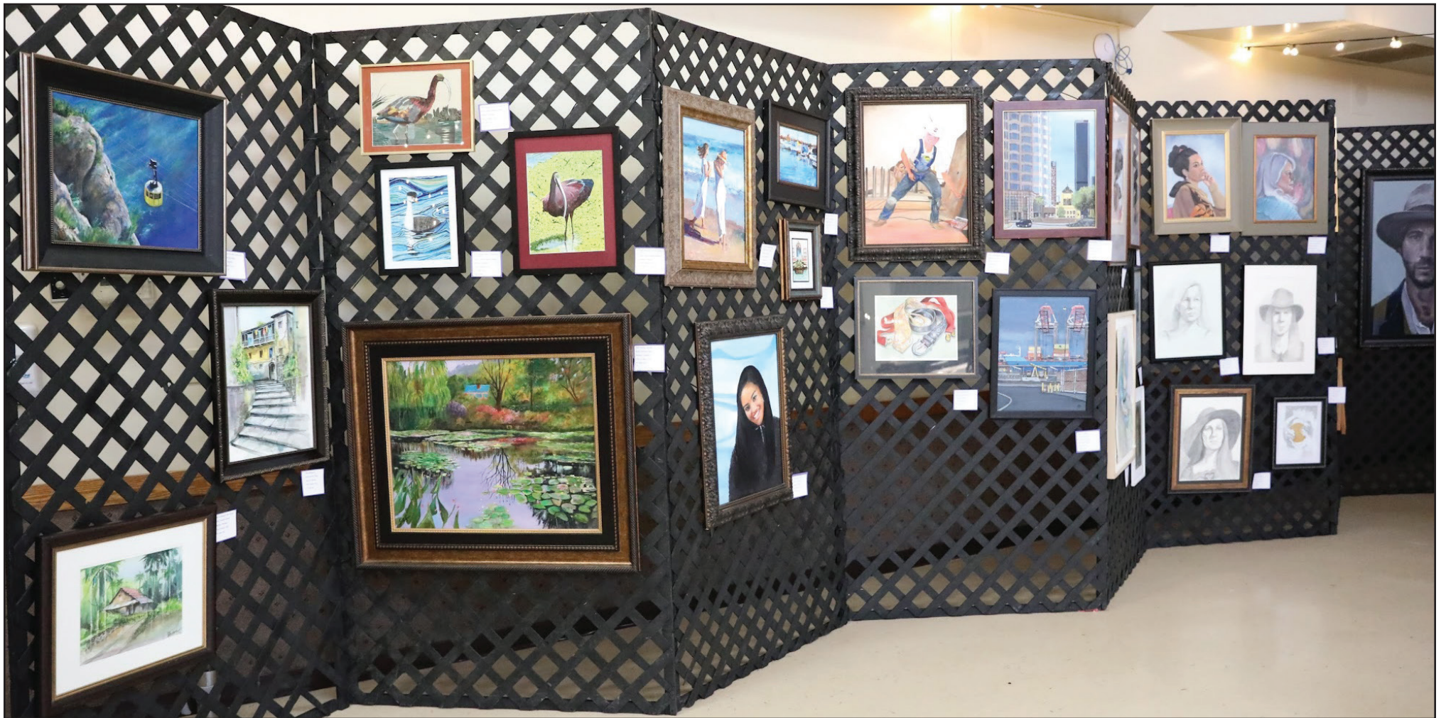
The Weekend of Art display from 2025 which showcased artists from the community at the Los Alamitos Community Center.

The City of Los Alamitos in partnership with the Parks, Recreation & Cultural Arts Commission, is inviting artists of all ages and skill levels to participate in the annual Weekend of Art, scheduled for March 27–28, 2026, at the Los Alamitos Community Center.