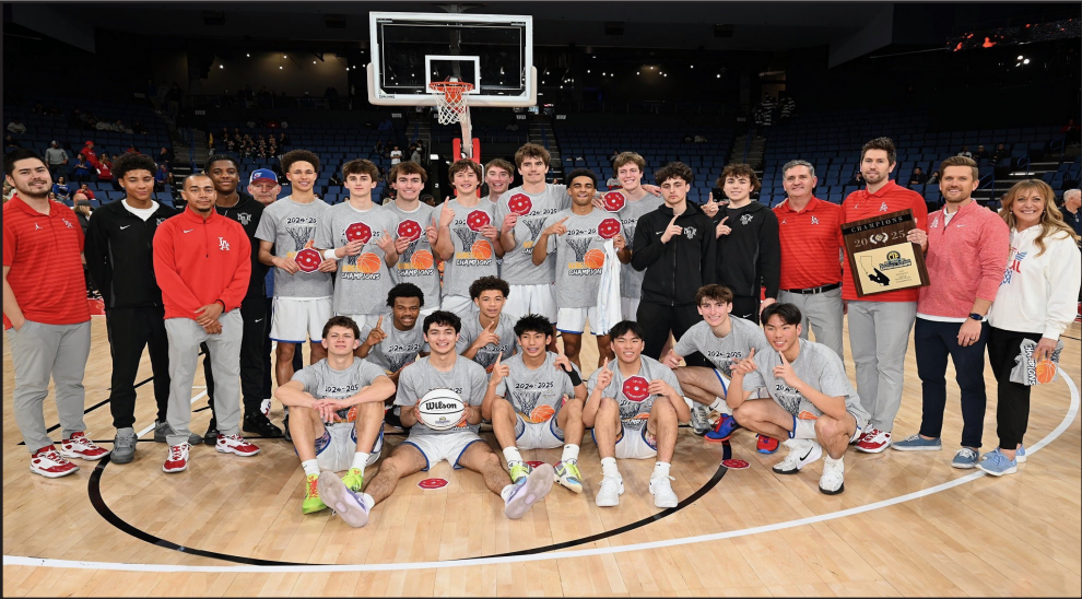
Los Alamitos Boys Basketball Team celebrating the third CIF-SS Division 1 championship with a photo.