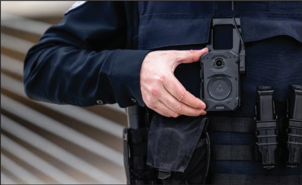
The Axon Body 4 which will be implemented for use at the Los Alamitos Police Department.

Los Alamitos is preparing to take a major step forward in modern policing by equipping its officers with body-worn cameras (BWCs) for the first time—making it the final city in Orange County to adopt the technology. While the City has long maintained a professional and community-focused police force, the move marks a pivotal shift toward modern standards of transparency, accountability, and evidentiary efficiency. The City Council approved a five-year agreement with Axon Enterprise, Inc., the nation’s leading provider of law enforcement camera systems and digital evidence management platforms. The proposal includes annual costs of $68,920.46, totaling $344,602.46 over the contract term, plus a recommended contingency that brings the overall project allocation to