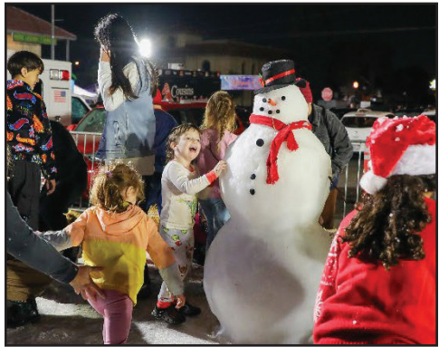
Children playing in the snow at Winter Wonderland.

continuous performances from local schools and dance groups, including the Lil’ Oak Preschool Program, Impact Dance Center, Lee Elementary School Choir, McAuliffe Choir, Rossmoor Royal Choir, Onstage Dance Center, Hopkinson Elementary Choir, MyArt’s Showcase Troupe, Weaver Wailers, Soca Arts, The Company Kids Orange County Song and Dance, and the Oak Middle School Jazz Band. Winter Wonderland 2025 once again proved to be a cornerstone holiday tradition, bringing families together and strengthening community connections during the season of giving. The City of Los Alamitos Recreation and Community Services Department extends its sincere thanks to all sponsors, performers, vendors, volunteers, and attendees for making this year’s event a joyful and successful celebration.