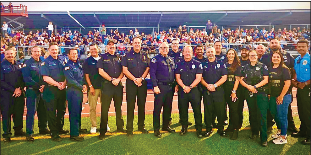
All of the military/first responders who attended the Los Alamitos Inagural Military/First Responders Game.

values of teamwork, service, and leadership that define both Los Alamitos High School athletics and the City’s public safety professionals. The collaboration underscored the City’s ongoing commitment to supporting youth programs and fostering positive connections between students and first responders. As the season came to a close, the Griffins’ accomplishments stood out as a testament to the program’s continued excellence. Los Alamitos High School’s varsity football team finished the 2025 season with an impressive 12–3 overall record and an 11–3 mark in CIF Southern Section play. The team captured the CIF Southern Section Division 2 championship before falling in a hard-fought regional matchup, further solidifying Los Alamitos High School’s reputation as one of California’s premier football programs. The 2025 championship adds to the program’s storied legacy, joining previous CIF Southern Section titles earned in 1991, 1992, 1993, and 2002. The Griffins also opened the season with a dominant 7–0 start, building early momentum that carried them through the playoffs and into the Southern Section title game. This remarkable run capped a season defined by preparation, perseverance, and a commitment to excellence—on the field and throughout Los Alamitos.