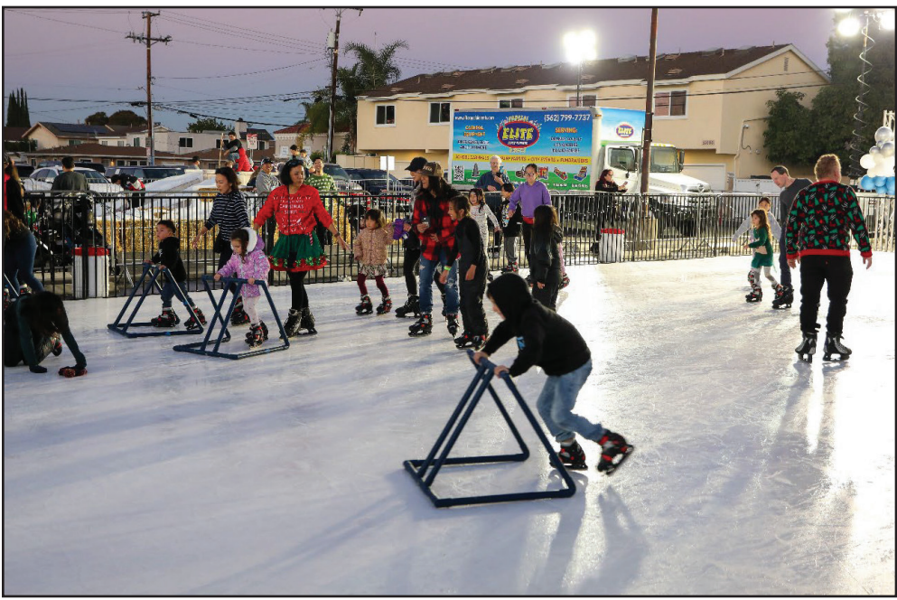
Families ice skating on the rink provided by the City of Los Alamitos during the 14th Annual MemorialCare Miller Children’s & Women’s Hospital Long Beach Winter Wonderland

The City of Los Alamitos welcomed the holiday season in festive style with the 14th annual MemorialCare Miller Children’s & Women’s Hospital Long Beach Winter Wonderland, presented by Universal Waste Systems (UWS), on Saturday, December 6, 2025. The free, family-friendly celebration took place from 4:00 to 7:30 p.m. along Pine Street between Katella Avenue and Florista Street, with additional activities hosted in the neighboring U.S. Bank and CIF parking lots and at St. Isidore Historical Plaza. Guests of all ages enjoyed a wide array of attractions, including live stage performances, a free snow play area sponsored by UWS, an ice-skating rink, a beverage garden benefiting the Los Alamitos Community Foundation, inflatables, a train ride, festive photo backdrops, informational booths, and the annual Christmas tree lighting ceremony. Families also explored Santa’s Village, sponsored by Financial Partners, which featured visits with Santa and the Grinch, while a dedicated Sensory Calming Activity Area provided crafts and quieter spaces for children needing a low-stimulation environment. This year’s event was made possible through the support of community sponsors. MemorialCare Miller Children’s & Women’s Hospital Long Beach served as the Title Sponsor,