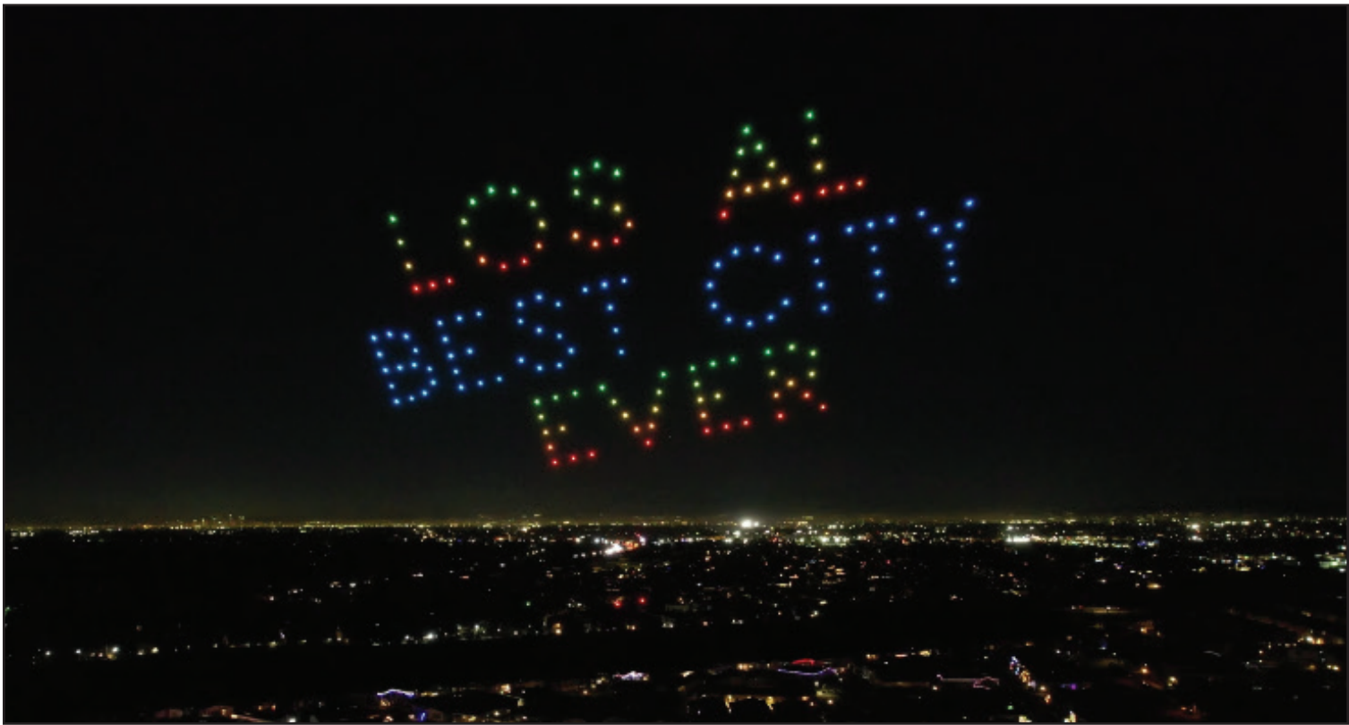
The drone show at Good Evening, Los Alamitos showing the American Flag, a fire truck, a patrol vehicle, and the City’s slogan, “Best City Ever” pictured above.

If you happened to glance up at the sky on Tuesday evening, December 9, 2025, and noticed glowing shapes dancing overhead, you were not imagining things. Good Evening, Los Alamitos was back, and it brought the community together for a memorable night filled with celebration, connection, and a look toward the future. From 6:30 to 8:00 p.m., the Los Alamitos Community Center buzzed with energy as residents, neighbors, and guests gathered to enjoy a festive evening focused on the City’s accomplishments and what lies ahead. The event captured the spirit of Los Alamitos by blending innovation with a strong sense of hometown pride, reminding everyone why this community continues to stand out. The Community Center, located at 10911 Oak Street, served as the perfect setting for the evening’s activities. With free admission, local food, giveaways, and welcoming displays, guests were encouraged to stroll, mingle, and engage with one another. City Council Members, Los Alamitos Unified School District representatives, Commissioners, local business owners, representatives from neighboring cities, and residents of all ages filled the space, creating a warm and