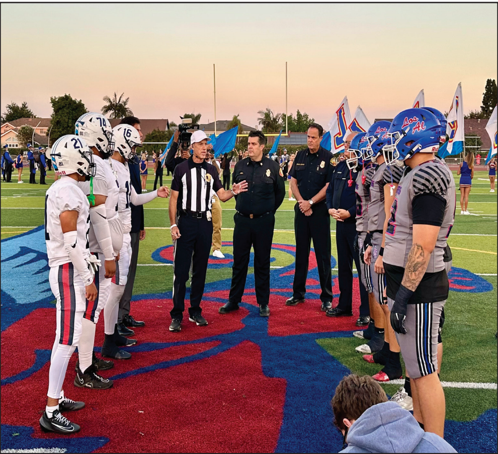
The coin toss for the Los Alamitos v. St. Paul game including participation from the first responders in attendance.

Los Alamitos Police Department 3201 Katella Ave, Los Alamitos CA 90720 (562) 594-7232