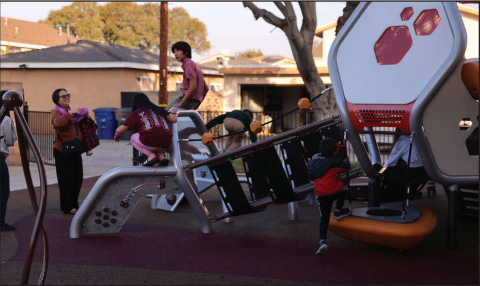
Kids playing on the new play equipment and surfacing at the newly reopened Soroptimist Park.

The City of Los Alamitos completed four park improvement projects this year, marking a significant milestone in its ongoing effort to enhance public spaces and quality of life while efficiently managing capital improvements. Among the projects were the renovation of Soroptimist Park and the opening of the Laurel Park Dog Park, both of which were recently celebrated with ribbon-cutting ceremonies recognizing their completion. Soroptimist Park, a beloved and long-standing neighborhood park, has officially reopened after undergoing a comprehensive renovation aimed at revitalizing its role in the community. The renovation project of the park was approved by the Los Alamitos City Council. The project was funded through a combination of