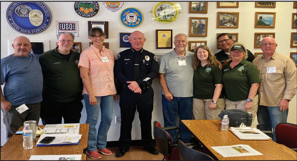
VIPs graduating the Community Emergency Response Team (CERT) program.

overall safety. Community engagement events are particularly rewarding. VIPs help wherever needed, offering guidance, answering questions, and fostering relationships between law enforcement and residents. These occasions allow us to bridge the gap between officers and the community while showing that the police department is there for everyone. One of the most insightful experiences for VIPs is participating in ride-alongs. These rides give us a chance to spend several hours with an officer during their patrols, responding to calls and experiencing the service they provide. It offers a rare glimpse into the challenges and complexities of policing in today’s world, and it