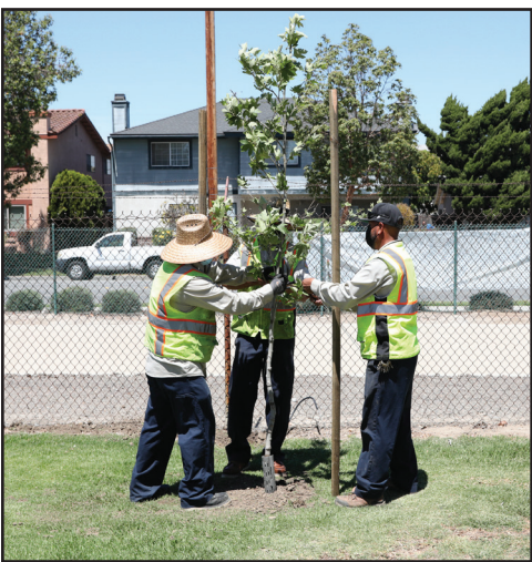
Public Works employees planting and securing a tree during a previous Arbor Day event in Los Alamitos.

The City of Los Alamitos is home to over 2,000 trees, and its urban canopy provides shade and cooling. This Arbor Day, the City continues its commitment to expanding the urban forest canopy and improving the community’s quality of life by planting even more trees at the Arbor Day event on April 26, 2025. The event will be comprised of two parts: a Compost and Mulch Giveaway and the Arbor Day Celebration. The giveaway will start at 9 a.m. and end at 10 a.m. while the Arbor Day Celebration will begin at 10 a.m. and end at noon. The Public Works Division, along with City personnel, will be planting new trees to enhance the urban forest. These efforts not only beautify the city but also contribute to energy conservation, stormwater management, and increased property values. Residents are encouraged to take part in this community-building event, showing support for the environment by caring for trees throughout the City. This year’s celebration will be packed with family-friendly activities, including eco-friendly arts and crafts, a bounce house for the kids, and face painting. You’ll also have the chance to plant a brand-new tree sponsored by Epson and take home tree seedlings to plant.