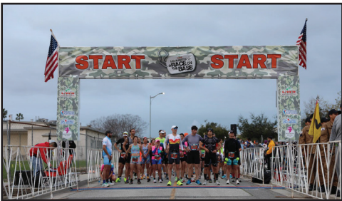
The second round of participants waiting to start their 5k Run/Walk during the Race on the Base event.