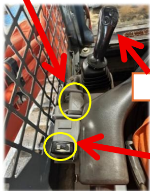
RIGHT JOYSTICK & THUMB