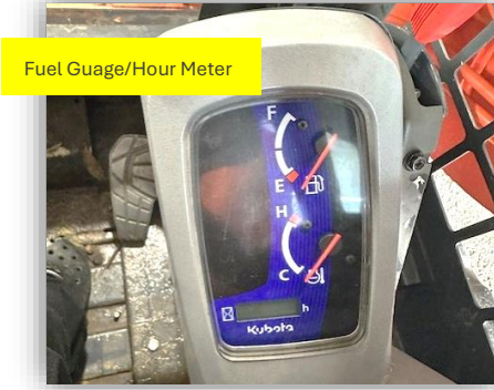
Fuel Gauge/Hour Meter