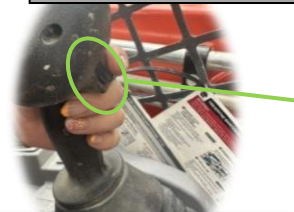
“Travel Speed” Button