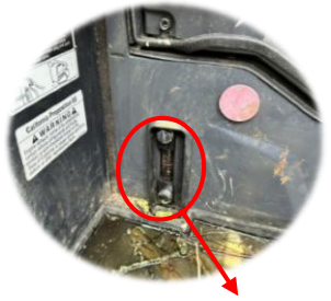
Hydraulic Fluid Level