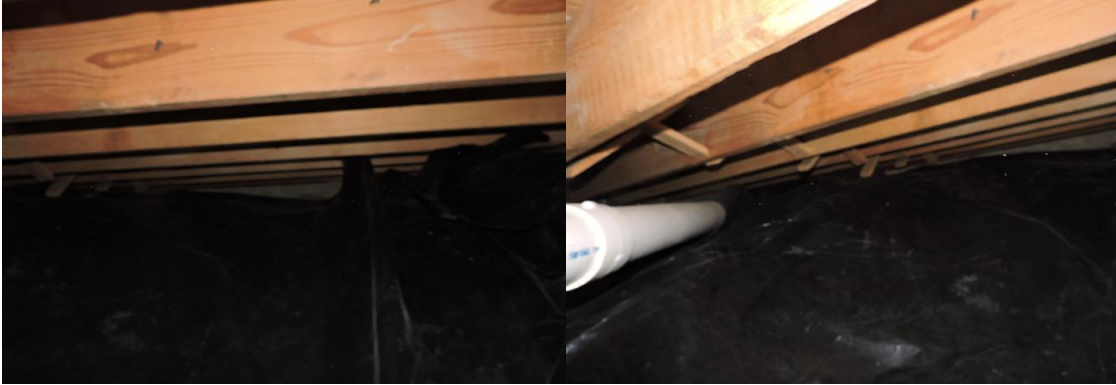
Center Crawlspace showing clean joist, no mold.