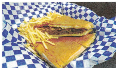
Pan Con Bistec