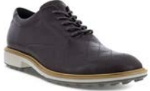
110214 - 01178 MOCHA Cow Leather DW09

Rich, embossed ECCO leather from the shoemaker's own tanneries enhances the classic look while adding to the premium comfort Soft leather lining for extra comfort and a premium feel