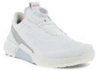
108613 - 54322 WHITE/CONCRETE Steer Leather/Synthetic DW09