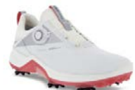
152503 - 01007 WHITE Cow Leather DW09

Embossed ECCO Performance Leather and a sporty mesh add to the modern, athletic and feminine design