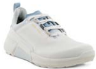
108603 - 60611 WHITE/AIR Steer Leather/Textile DW09