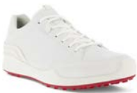
131664 - 50874 WHITE/WHITE Cow Leather/Synthetic DW09