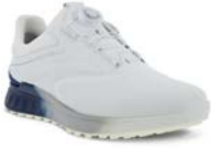
102954 - 60616 WHITE/BLUE DEPTHS/BRIGHT WHITE Cow Leather DW09