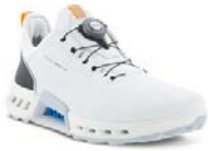
130424 - 01007 WHITE Cow Leather DW09