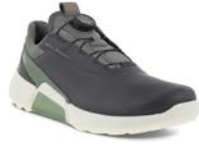
108504 - 60567 MAGNET/FROSTY GREEN Cow Leather DW09