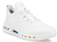
NEW 130404 - 01007 WHITE Cow Leather DW09