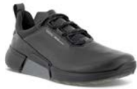
108284 - 01001 BLACK Cow Leather DW09