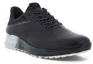
102944 - 55433 BLACK/CONCRETE/BLACK Cow Leather DW09