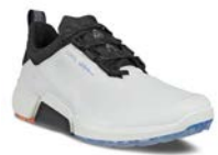
NEW 108514 - 01007 WHITE Cow Leather DW09