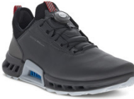
130424 - 51252 MAGNET/BLACK Cow Leather DW09

ECCO Performance Leather from our own tanneries is combined with a super-stretchy mesh sock