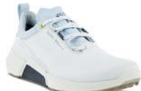
108284 - 60611 WHITE/AIR Cow Leather DW09