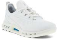
130903 - 01007 WHITE Cow Leather DW09