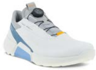
108504 - 55569 WHITE/RETRO BLUE Cow Leather DW09