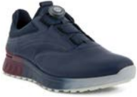
102954 - 60617 MARINE/MORILLO/MARINE Cow Leather DW09

Breathable and premium ECCO leather with 100% GORE-TEX waterproof protection, so your feet stay dry