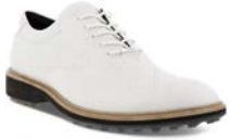
110214 - 01007 WHITE Cow Leather DW09