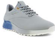
102944 - 60629 CONCRETE/RETRO BLUE/CONCRETE Cow Leather DW09

Breathable and premium ECCO leather from the shoemaker's own gold-rated tanneries