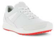
100583 - 50874 WHITE/WHITE Cow Leather/Synthetic DW09