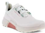
108603 - 60632 DELICACY/SHADOW WHITE Steer Leather/Textile DW09