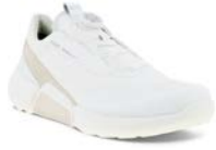
108504 - 58336 WHITE/GRAVEL Cow Leather DW09