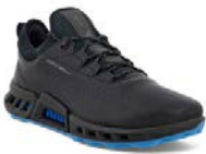
130404 - 01001 BLACK Cow Leather DW09