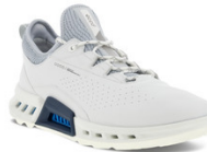
130404 - 57876 WHITE/CONCRETE Cow Leather DW09

ECCO Performance Leather from our own tanneries is combined with a new, super-stretchy mesh sock