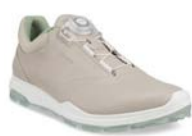
NEW 125563 - 01163 GRAVEL Cow Leather DW09