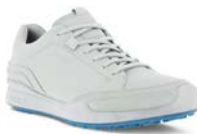
131664 - 56183 CONCRETE/CONCRETE Cow Leather/Synthetic DW09