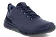
151134 - 01038 MARINE Cow Leather DW09