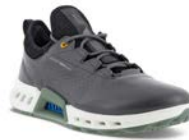
130404 - 01308 MAGNET Cow Leather DW09