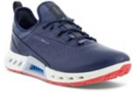
130903 - 01038 MARINE Cow Leather DW09

ECCO Performance Leather from our own tanneries and a super-stretchy mesh sock