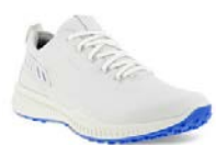
151134 - 11007 WHITE Cow Leather DW09