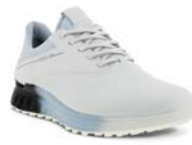
102944 - 60613 WHITE/BLACK/AIR Cow Leather DW09