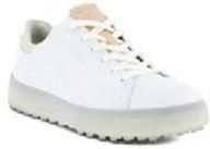
108303 - 01002 BRIGHT WHITE Cow Leather DW09