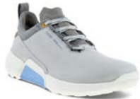
108284 - 01379 CONCRETE Cow Leather DW09