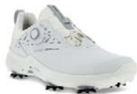
152523 - 01007 WHITE Cow Leather DW09

Playful and original pattern, plus embossed ECCO Performance Leather and a sporty mesh, for a modern, athletic and feminine aesthetic