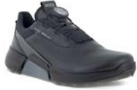
108613 - 60568 BLACK/MAGNET/BLACK Steer Leather/Synthetic/Textile DW09