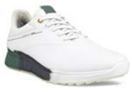
NEW 102944 - 01007 WHITE Cow Leather DW09