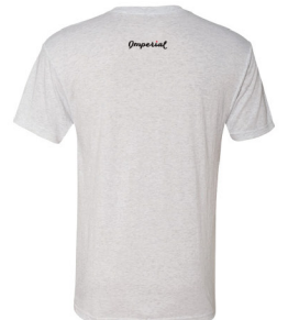
SMALL UPPER BACK: SUB AVG SIZING 3-3.5" W