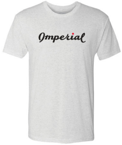
FULL CHEST: FC AVG SIZING 12.5" W