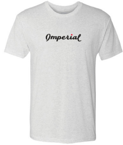
SMALL CENTER CHEST: SCC AVG SIZING 7.5" W