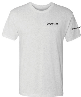
LEFT SLEEVE: 1LS AVG SIZING 1.5 - 2.5" W (1" above cuff)