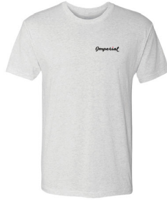
LEFT CHEST: LC AVG SIZING 3-3.5" W