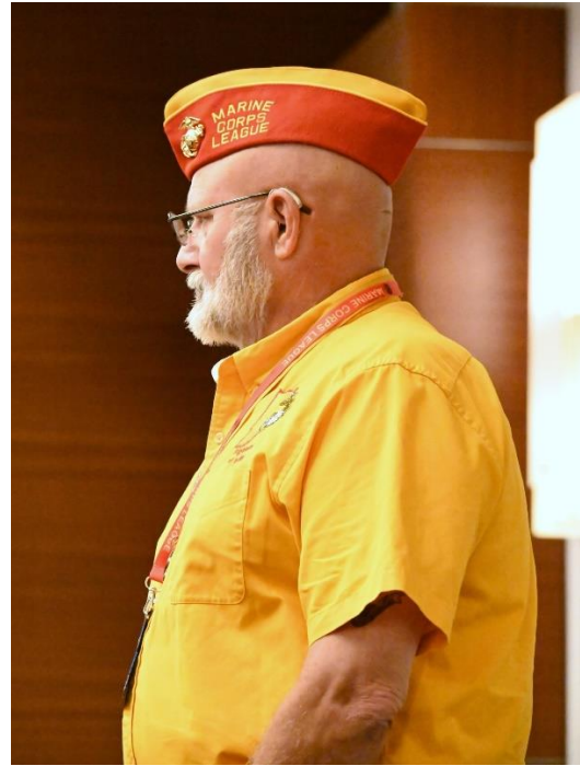
Chief of Staff addresses convention