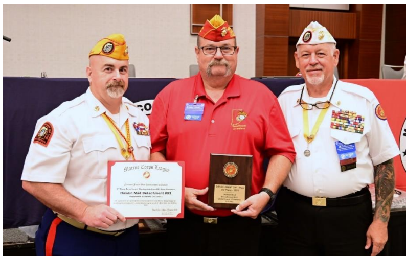
Congratulations to Howlin' Mad #93 for Third Place in Detachment Membership (103.59%)