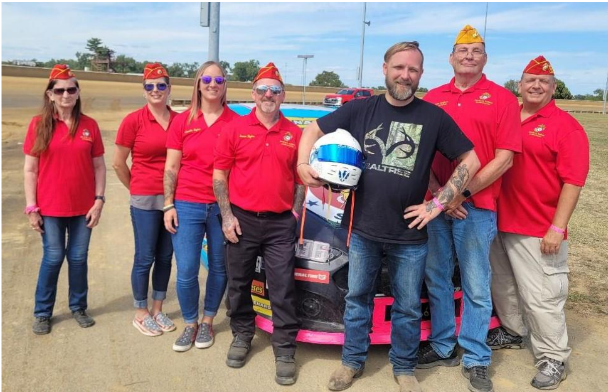
Southern Indiana Leathernecks #931