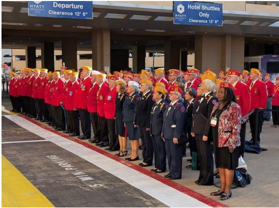
Morning Colors outside hotel entrance