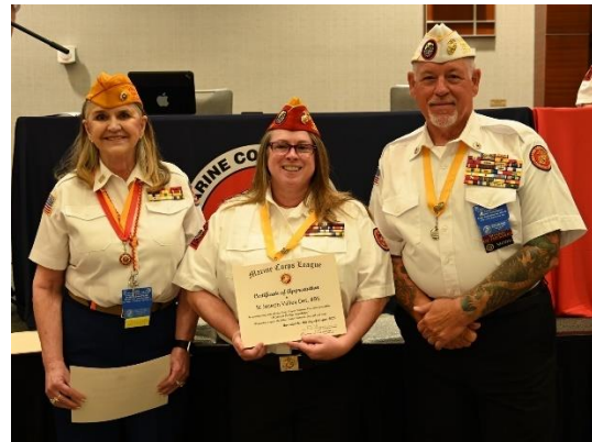
St. Joseph Valley #95 Newsletter Competition Certificate