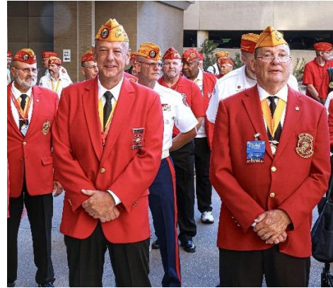
Indiana was present for Morning Colors