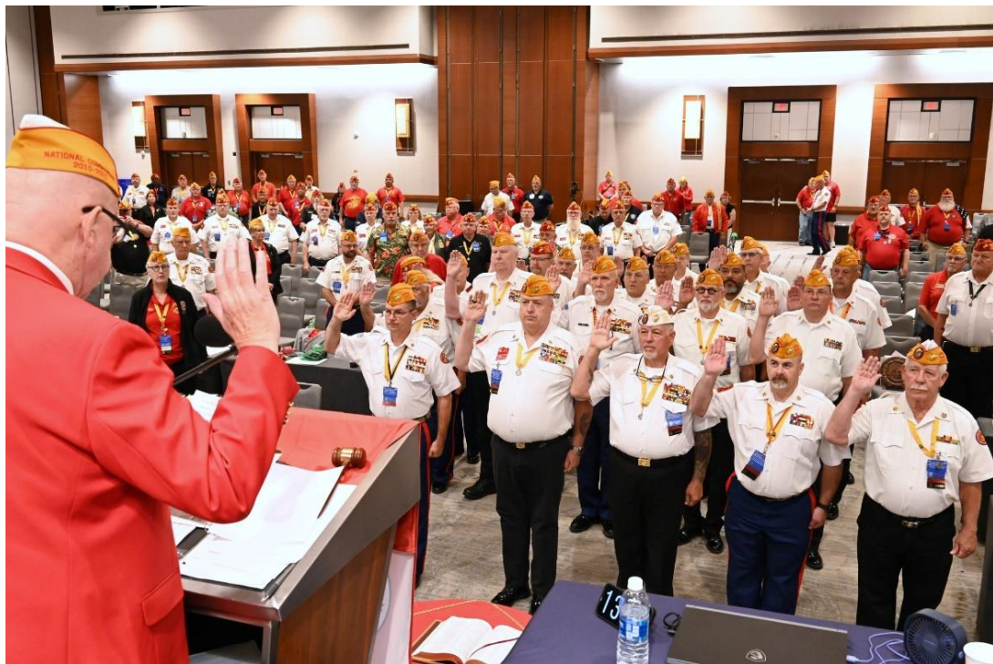
Installation of Officers