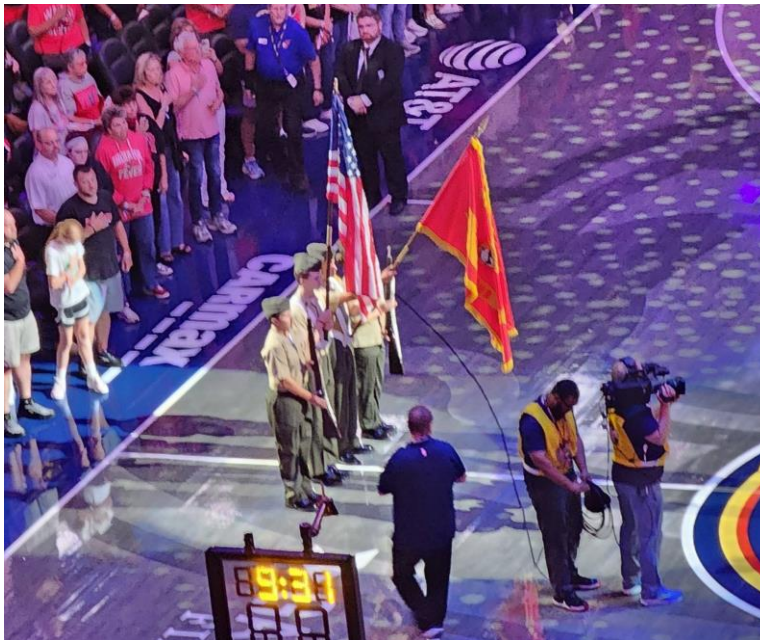
Presenting Colors for the Indiana Fever game on 15 August 2025