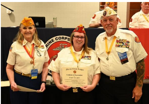
Tripoli #844 Newsletter Competition Certificate