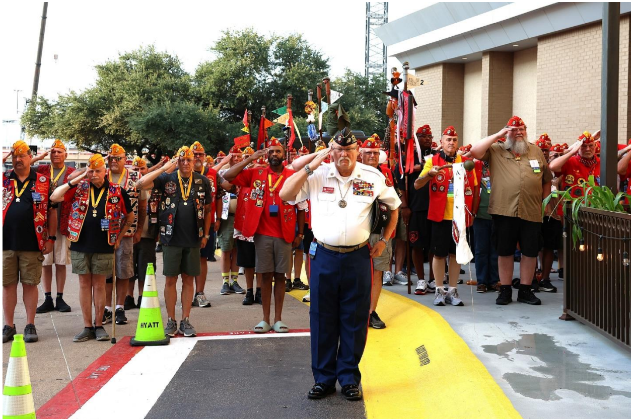
MODD at Morning Colors at 2025 National Convention – WOOF! WOOF!

You will need your cover and paid conference registration credential to enter the Growl!