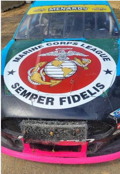
#86 car emblazed with MCL logo