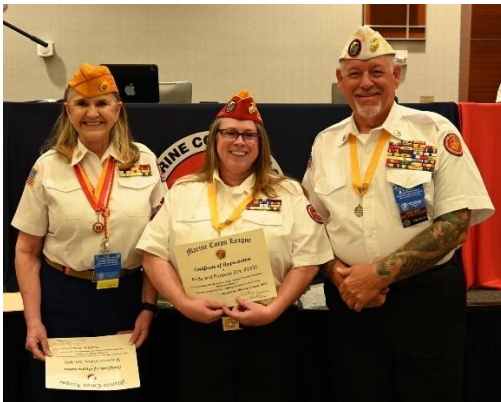
Pride and Purpose #1435 Newsletter Competition Certificate