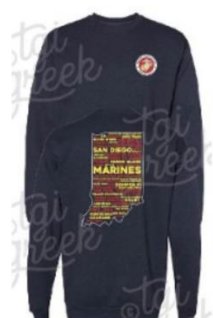
Crewneck sweatshirt $30