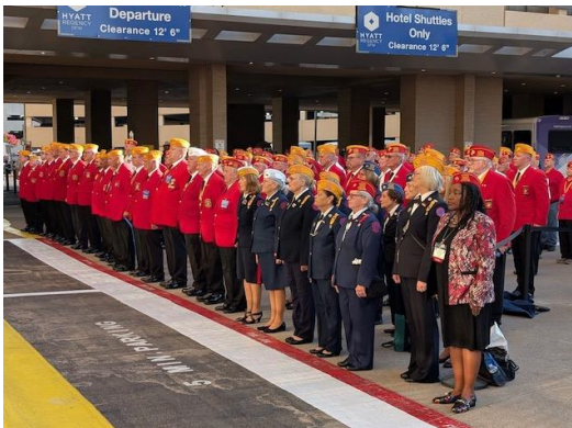
Morning Colors 0800 at Flag Pole

https://www.facebook.com/profile.php?id=61590414099253