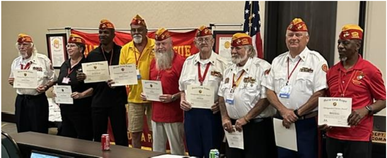
District Vice Commandants