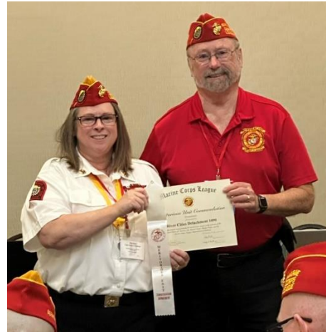
River Cities #1090