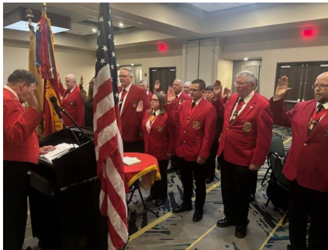
Installation of Department of Indiana officers and district vice commandants during the 2026 Summer Convention banquet

The Department of Indiana conducted nominations in the morning and elections in the afternoon for the 2026-2027 officers during the Summer Convention. Then, the 10 districts caucused and elected their District Vice Commandant. All officers and district vice commandants were installed during the Saturday evening banquet. Congratulations to all! We have your back!