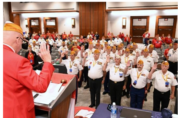
Installation of National Officers on Friday