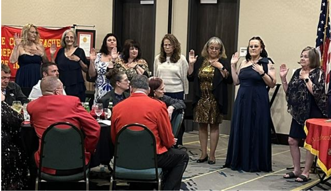
Installation of 2026-2027 Auxiliary Officers