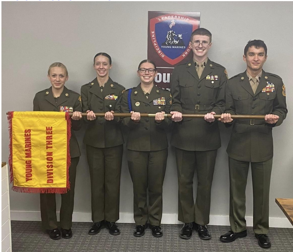
Young Marine of the Year Nominees