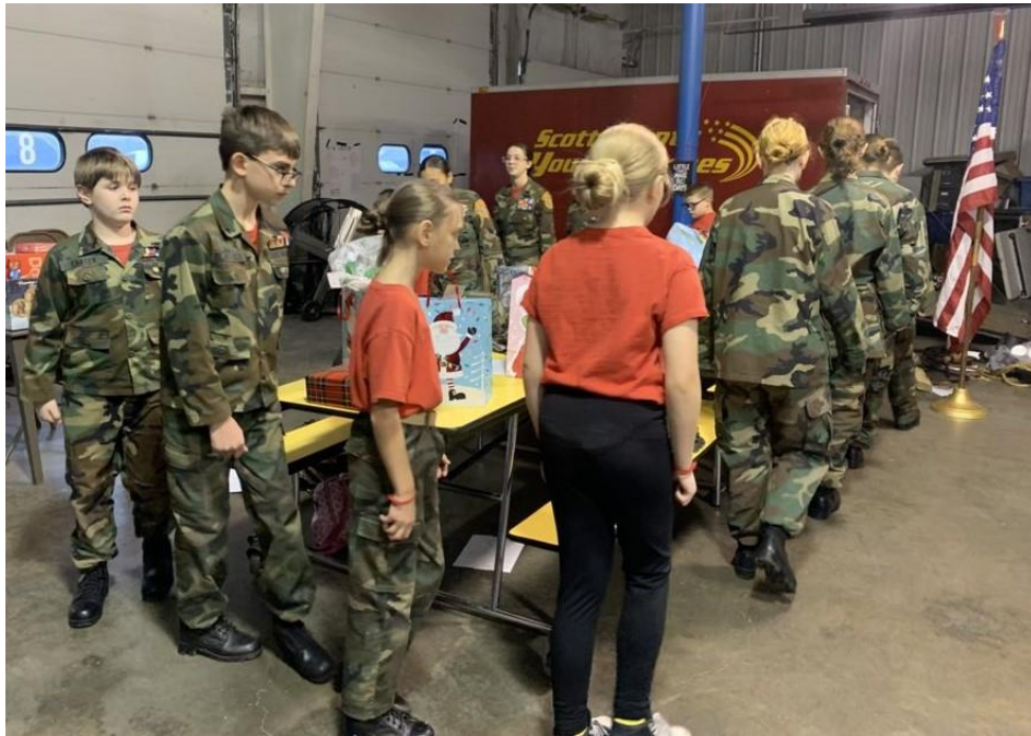
December 2025 Drill and Christmas Gift Exchange