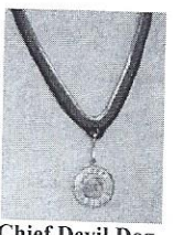
Chief Devil Dog