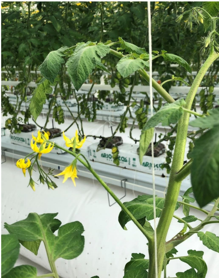
Figure 3; Truss sticking up do to late irrigation.

Three weeks after allowing the roots into the slab, the dry down is 20%, and it should remain above 20% until one to two weeks before harvesting or earlier if the plants show a more generative appearance. Achieve this by stopping early with the irrigation and giving more water during the day between start and stop times to control the EC. Late irrigations have an extraordinarily strong vegetative impulse, causing trusses to stick up straight (see figure 3) instead of the nice curl shown in figure 2. If it seems the dry-down is too much overnight, night irrigations are a better choice. But in most cases, it is better to stop early. You can always give extra irrigations, but you cannot take one away after its given. The grower has an essential input in irrigation management. The weather is different every day, and the stop time of the irrigation varies as a result.