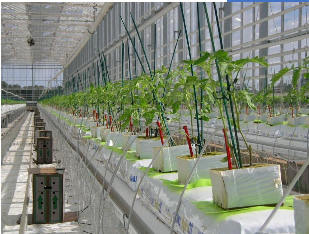
Fig 1; Controlling the Plant

It is advisable to use coloured sheets to prevent the roots from going into the slab. Transparent sheets are difficult to see and when they are removed, they can easily be overlooked if they have not been taken away.