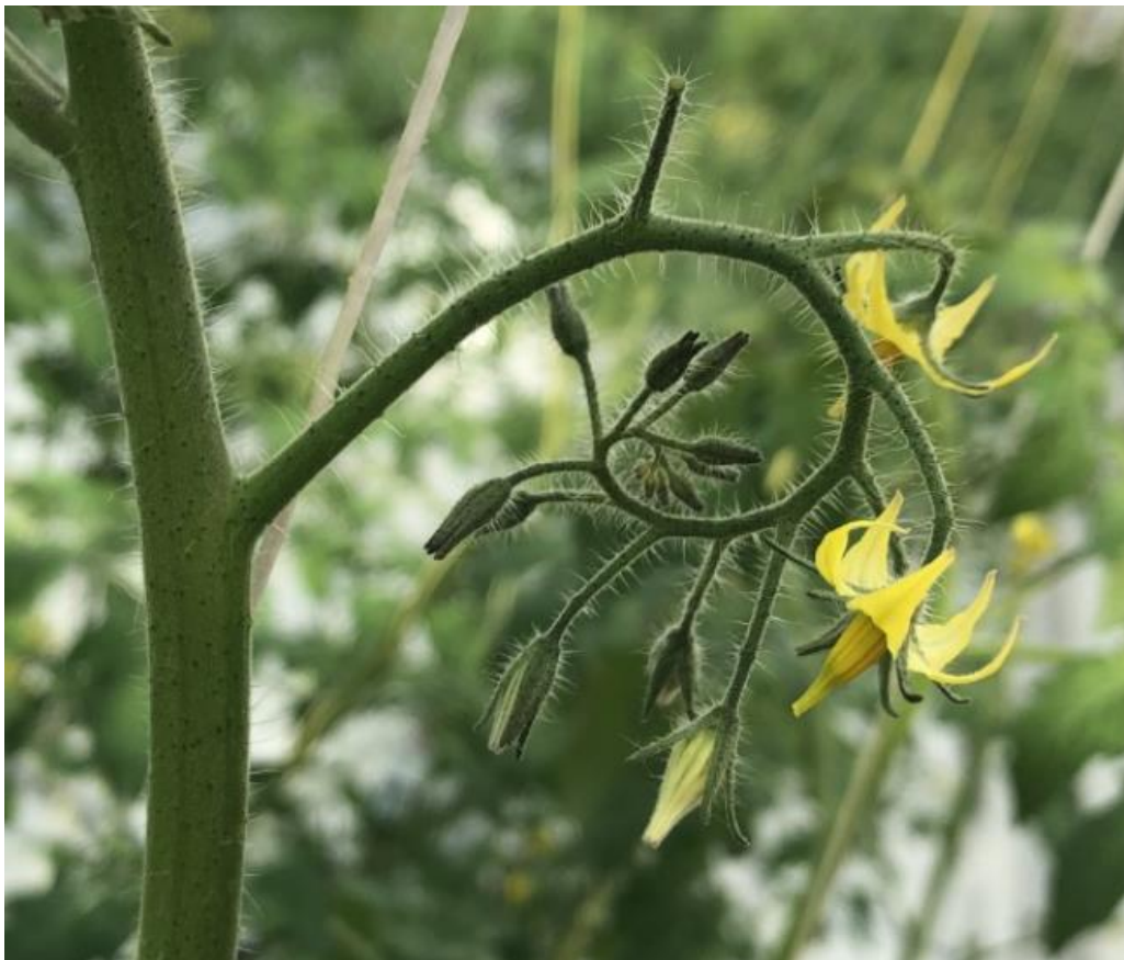
Figure 2; Nice curl in the truss because of generative steering with irrigation

Once the flowers on the first truss are open, the plastic sheet is removed, allowing the roots to grow into the larger volume of root space. The longer this action can be postponed, the better it is for the generativity of the plant. However, not allowing the plants to anchor themselves into the slab makes them unstable, and they might fall over, even when tied up to the string. The falling over of the plant may become the determining factor when plants should be allowed to root into the slab. By the time of planting, the EC in the block is 10-16. The slab must be filled with EC=4 irrigation water. This difference in EC forces the roots to go into the slab very quickly. A nice truss such as shown in figure 2 is a sign that the plants are generative. Notice the extreme curl in this cherry truss. If the irrigation is given too late in the afternoon, or the growing media is kept too wet, the trusses become more elongated and stick up, as shown in figure 3.