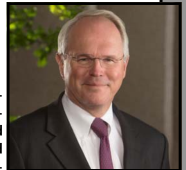
Ambassador Christopher Hill

Join us for a wide ranging discussion as to where the Trump Administration has been and where it's going.