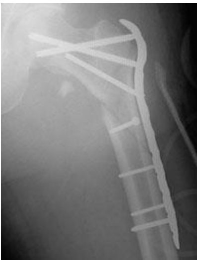
A locking plate may be used for more difficult to treat fractures.

In certain cases, the surgeon may choose to use a plate rather than a nail. The plate will have screws that go into the bone from the lateral, or outer, side of the femur. A single large screw goes into the neck and the head of the femur and appears similar to the compression hip screw, but at a different angle. Secondary screws are then placed through the plate into the bone to hold the fracture in place.