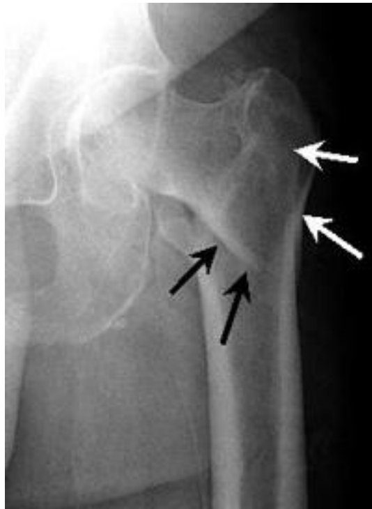
Intertrochanteric Fracture. This occurs further down the bone and tends to have better blood supply to the fracture pieces.