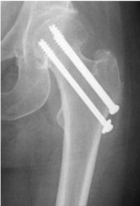
Repair of an intracapsular fracture with individual screws.

For true intracapsular hip fractures, the surgeon may decide either to fix the fracture with individual screws (percutaneous pinning) or a single larger screw that slides within the barrel of a plate. This compression hip screw will allow the fracture to become more stable by having the broken area impact on itself. Occasionally, a secondary screw may be added for stability.