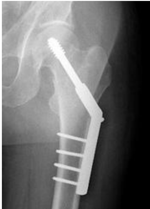
Repair of an intracapsular fracture with a single compression hip screw.

If the intracapsular hip fracture is displaced in a younger patient, a surgical attempt will be made to reduce, or realign, the fracture through a larger incision. The fracture will be held together with either individual screws or with the larger compression hip screw.