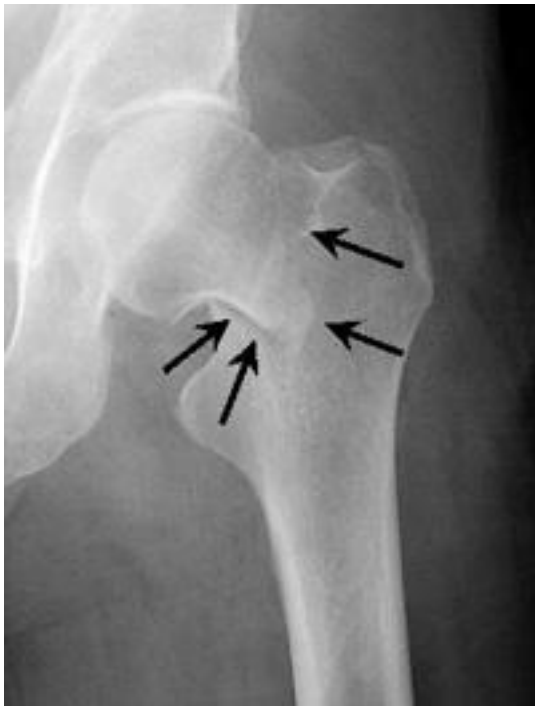
Intracapsular Fracture. This fracture occurs at the level of the "neck" of the bone and may have loss of blood supply to the bone.

These fractures occur at the level of the neck and the head of the femur, and are generally within the capsule. The capsule is the soft-tissue envelope that contains the lubricating and nourishing fluid of the hip joint itself.