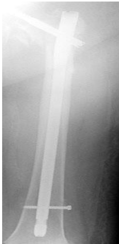
Interlocking screws at the end of the nail make the fixation more secure.

In order to keep the bones from rotating around the nail or from shortening ("telescoping") on the nail, additional screws may be placed at the lower end of the nail in the area of the knee. These are called interlocking screws.