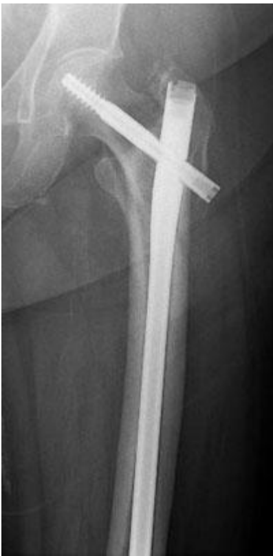
Repair of subtrochanteric fracture with a long intramedullary nail.