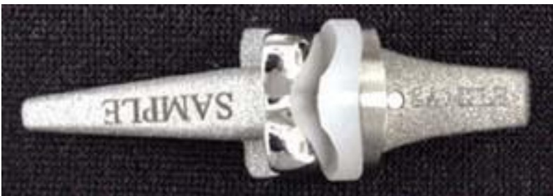
An example of a finger joint prosthesis used in joint replacement surgery. Joint fusions provide pain relief but stop joint motion. The fused joint no longer moves; the damaged joint surfaces are gone, so they cannot cause pain and other symptoms.

When the damage has progressed to a point that the surfaces will no longer work, a joint replacement or a fusion (arthrodesis) is performed.