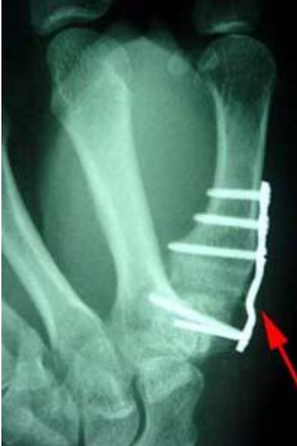
A joint fusion using a plate and screws at the base of the thumb.

one that has a reasonable chance of providing long-term pain relief and return to function. It should be tailored to your individual needs.