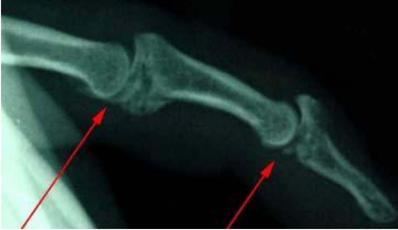
Fractures within the finger joints.