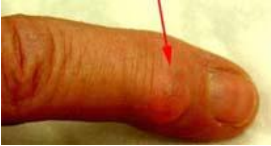
Mucous cyst of the index finger.

When arthritis affects the end joints of the fingers (DIP joints), small cysts (mucous cysts) may develop. The cysts may then cause ridging or dents in the nail plate of the affected finger.