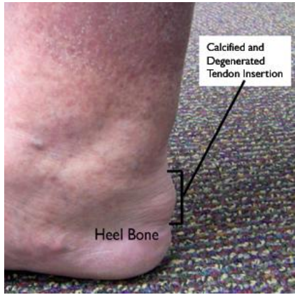
Insertional Achilles tendinitis

Tendinitis that affects the insertion of the tendon can occur at any time, even in patients who are not active.