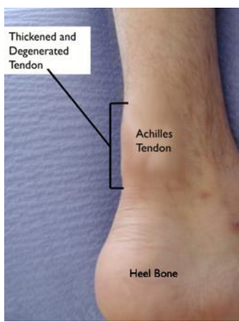
Noninsertional Achilles tendinitis

Simply defined, tendinitis is inflammation of a tendon. Inflammation is the body's natural response to injury or disease, and often causes swelling, pain, or irritation. There are two types of Achilles tendinitis, based upon which part of the tendon is inflamed.