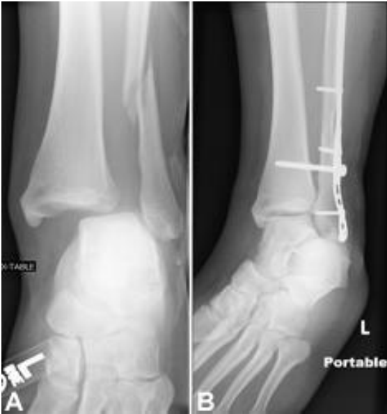
(Left) X-ray of syndesmotic injury with lateral malleolus fracture. Note the space between the tibia and fibula. (Right) Surgical repair.

Your physician may do a stress test x-ray to see whether the syndesmosis is injured.