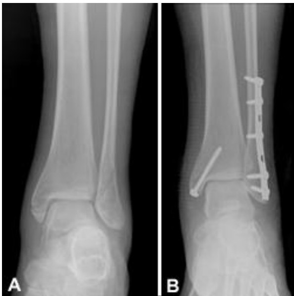
(Left) X-ray of bimalleolar ankle fracture. (Right) Surgical repair bimalleolar ankle fracture

Bimalleolar fractures or bimalleolar equivalent fractures are unstable fractures and can be associated with a dislocation.