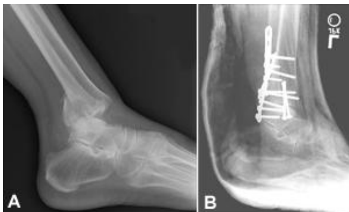
(Left) X-ray of trimalleolar ankle fracture. (Right) Surgical repair.

"Tri" means three. Trimalleolar fractures means that all three malleoli of the ankle are broken. These are unstable injuries and they can be associated with a dislocation.