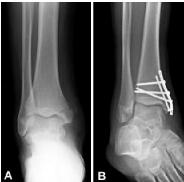
(Left) X-ray of a medial malleolus fracture. (Right) Surgical repair of a medial malleolus fracture with a plate and screws.