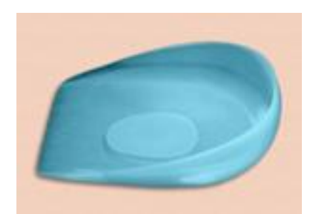
Soft heel pads can provide extra support.

Cortisone injections. Cortisone, a type of steroid, is a powerful anti-inflammatory medication. It can be injected into the plantar fascia to reduce inflammation and pain. Your doctor may limit your injections. Multiple steroid injections can cause the plantar fascia to rupture (tear), which can lead to a flat foot and chronic pain.