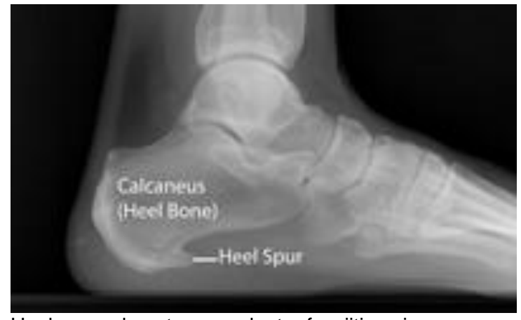
Heel spurs do not cause plantar fasciitis pain.

Although many people with plantar fasciitis have heel spurs, spurs are not the cause of plantar fasciitis pain. One out of 10 people has heel spurs, but only 1 out of 20 people (5%) with heel spurs has foot pain. Because the spur is not the cause of plantar fasciitis, the pain can be treated without removing the spur.