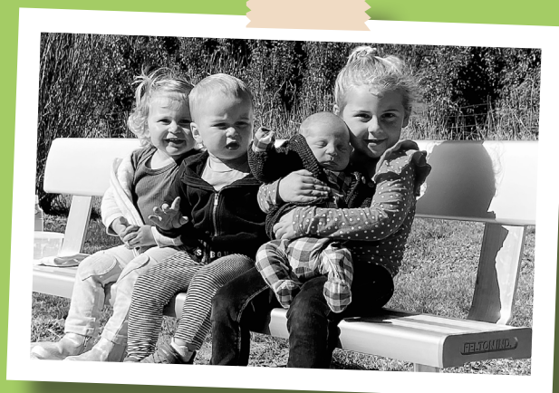
The new seating at Lions Park is being put to good use.