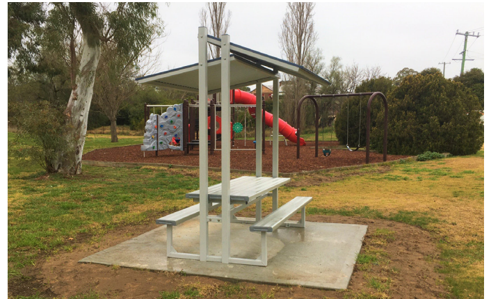
New park infrastructure has been installed in Woodstock Lions Park.