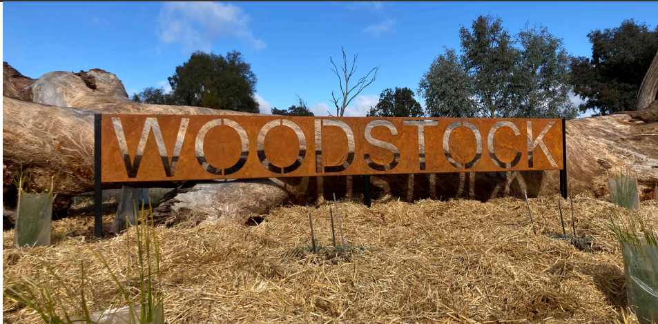
The Woodstock Village entry feature has been completed.

Fire permits will be required after OCTOBER 1st