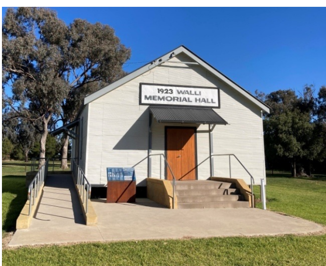
The Walli Memorial Hall in 2015 and in 2023 following resoration and improvements.