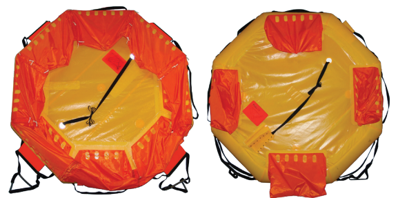
Image on left upgraded TSD. Image on right four standard water pockets.

SWITLIK believes that the best-in-class life rafts should also offer the best-in-class ballast system. Developed from extensive testing and used by both the United States Coast Guard as well as the Royal Australian Air Force, SWITLIK's Toroidal Stability Device is vastly superior to standard rectangular, Icelandic, or hemispherical ballast systems. Both the United States Coast Guard and the Royal Australian Air Force tested life rafts featuring our Toroidal Stability Device in heavy weather conditions and tried, unsuccessfully, to capsize them with the down-wash from their helicopters. As the key component to our best-in-class stability, the Toroidal Stability Device features complete wrap-around ballasting covering the entire perimeter of the underside of the raft with multiple, weighted, water-holding chambers.