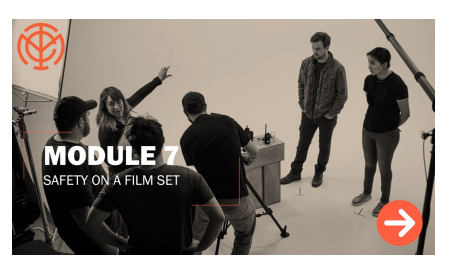
PERSONAL AND FILM SET SAFETY

WALKIE TALKIE LINGO, CHANNELS AND PRACTICE