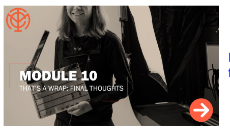
How to get hired, questions on an interview and networking tips, plus database

Final pro-tips, assessment quiz feedback video and badging.