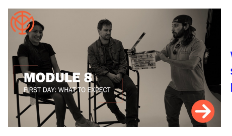
What to expect your first day on set, what to pack and how to prepare