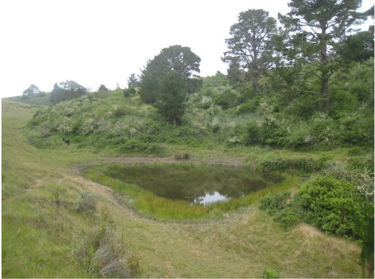
Figure 1. Stock pond (photo taken 12 May 2012, 1142 hrs) where water temperature profiles were taken, viewed from northeastern corner towards the southwest. Dam is located at right of image, with the spillway in lower right corner. Grassland pastures are to the left of the image, and coastal scrub to the right. Trampled edges of the pond by cattle (a bull is visible just beyond far shallow end of pond), and band of sedges in shallow water, are clearly visible, but the sparse pond weed inside the sedges is not visible because of surface water reflection. Note overcast marine layer, which was typical while temperature loggers were present (see Methods and Figure 2).

In order for resource managers to understand why frogs behave the way they do, and also to effectively maintain, restore, improve, and create aquatic habitats for frogs, managers need to understand the optimal temperatures for frogs in these habitats. Unfortunately, there are few relevant data available on water temperatures where California Red-legged Frogs occur. As a start to filling this information gap, and to encourage further research on the topic, I present and discuss preliminary data gathered from a series of temperature loggers in a frog breeding pond in coastal central California.