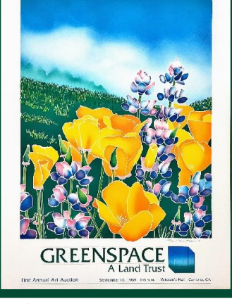
Above: Greenspace Poster 1989. Below: Greenspace Poster 1990. Both posters available for purchase online.