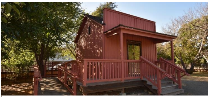
Historic Chinese Cultural Association Hall known better known locally as the Chinese Temple at Greenspace's Creekside Reserve.

We are also thrilled to announce that after several years of effort, the Chinese Temple at Creekside Reserve has been designated as a California Place of Historic Importance! We are so excited and honored by this state recognition.