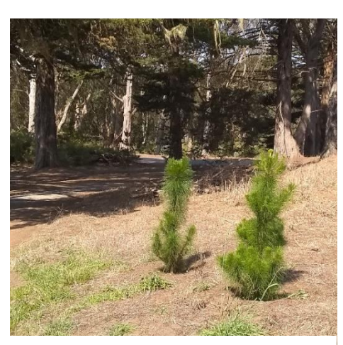
Two baby Monterey pine, Pinus radiata , seedlings planted by Greenspace Cambria.

Much of Cambria's coastal Monterey pine forest runs through personal and private properties in our community. Did you know that a permit is required to remove any Monterey pines or coastal live oaks and property owners are required to mitigate trees removed at a species-specific ratio? Basically, if you have to