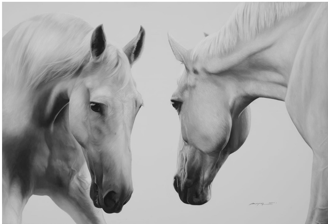
Equus , 2021 Giclée on Hahnemühle paper William Turner 310 g 100% Cotton