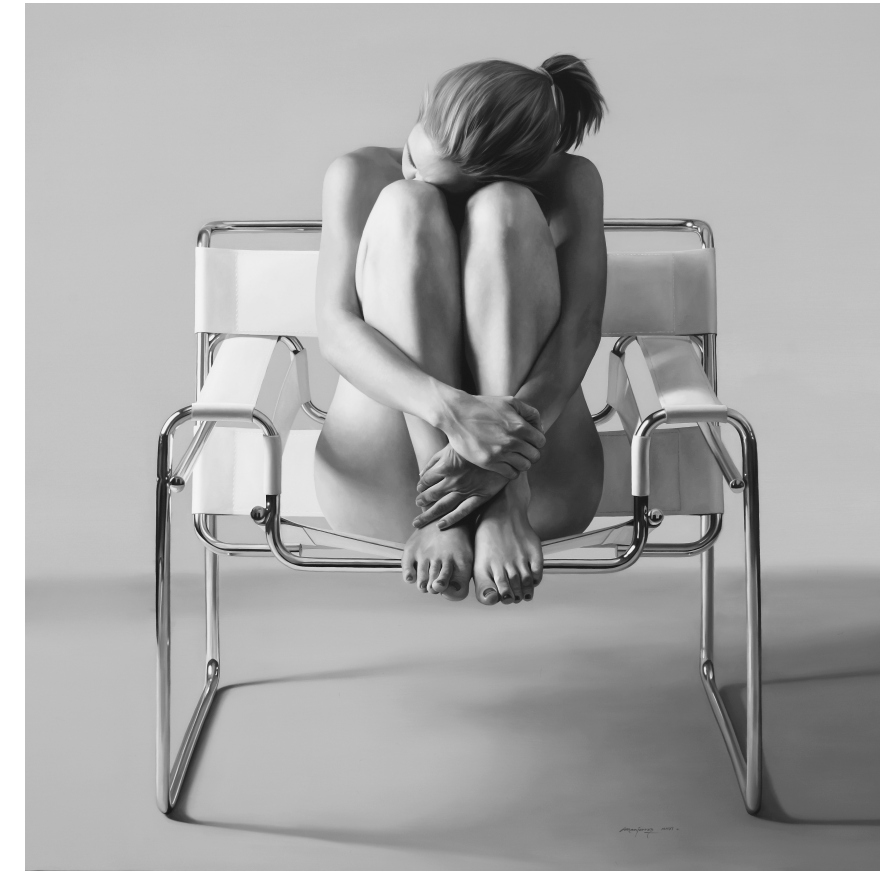
Introspection II , 2021 Giclée on Hahnemühle paper William Turner 310 g 100% Cotton