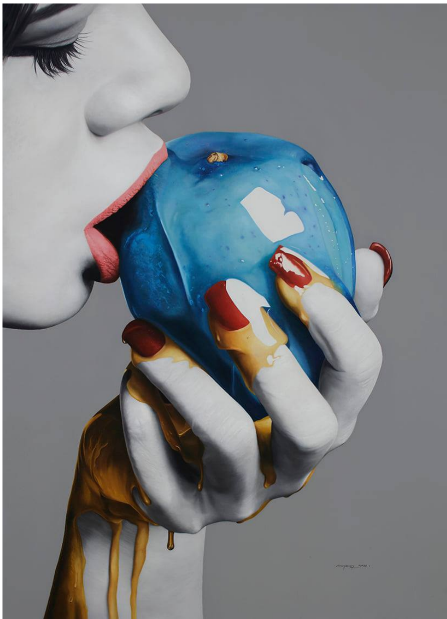
Eva's cynicism , 2021, Polyptych, Giclée on Hahnemühle paper, William Turner 310 g 100% Cotton