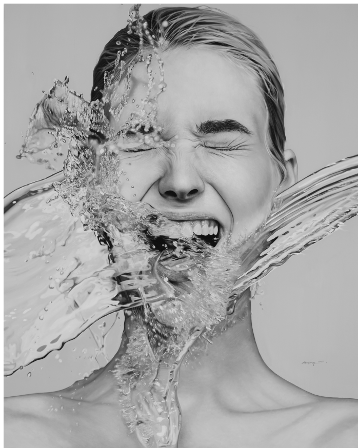
Splash! , 2021 Giclée on Hahnemühle paper William Turner 310 g 100% Cotton