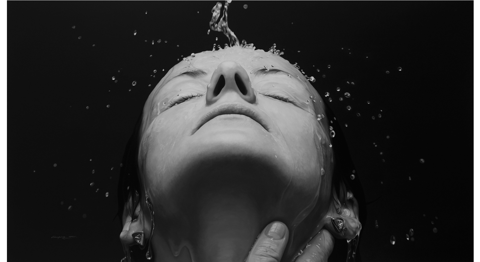
Refreshing I , 2021 Giclée on Hahnemühle paper William Turner 310 g 100% Cotton