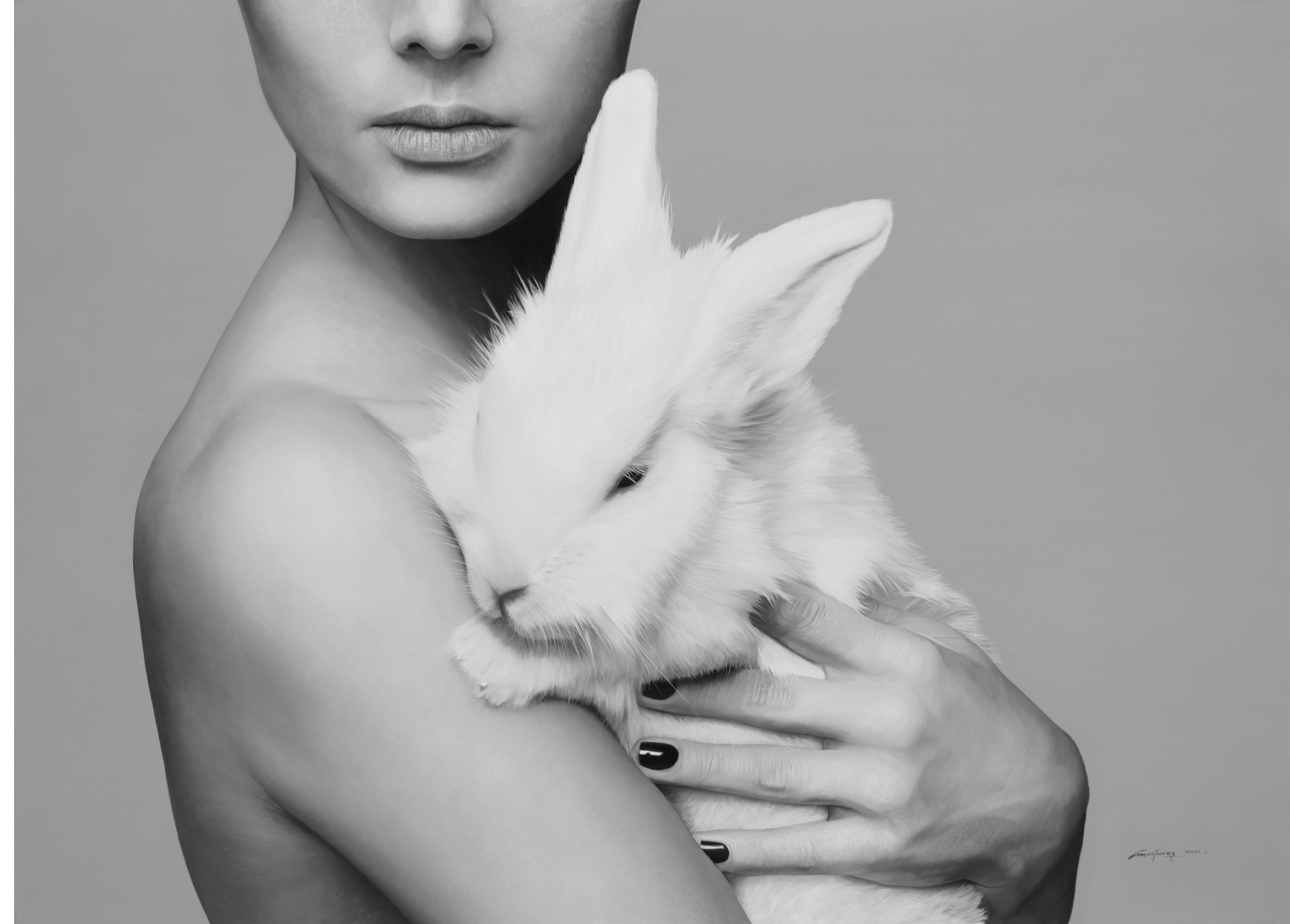
Introspection I , 2021 Giclée on Hahnemühle paper William Turner 310 g 100% Cotton