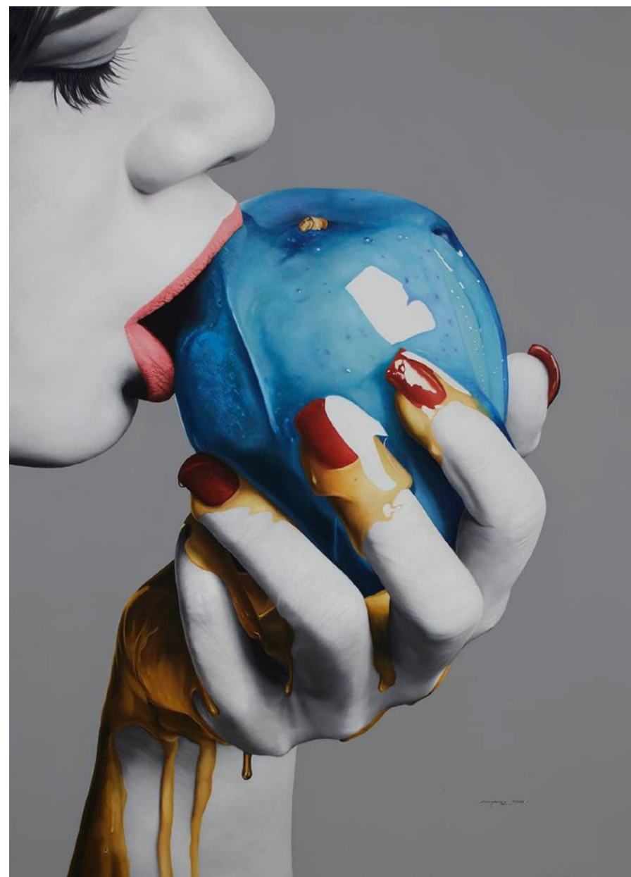
Eva's cynicism , 2021, Polyptych, Giclée on Hahnemühle paper, William Turner 310 g 100% Cotton, Printing area: 90 x 65 cm, Paper: 103 x 78 cm Ltd. series of 75