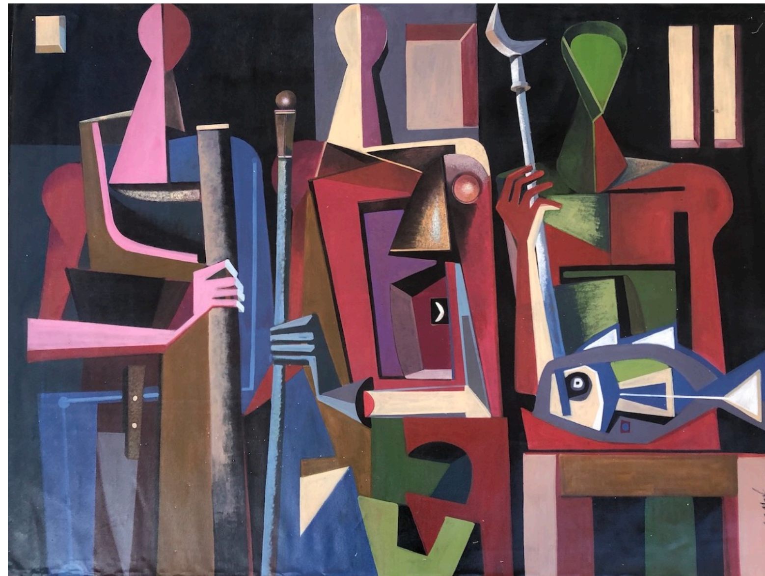
Shamans , 2020 Acrylic on Canvas 128 x 170 cm