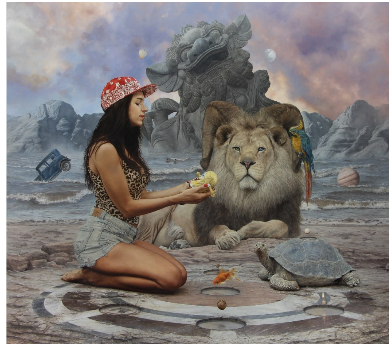
The fable of the guardian , 2021 Oil on Canvas 150 x 170 cm

I see a new blank staff come in like the characters in the play, ready to write... Perhaps the world needs new compositions.