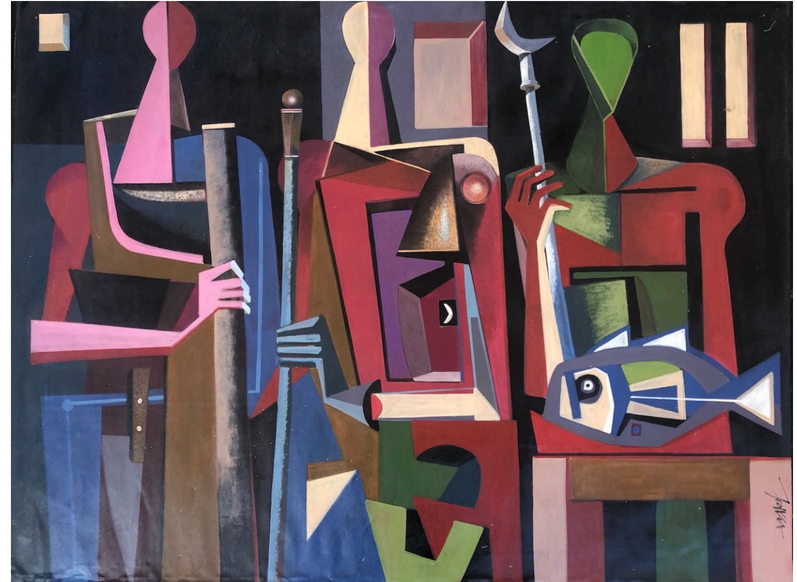
Shamans , 2020 Acrylic on Canvas 128 x 170 cm