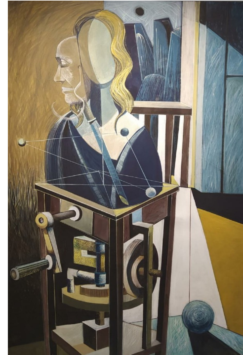
Paradigm , 2020 Oil and Acrylic on Canvas 154 x 106 cm