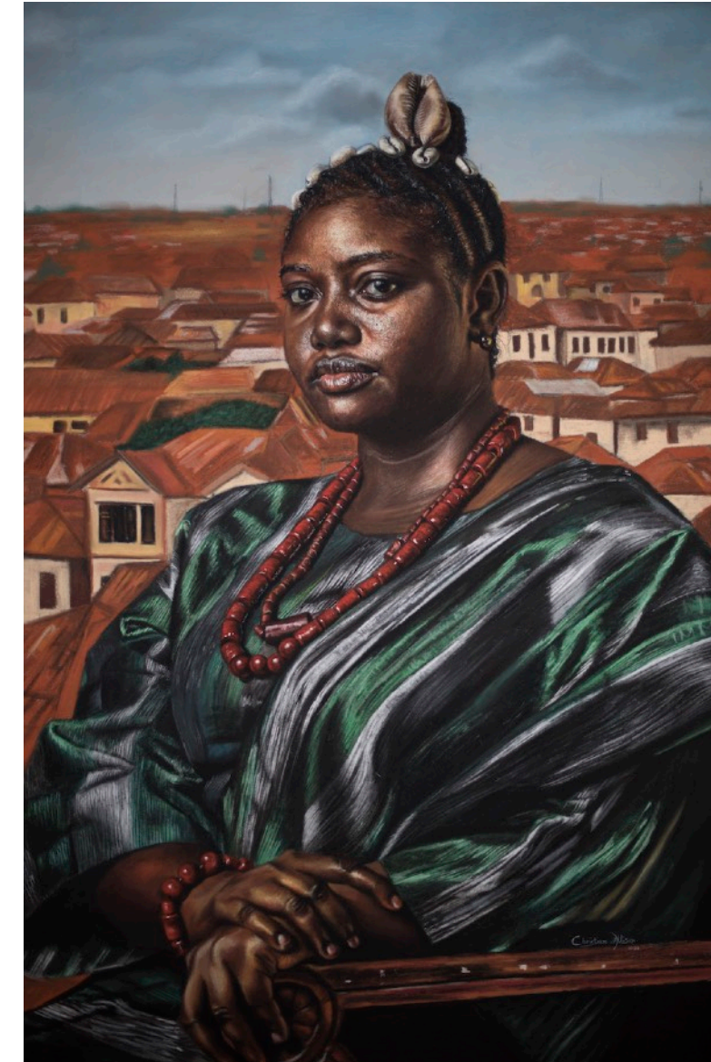
Olori , 2020 Charcoal and Pastel on Canvas 154 x 106 cm