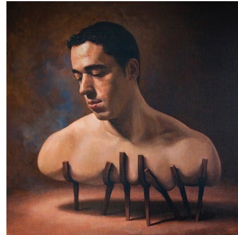
Sadness , 2006 Acrylic on canvas 70 x 70 cm