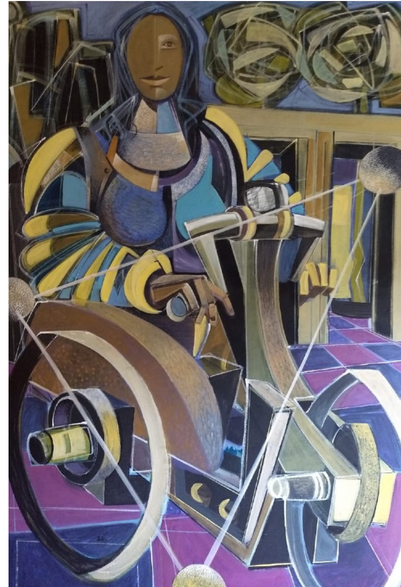
Automaton , 2020 Oil and Acrylic on Canvas 154 x 106 cm

Art gives meaning to my humanity, art is me, my memory, my memories, my yearnings, my divinity, in it I find my meaning.