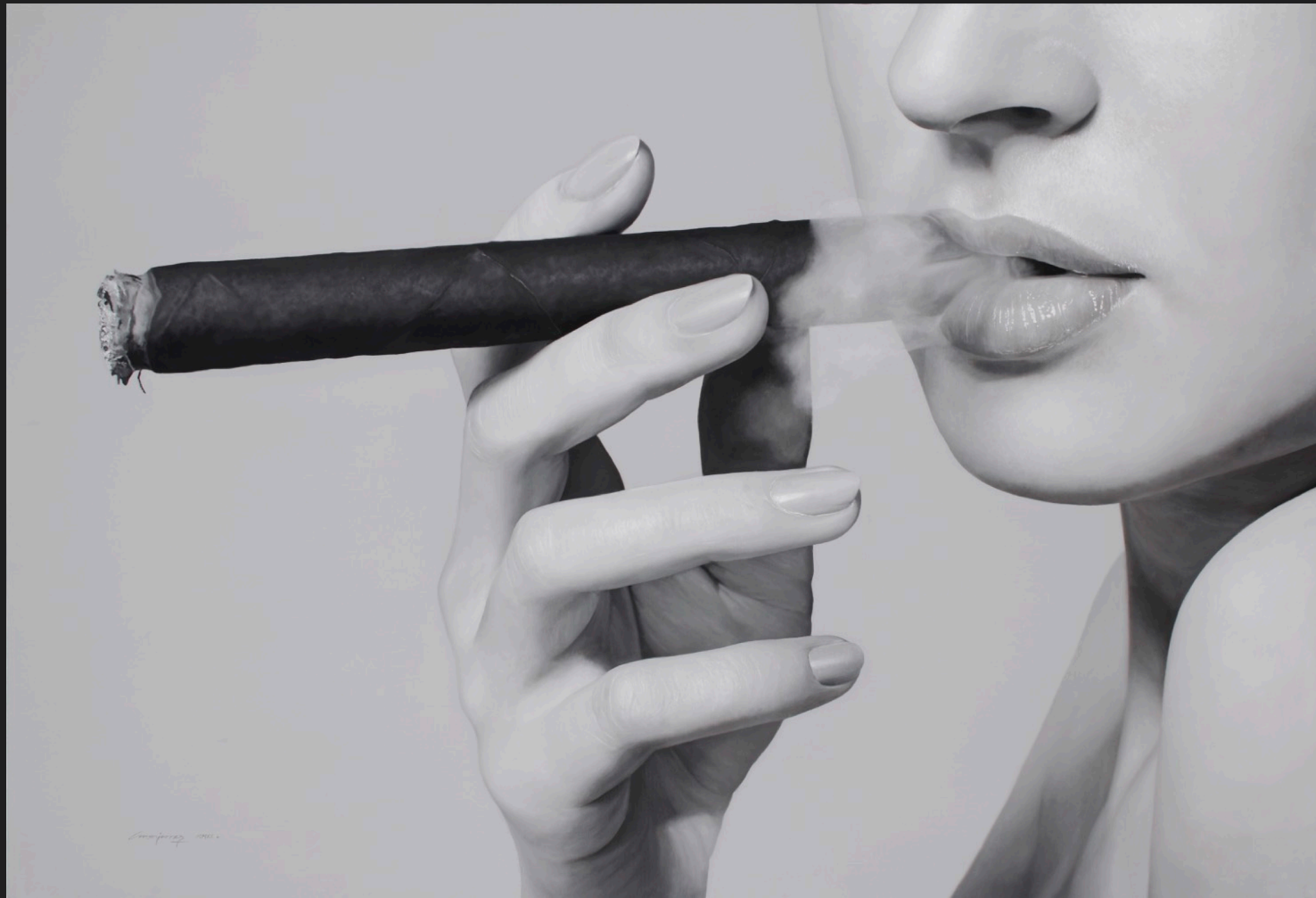
The Cigar , 2020, Oil on canvas, 130 x 200 cm