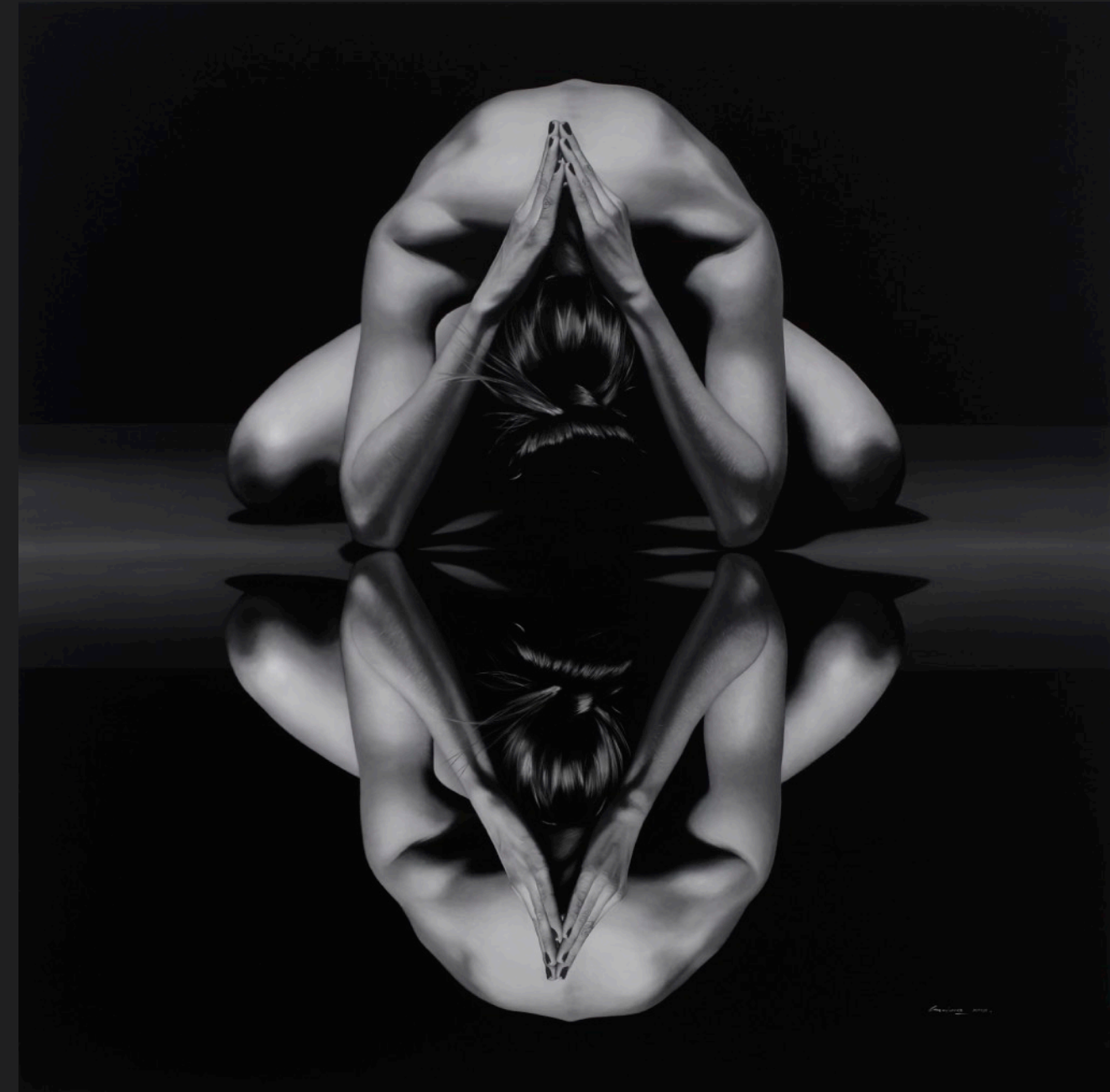
Doppelgänger's devotion, 2019, Oil on canvas, 180 x 180 cm