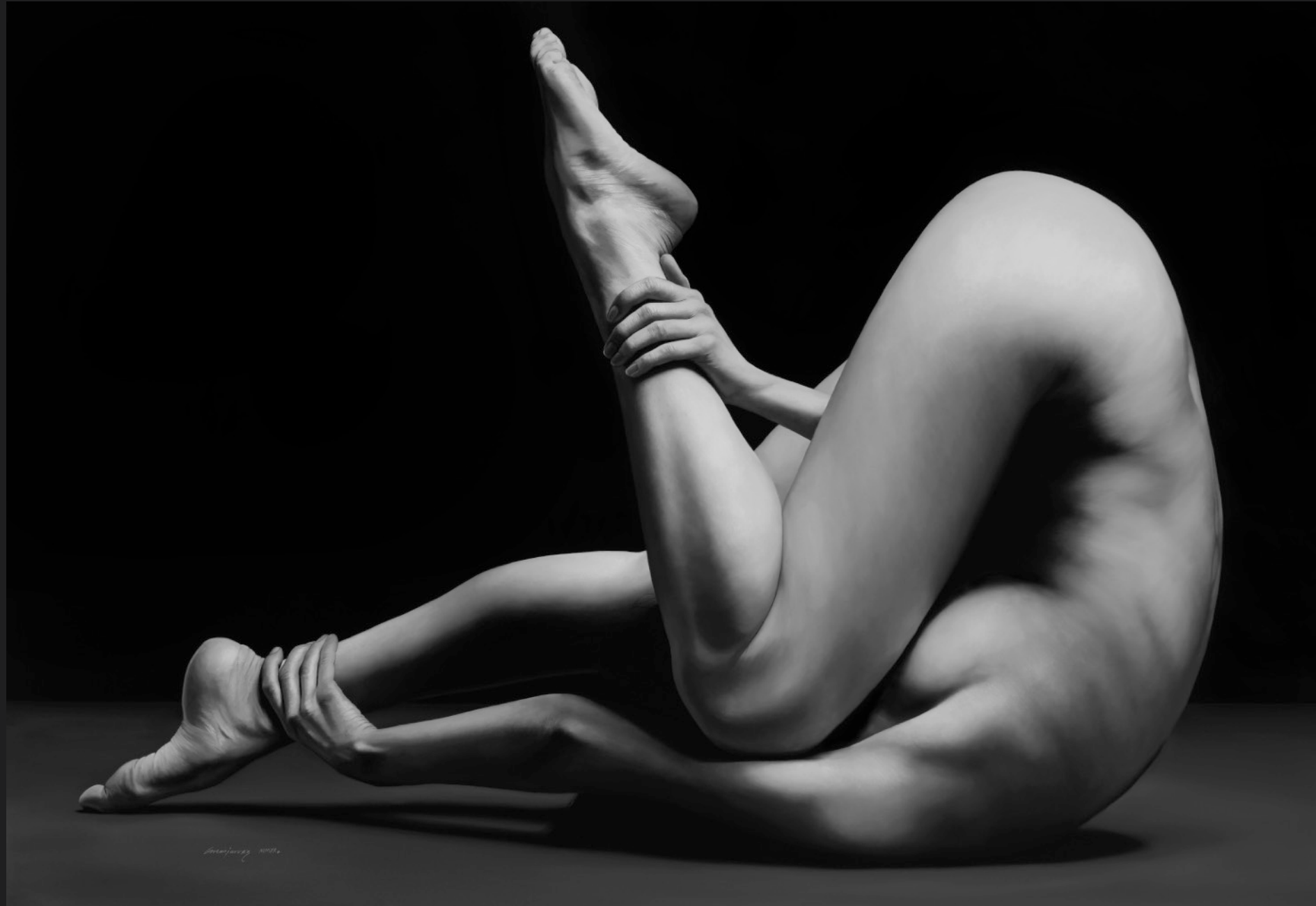
Abstract nude, 2021, Oil on canvas, 130 x 190 cm