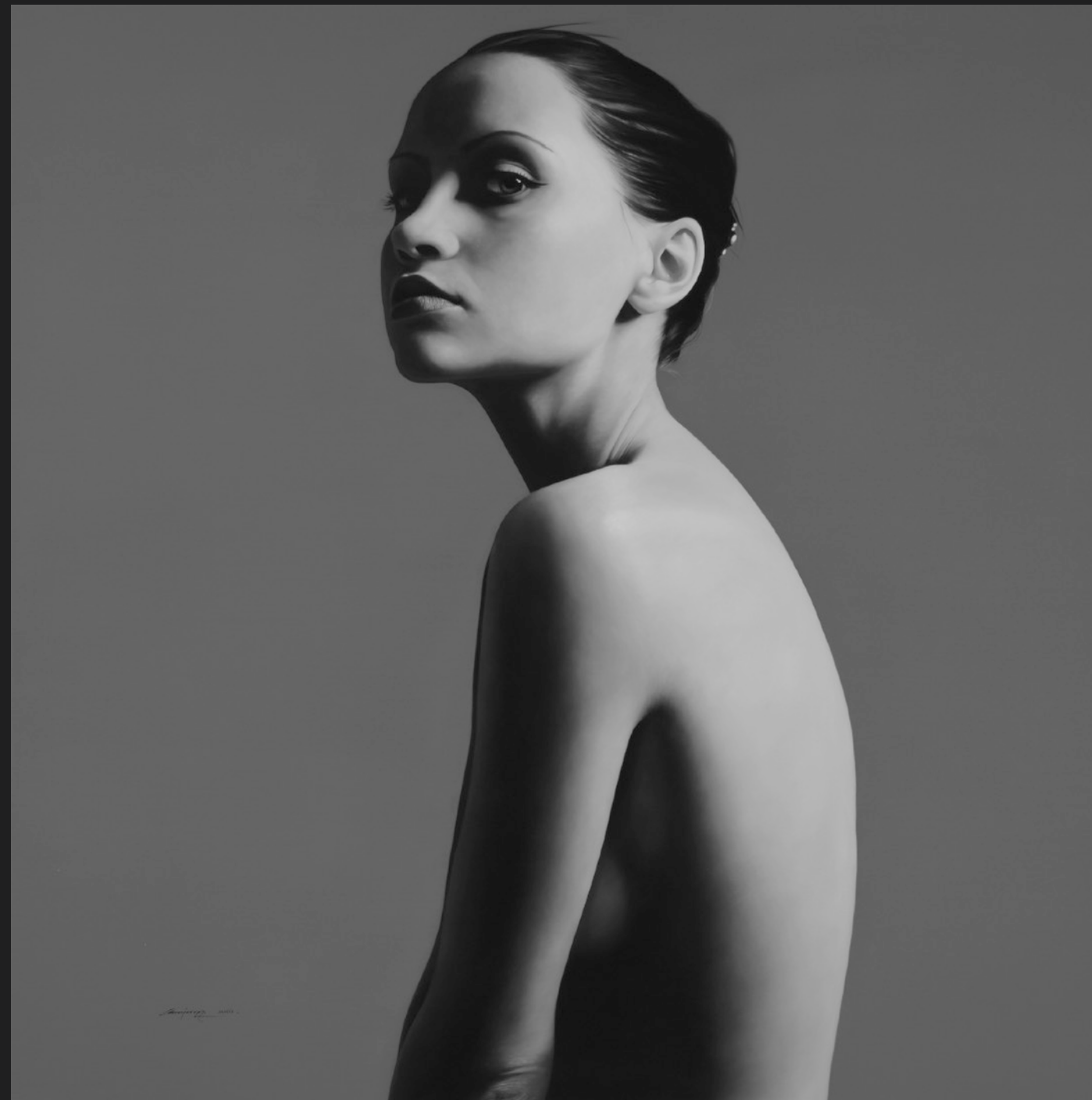
The mirror , 2021, Oil on canvas, 120 x 220 cm