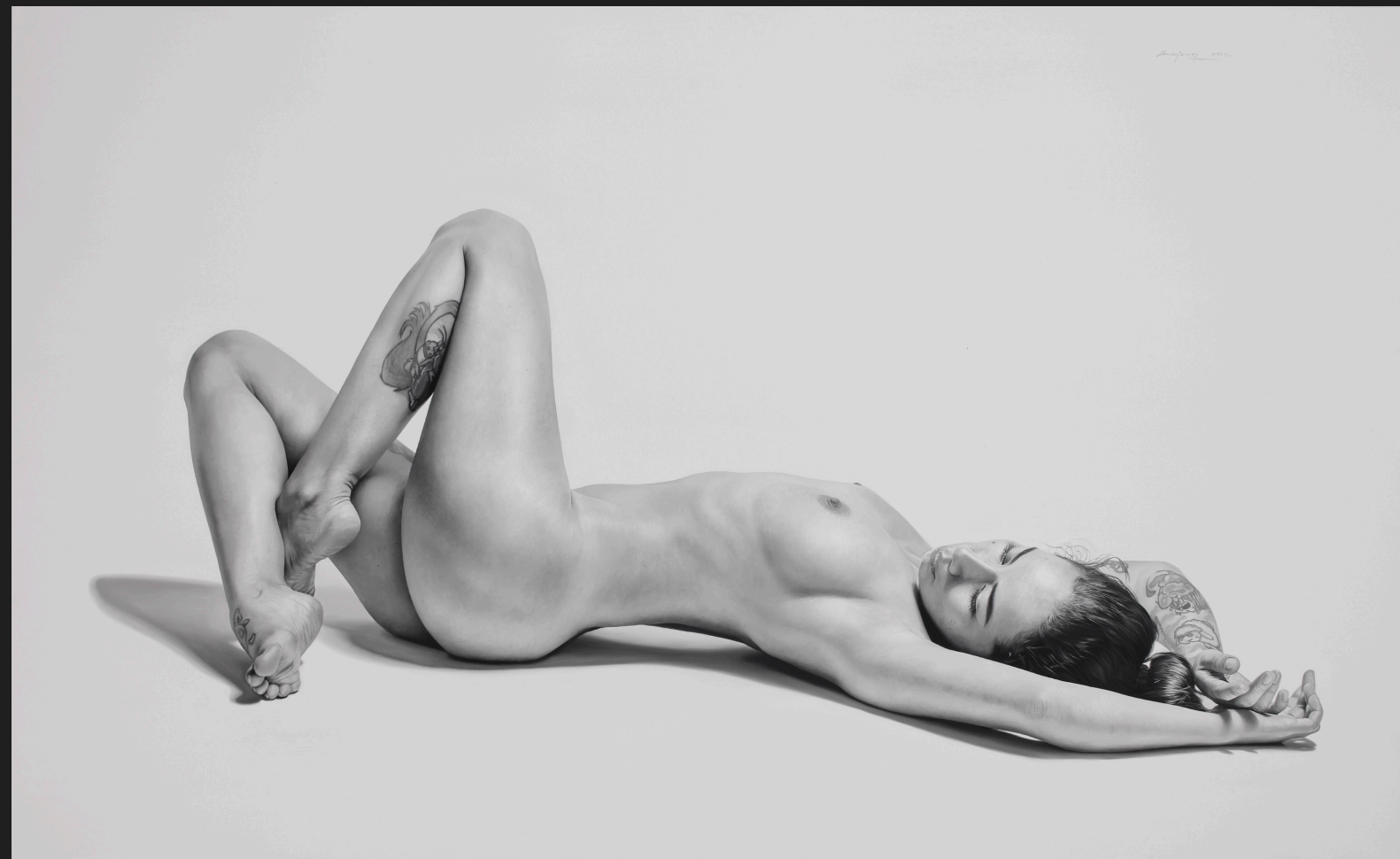
Alahia , 2019, Oil on canvas, 130 x 210 cm