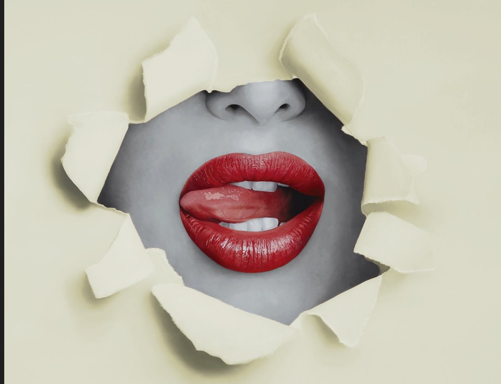
The beige package, 2021, Oil on canvas, Diptych, 150 x 150 cm