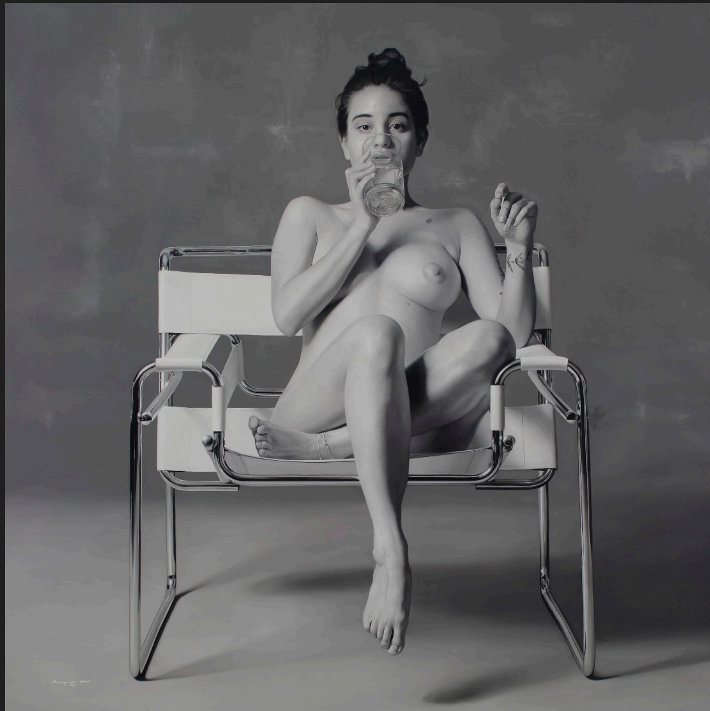
Glass of water , 2019, Oil on canvas, 180 x 180 cm