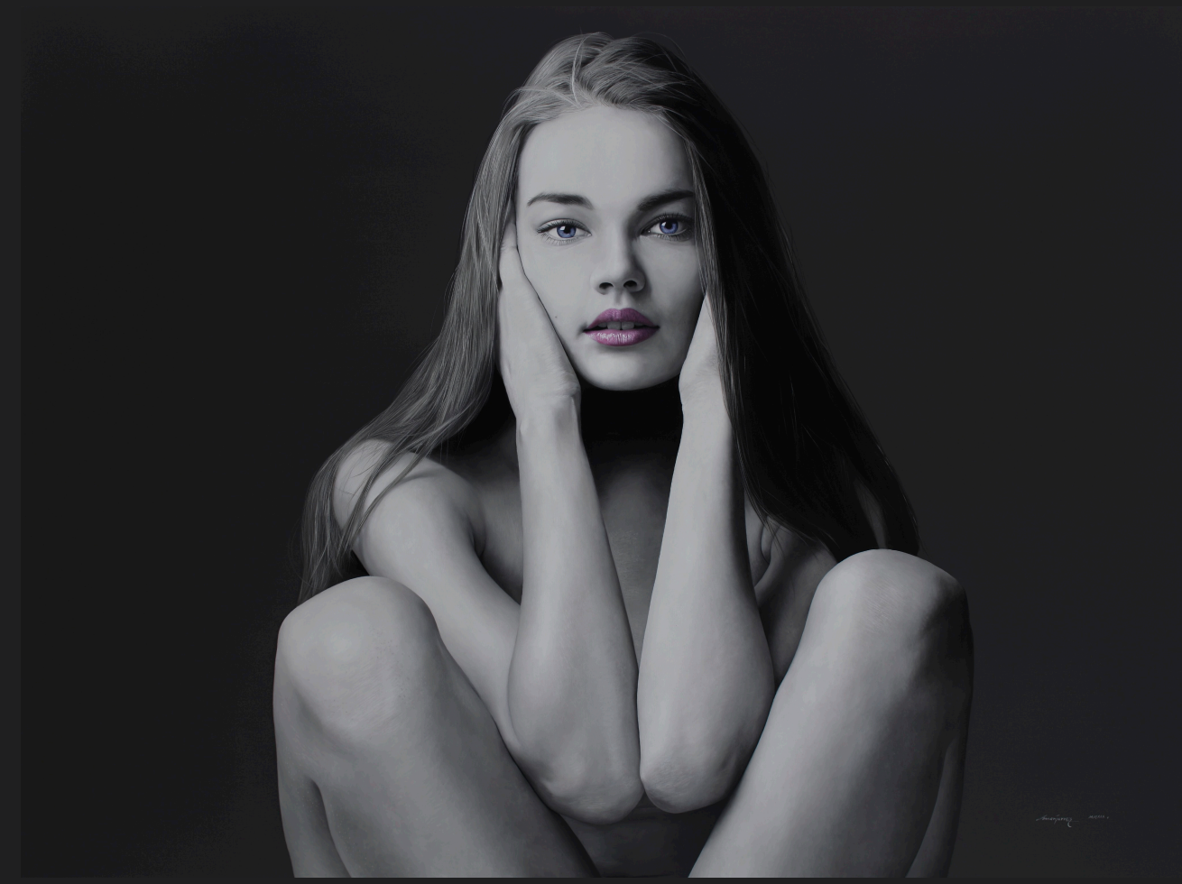
Lolita , 2019, Oil on canvas, 147 x 200 cm