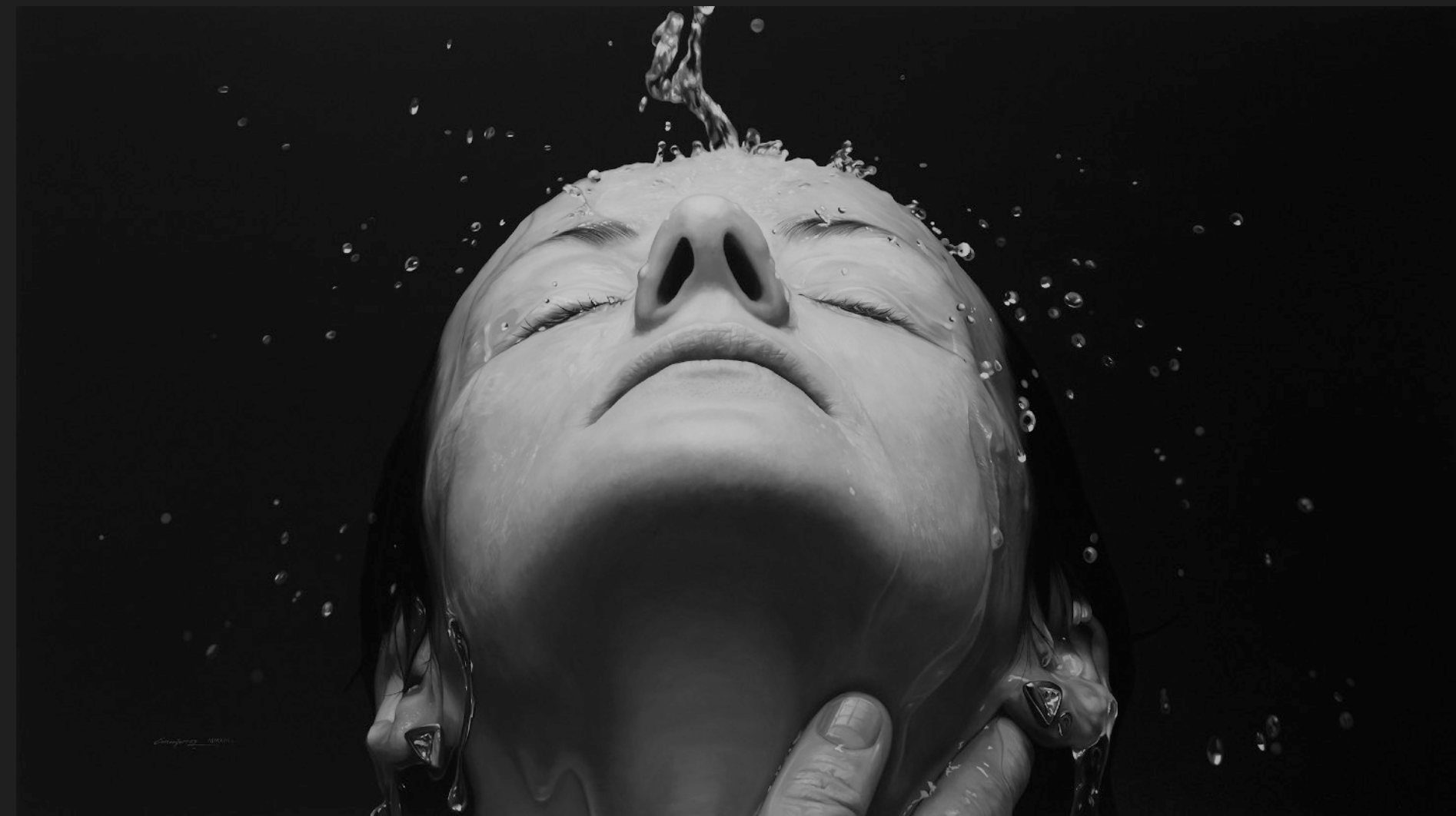
Refreshing, 2013, Oil on canvas, 130 x 230 cm