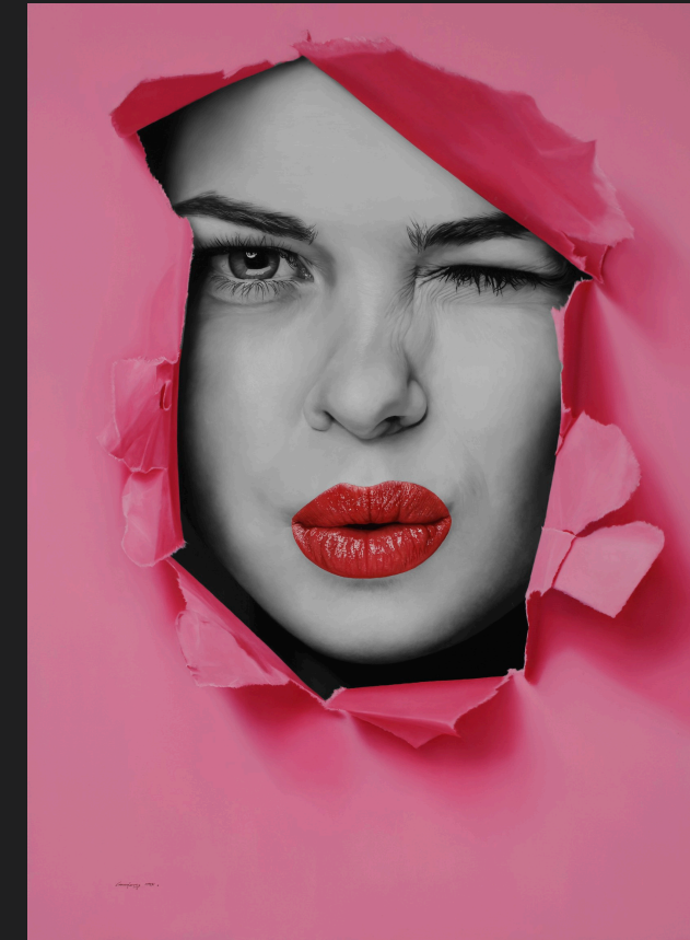
The kiss in pink package, 2021, Oil on canvas, 180 x 130 cm