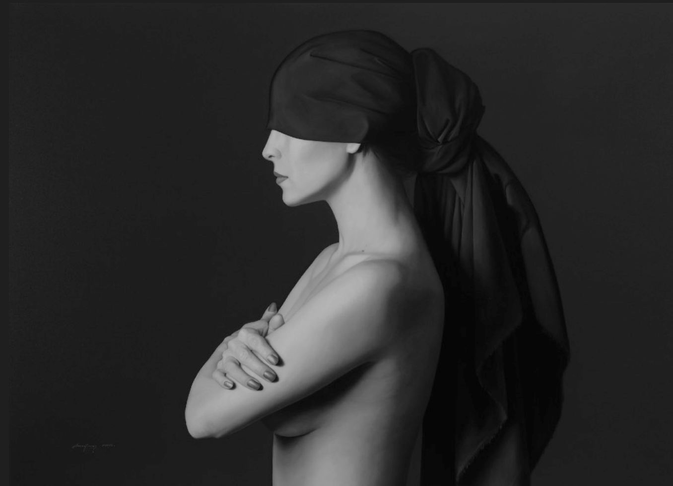
The unconditional wait, 2020, Oil on canvas, 180 x 130 cm