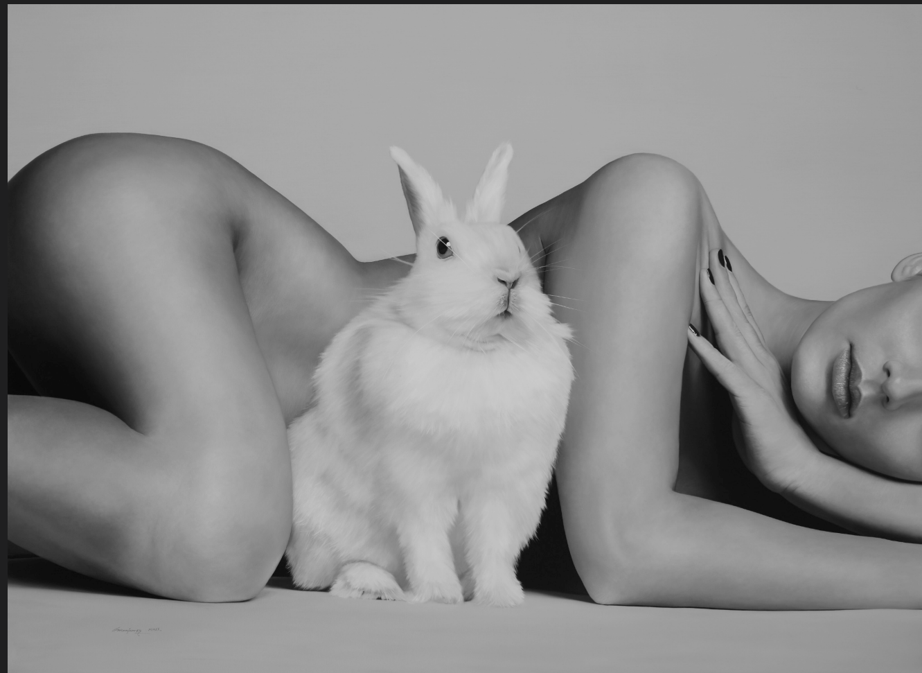
Lady Rabbit I , 2020, Oil on canvas, 140 x 190 cm