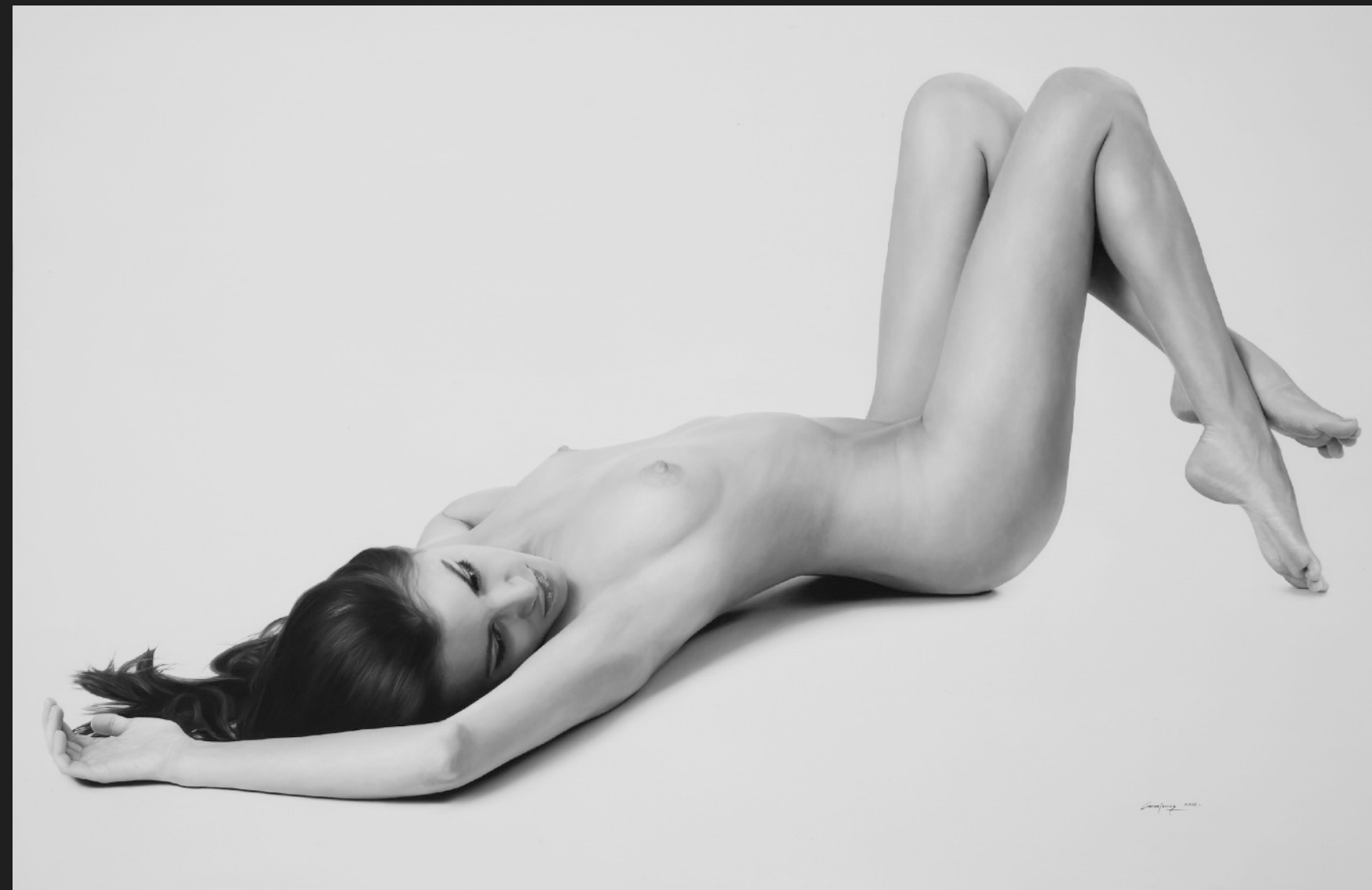
The awakening , 2020, Oil on canvas, 130 x 200 cm