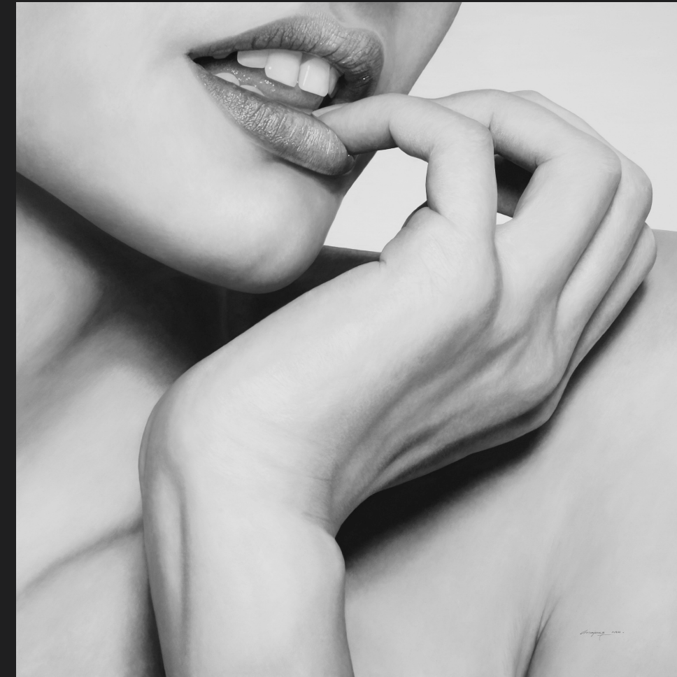
The little touch of seduction, 2020, Oil on canvas, 160 x 160 cm