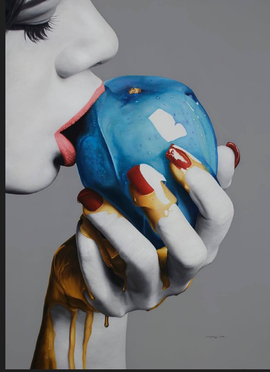
Eva's cynicism , 2020, Oil on canvas, 4 pieces, 180 x 130 cm