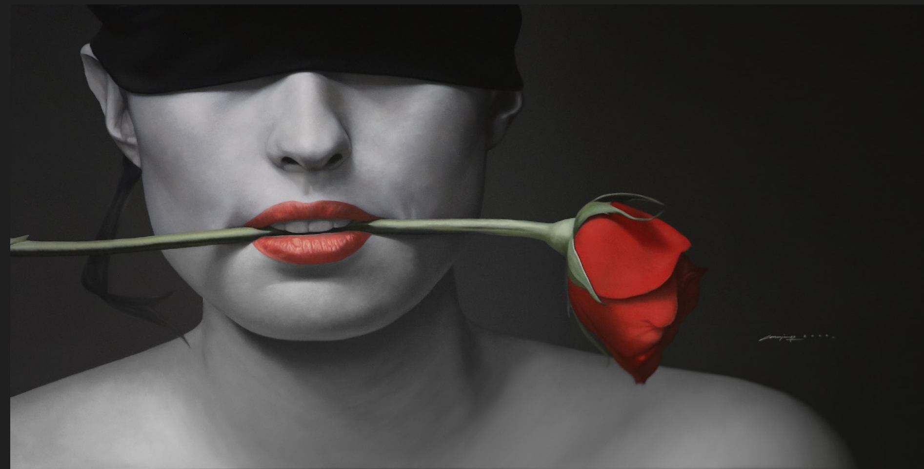
Fragility , 2012, Oil on canvas, 110 x 220 cm