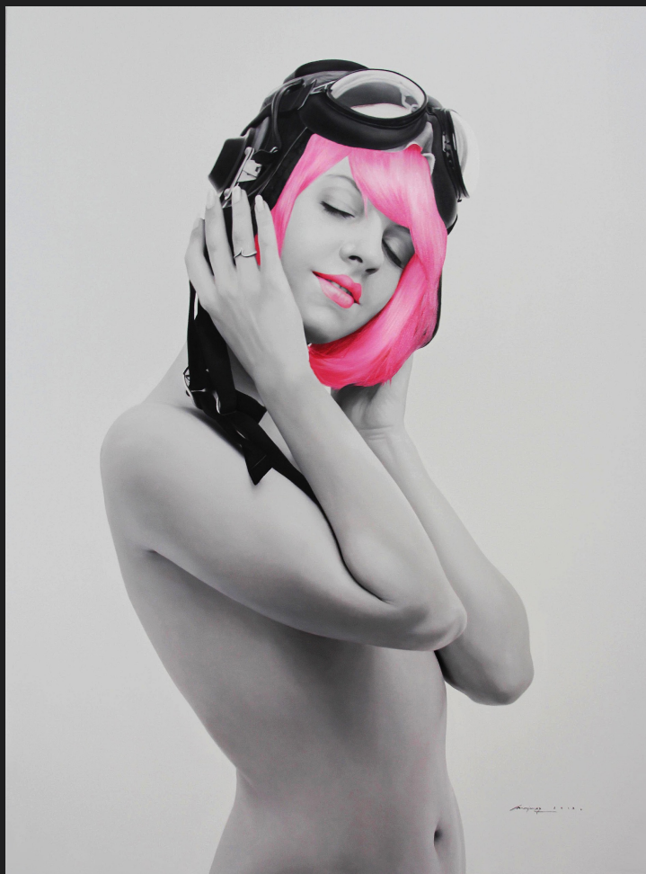
The aviator's woman , 2013, Oil on canvas, 180 x 130 cm