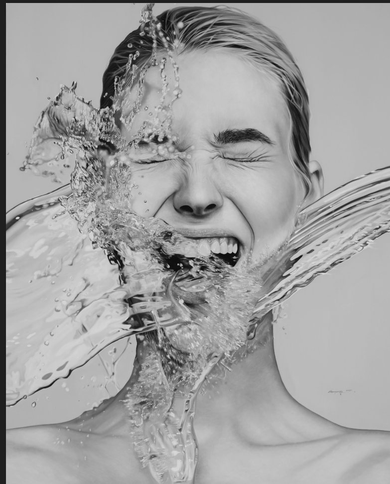
Splash! , 2021, Oil on canvas, 145 x 180 cm