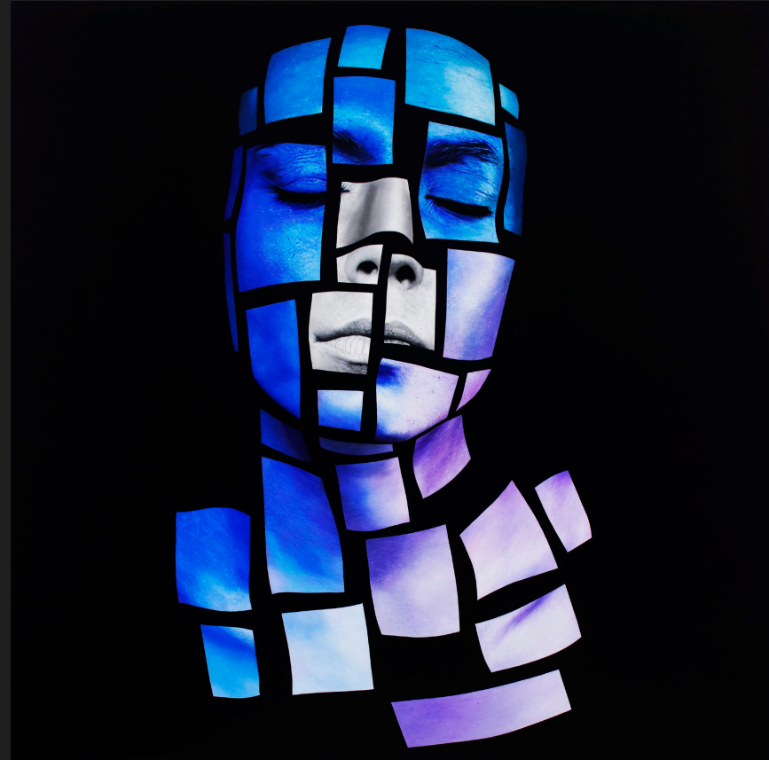
Fragmenta, 2021, Oil on canvas, 200 x 200 cm