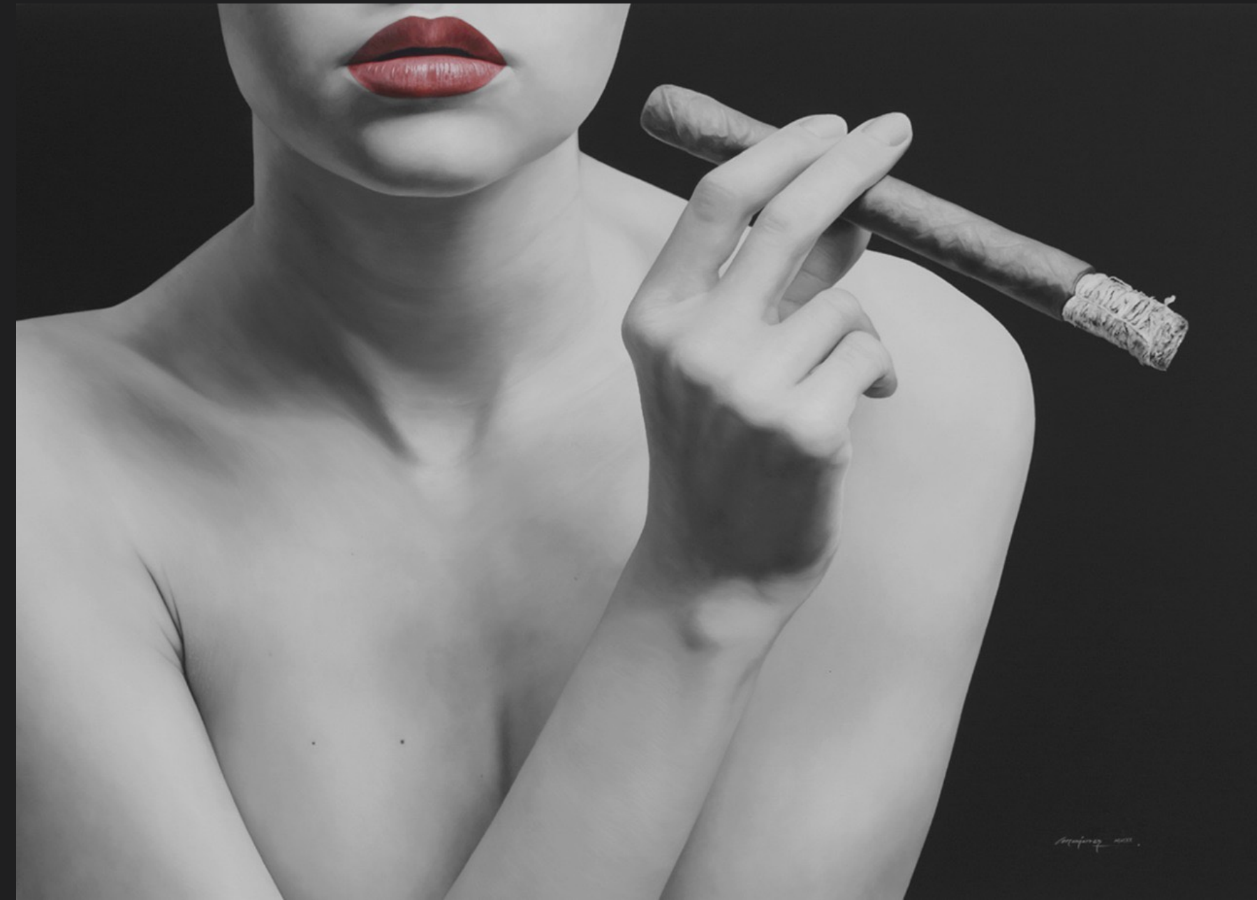
A little touch of seduction , 2019, Oil on canvas, 130 x 180 cm