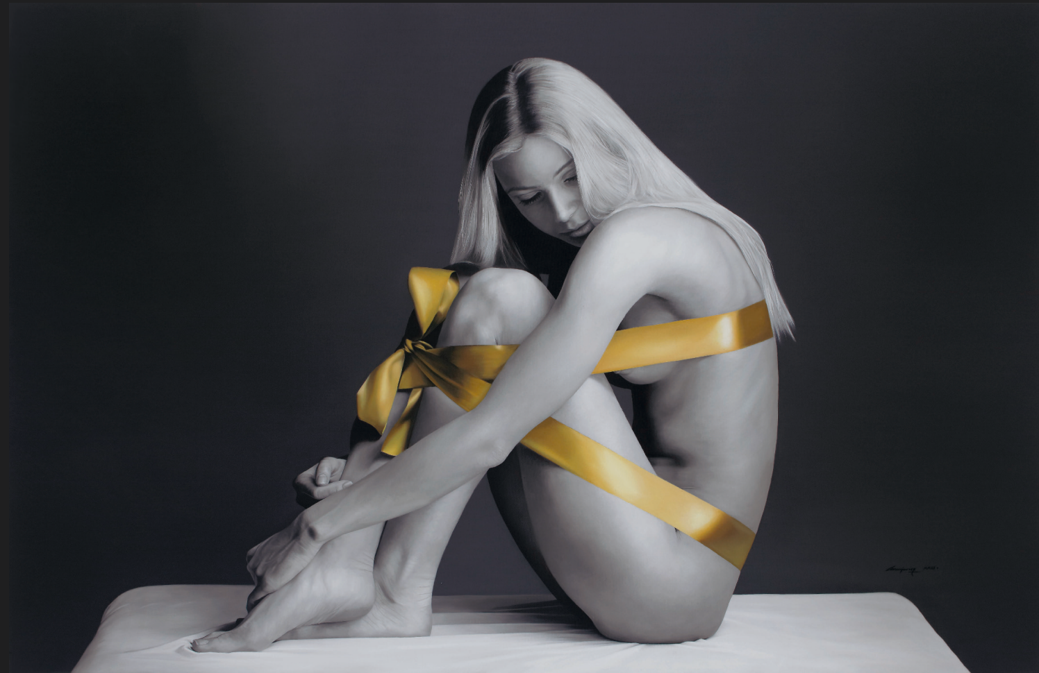
The golden gift, 2020, Oil on canvas, 130 x 200 cm