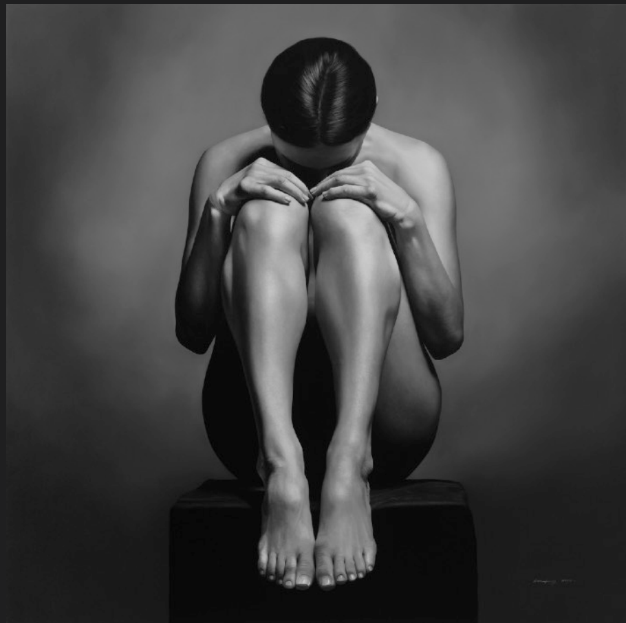
Introspection , 2019, Oil on canvas, 180 x 180 cm