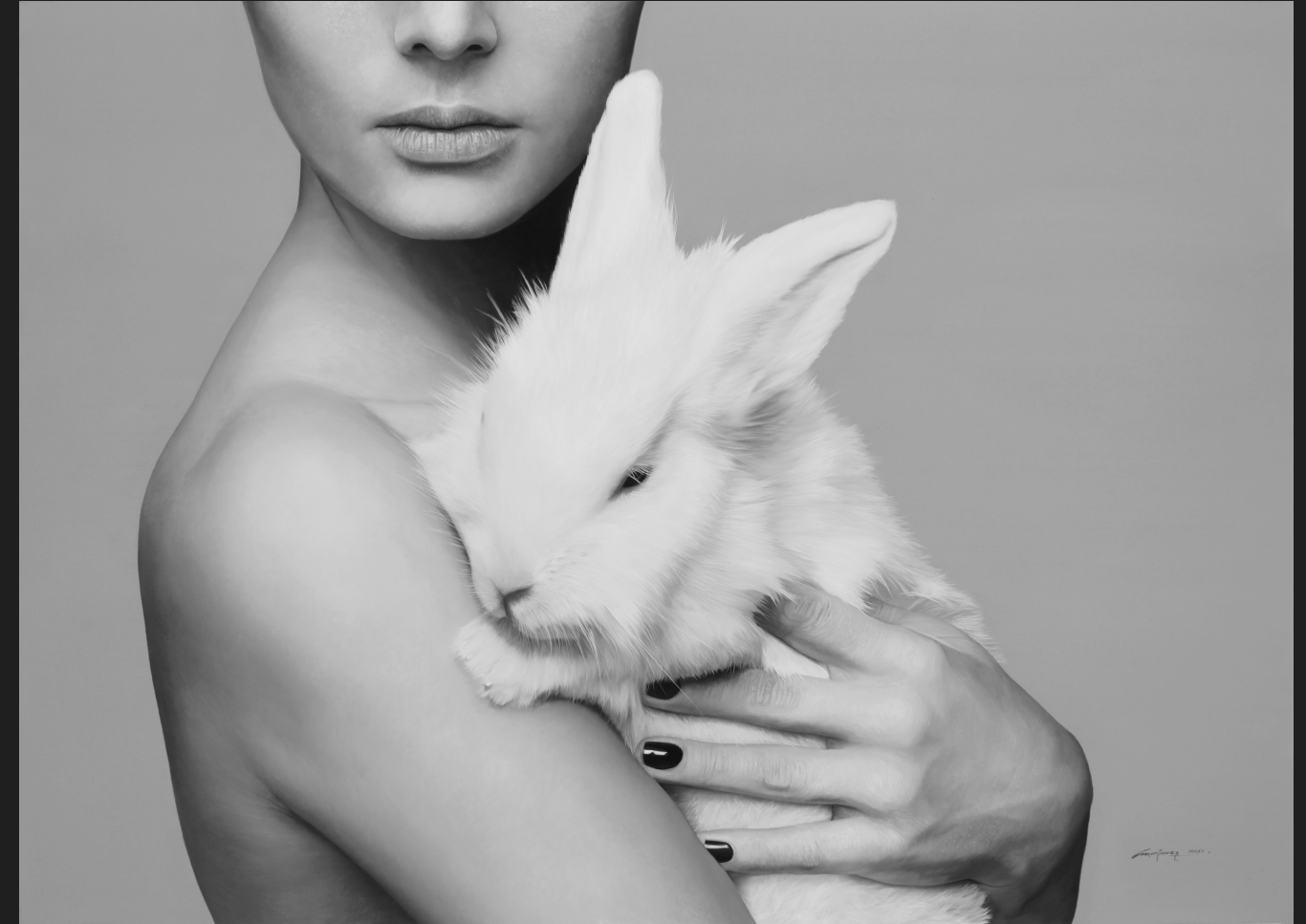
Lady Rabbit, 2015, Oil on canvas, 130 x 180 cm