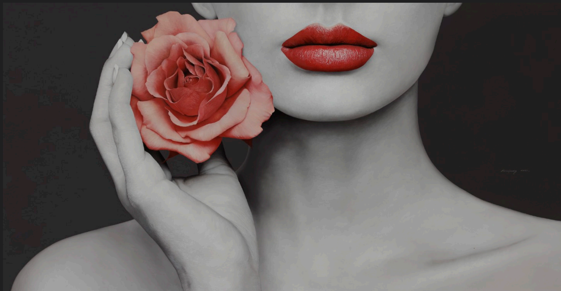
Fragility III , 2021, Oil on canvas, 130 x 250 cm