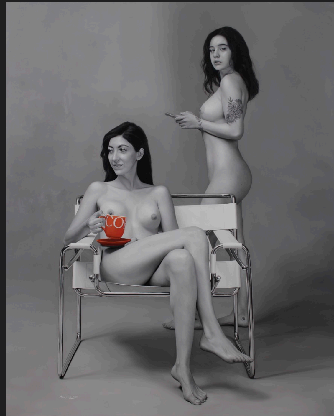
Coffee time , 2019, Oil on canvas, 240 x 185 cm