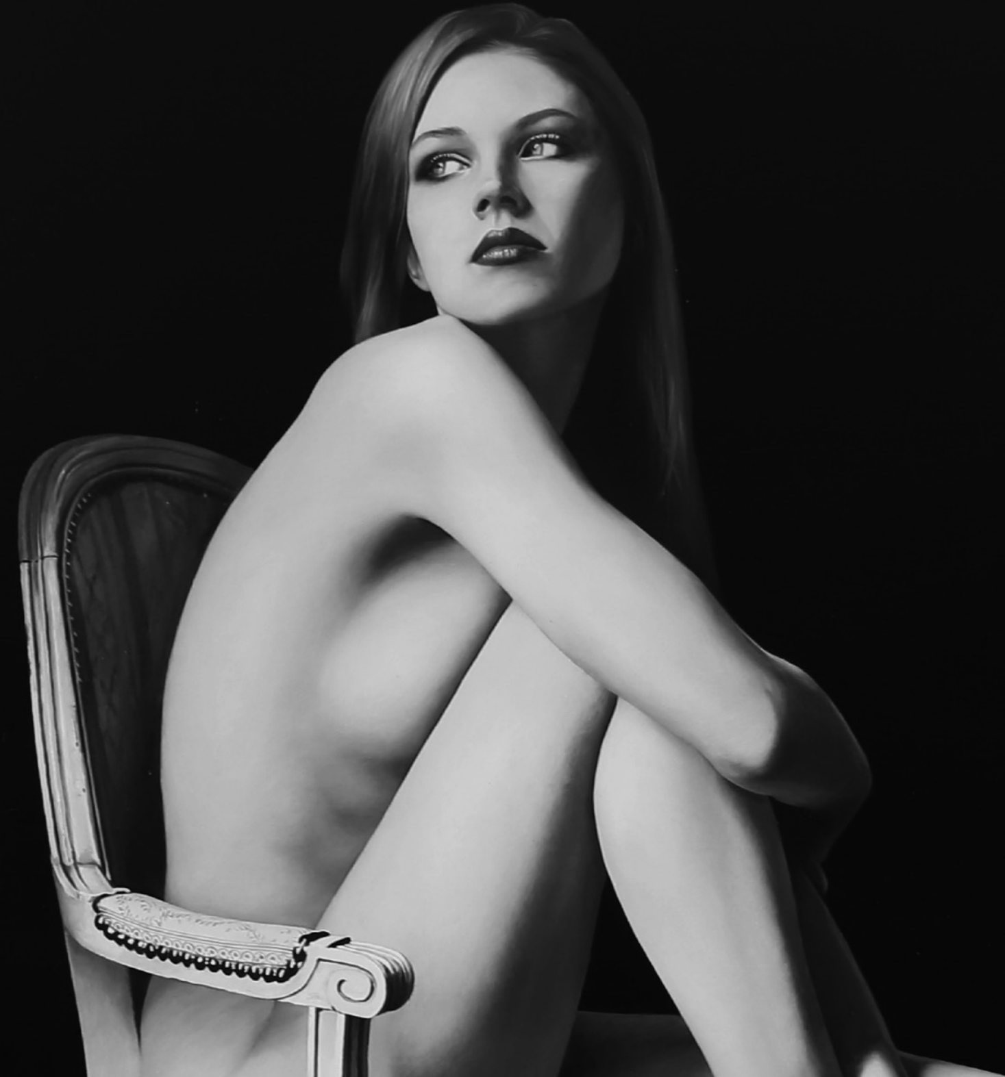
Bath at sunrise. , 2017, Oil on canvas, 180 x 130 cm Memories of what could have been and was not. , 2020, Oil on canvas, 180 x 130 cm