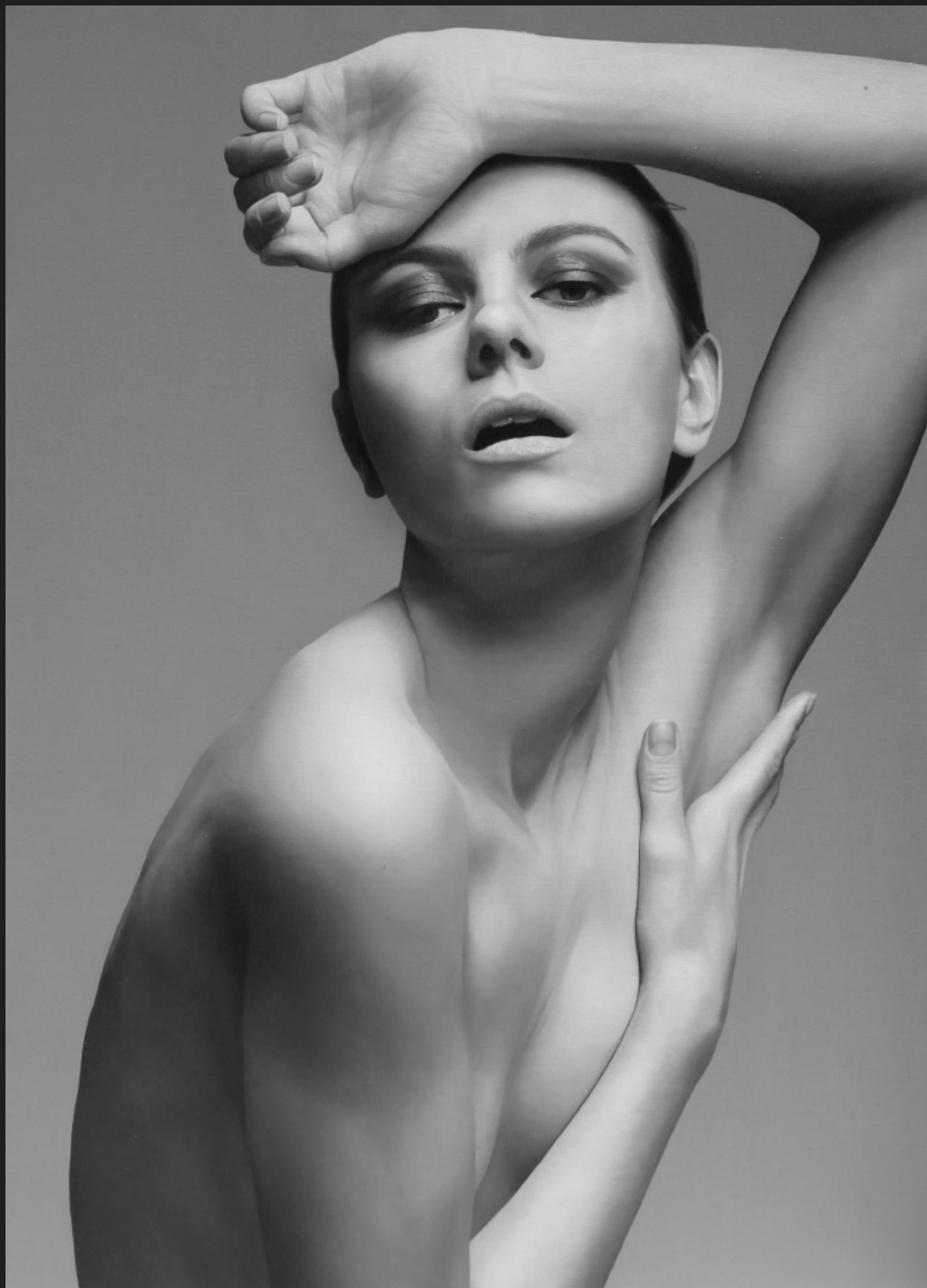
The mirror , 2021, Oil on canvas, 120 x 220 cm