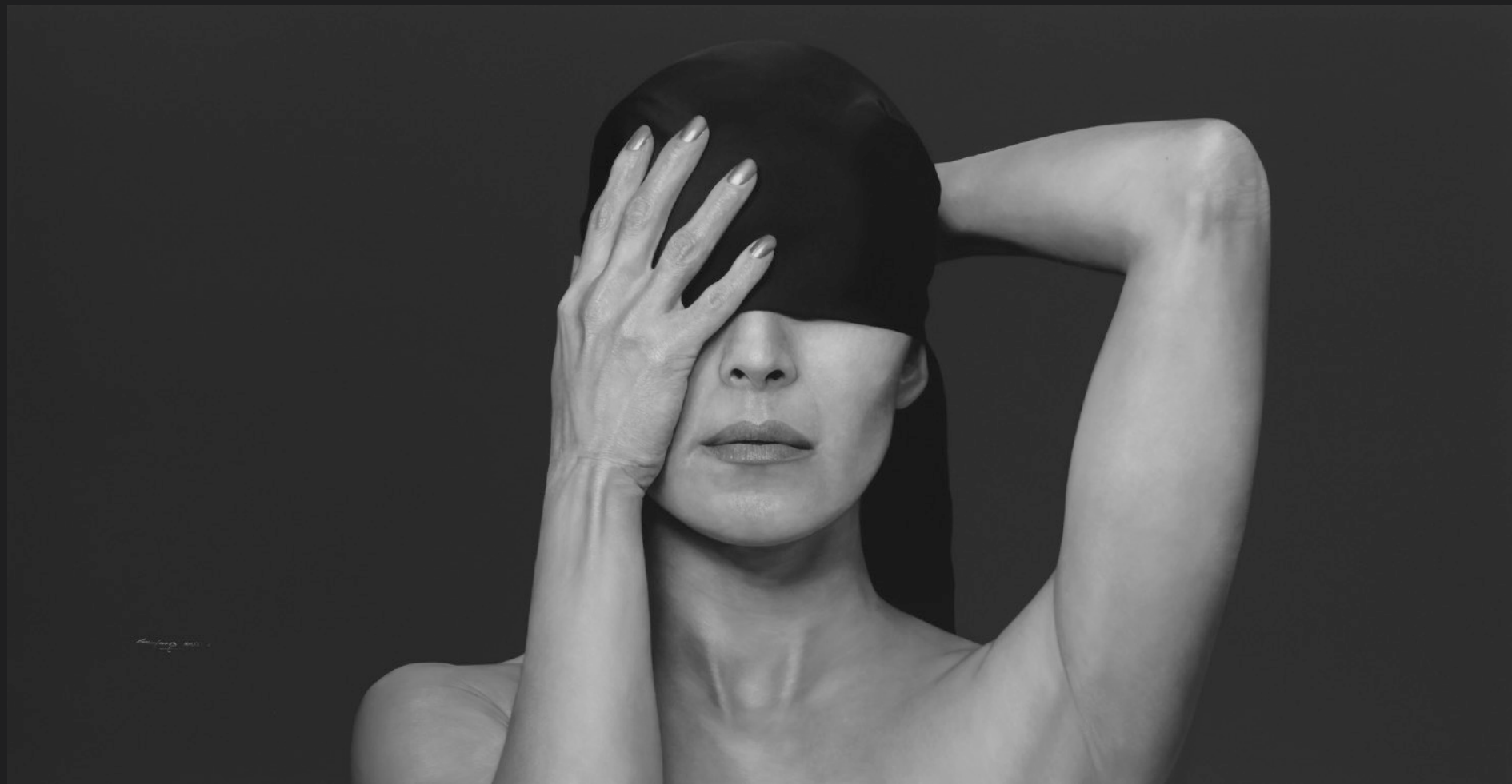
Essay on blindness, 2021, Oil on canvas, 130 x 250 cm