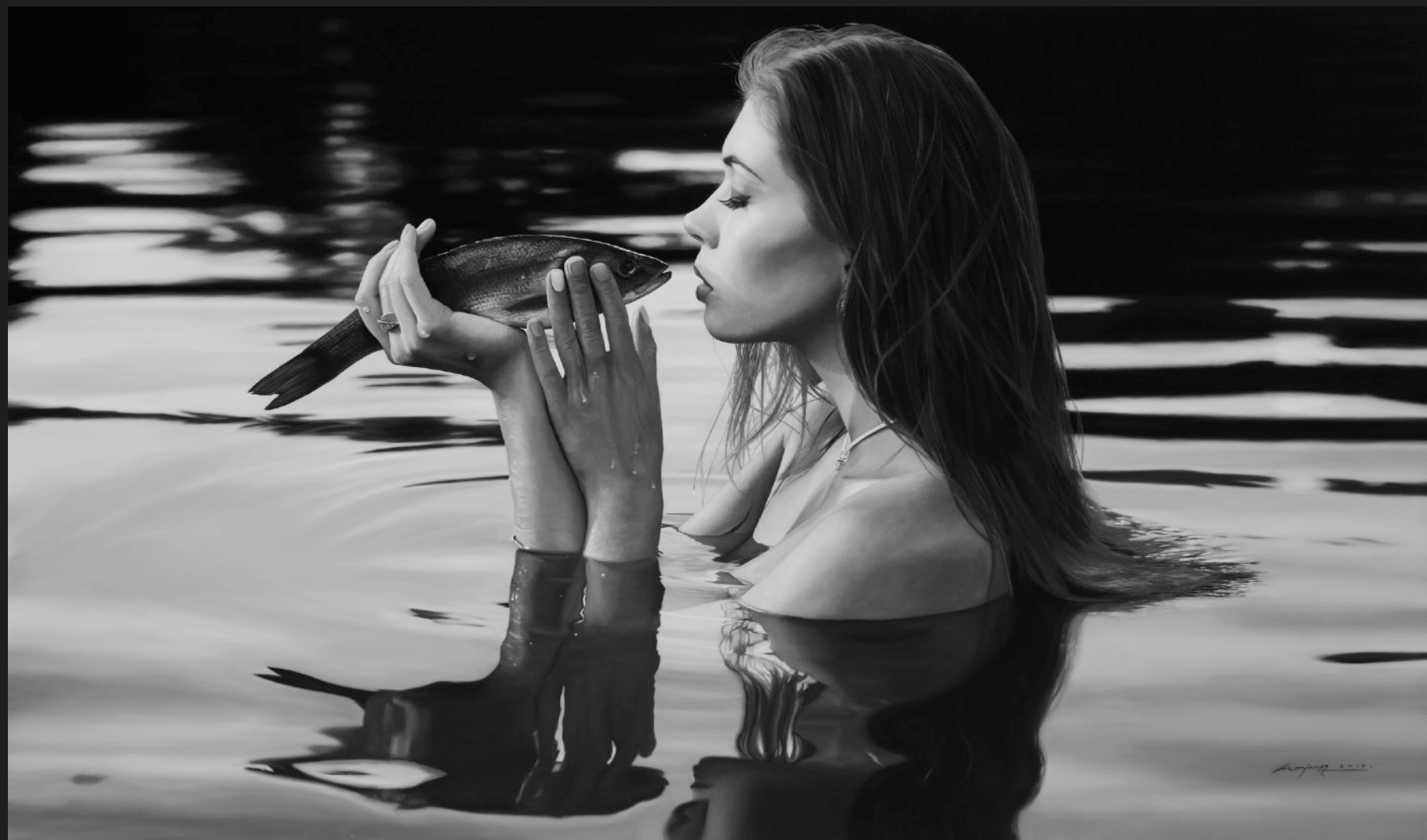
Inciting a kiss, 2018, Oil on canvas, 130 x 220 cm