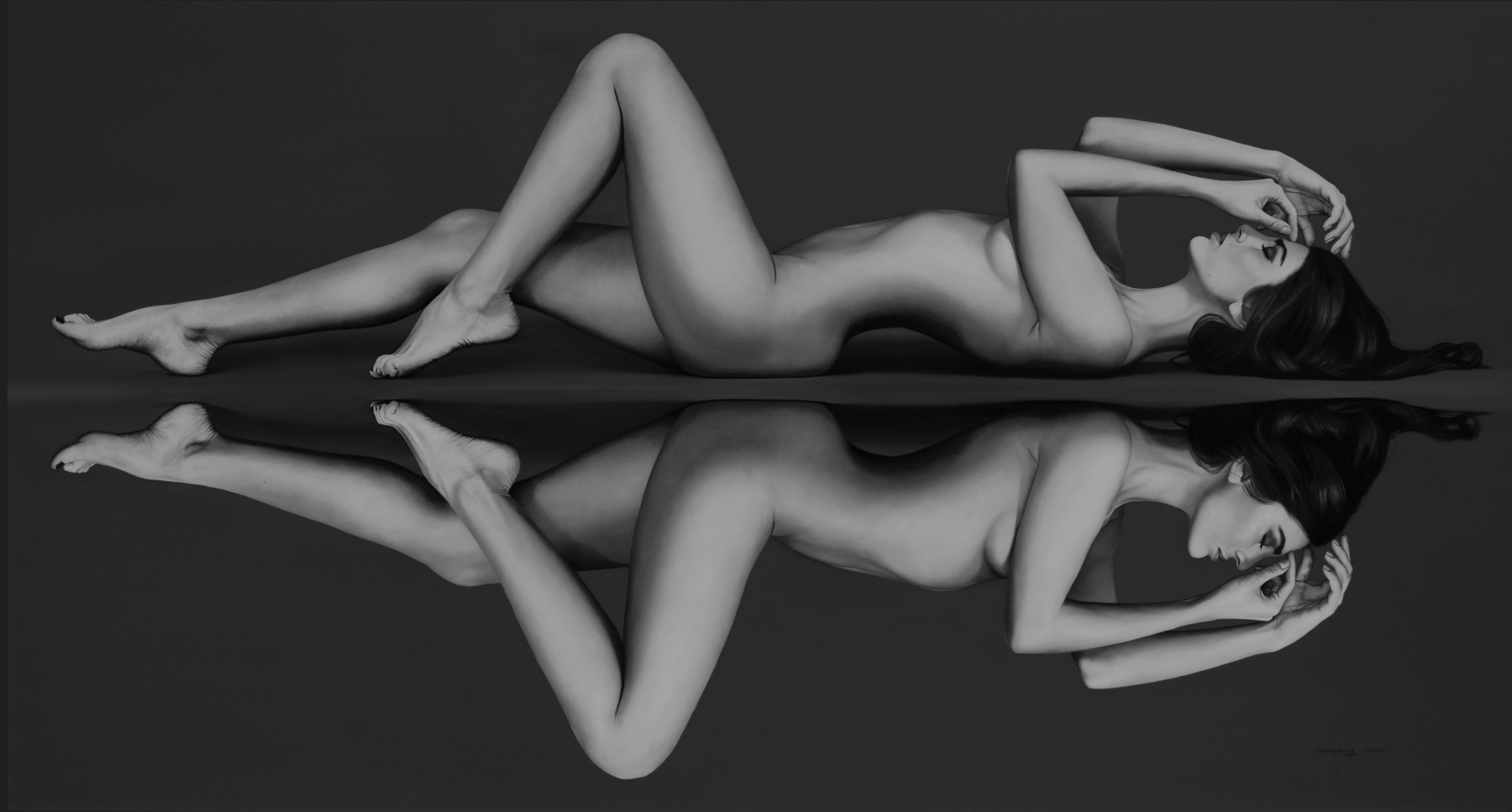
The mirror, 2021, Oil on canvas, 120 x 220 cm