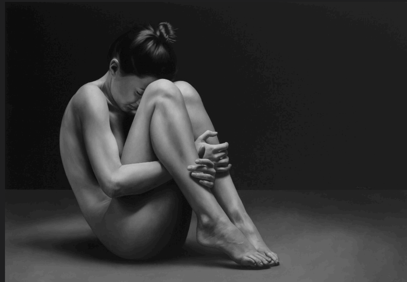
Introspection II , 2021, Oil on canvas, 165 x 240 cm