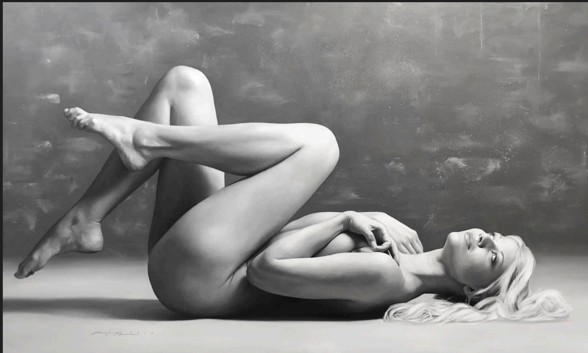
Dreaming , 2019, Oil on canvas, 120 x 200 cm