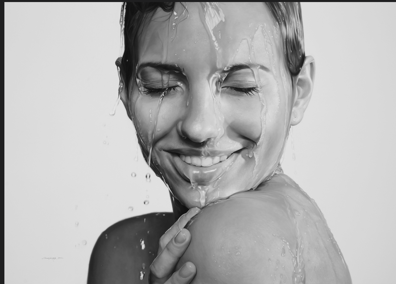
Refreshing I, 2020, Oil on canvas, 130 x 180 cm