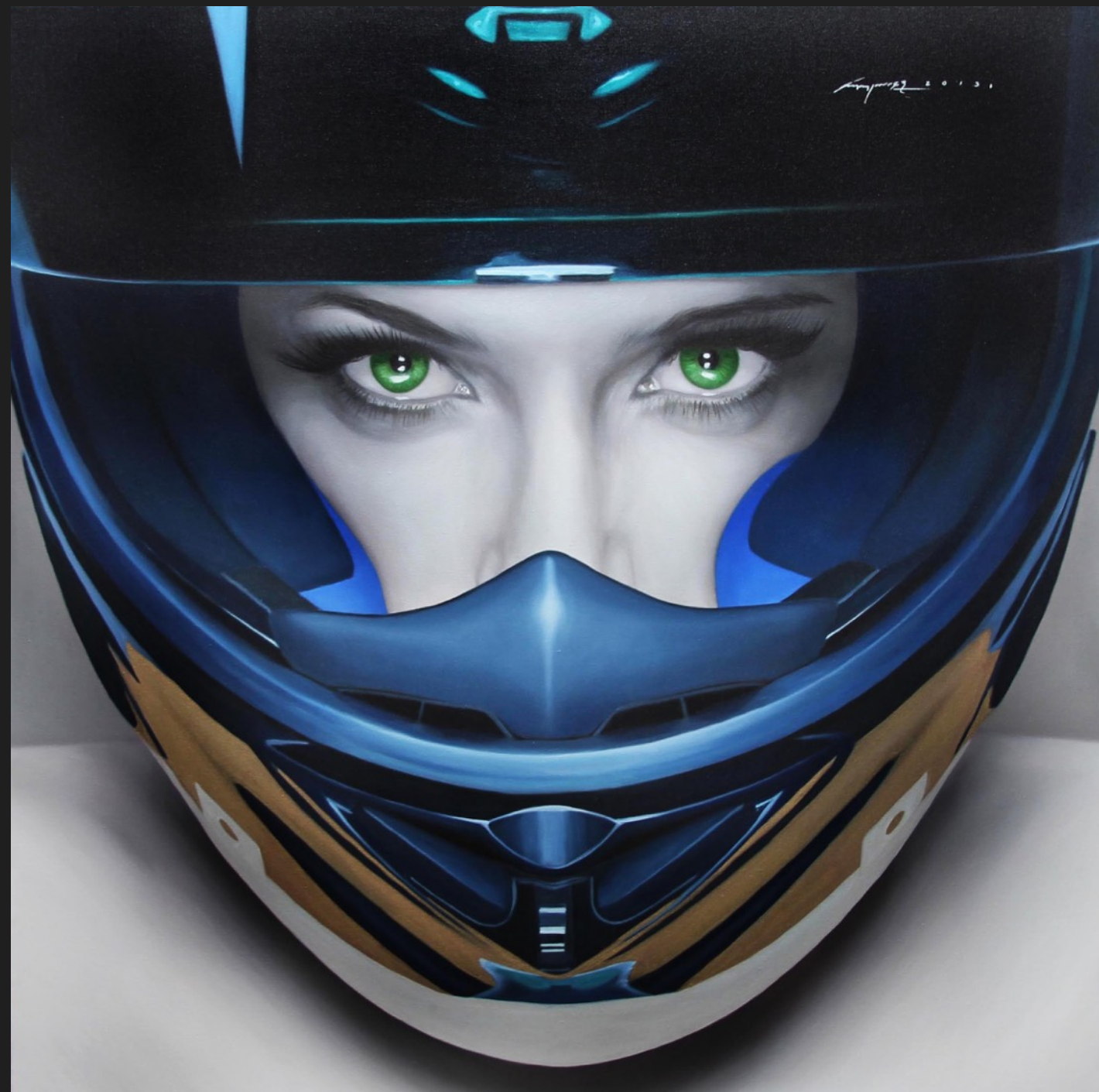
The blue helmet I, 2013, Oil on canvas, 100 x 100 cm