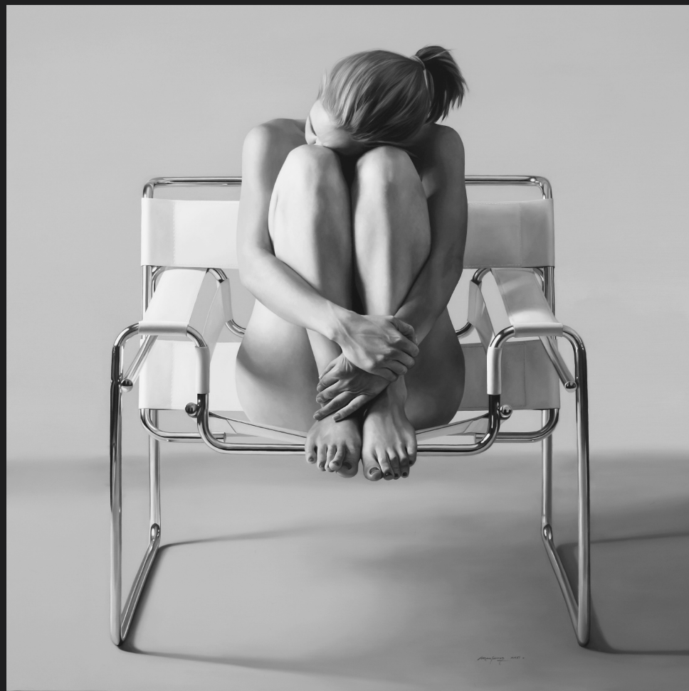
Introspection, 2011, Oil on canvas, 160 x 160 cm