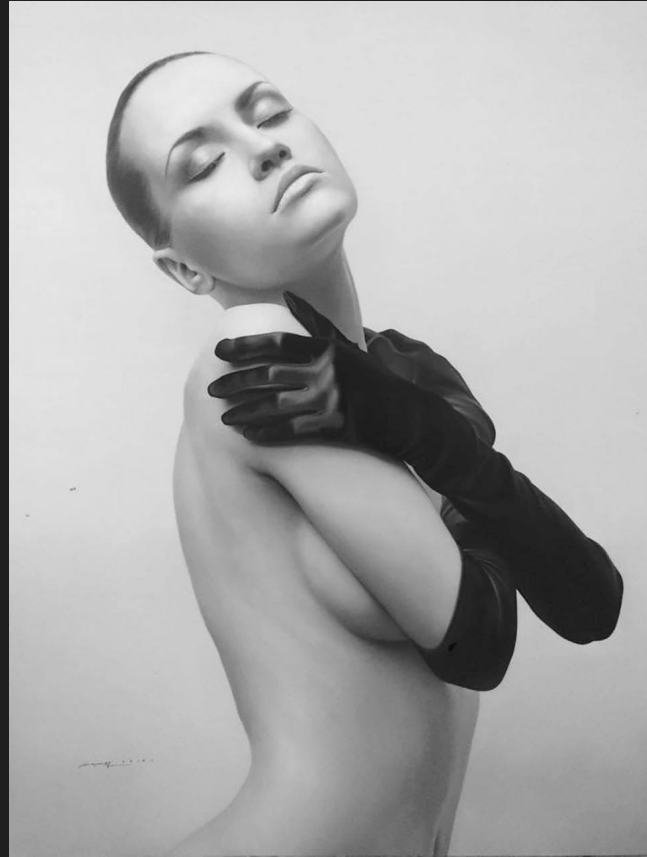
Black silk gloves, 2017, Oil on canvas, 200 x 147 cm