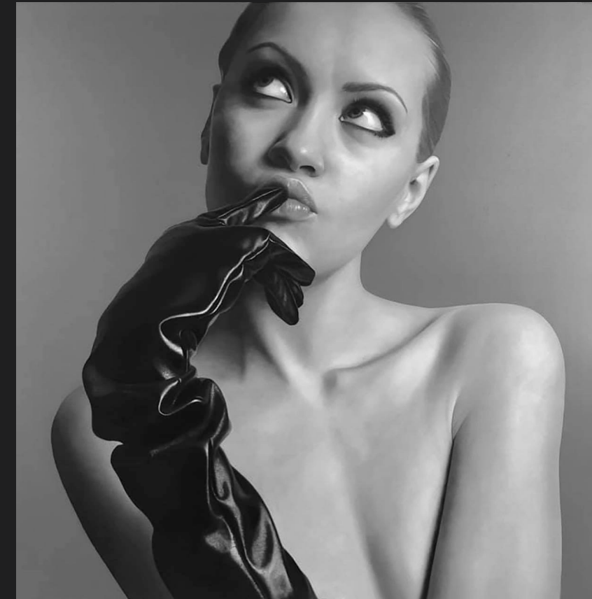
Just thinking , 2018, Oil on canvas, 160 x 160 cm