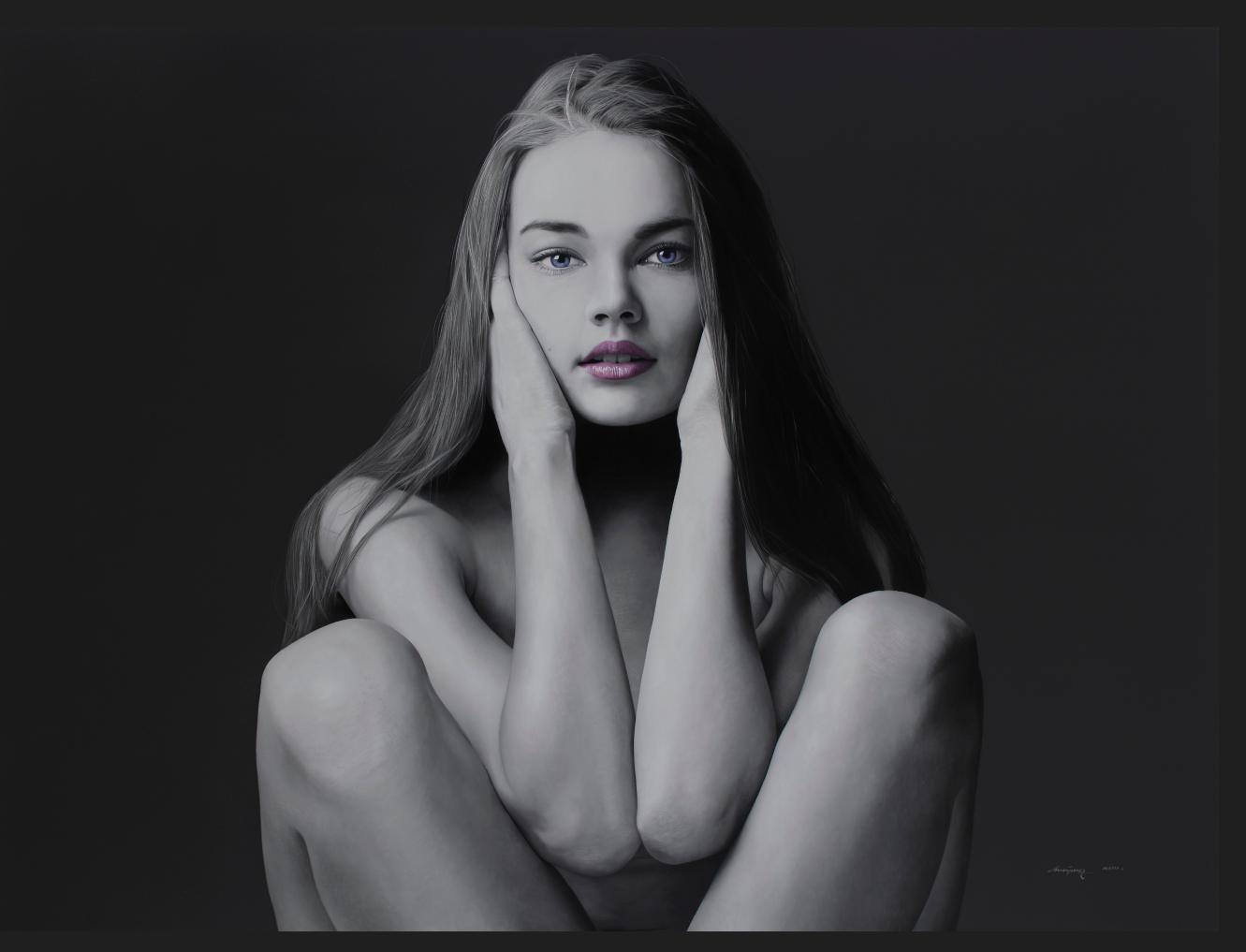
Lolita , 2019, Oil on canvas, 147 x 200 cm