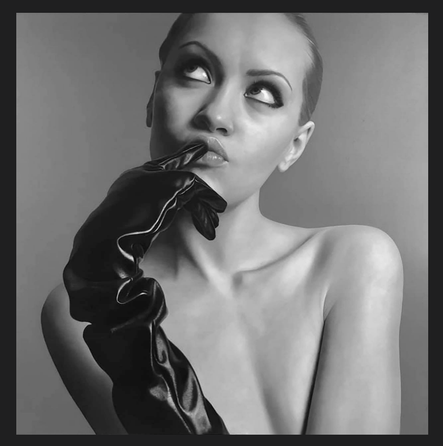
Just thinking, 2018, Oil on canvas, 160 x 160 cm