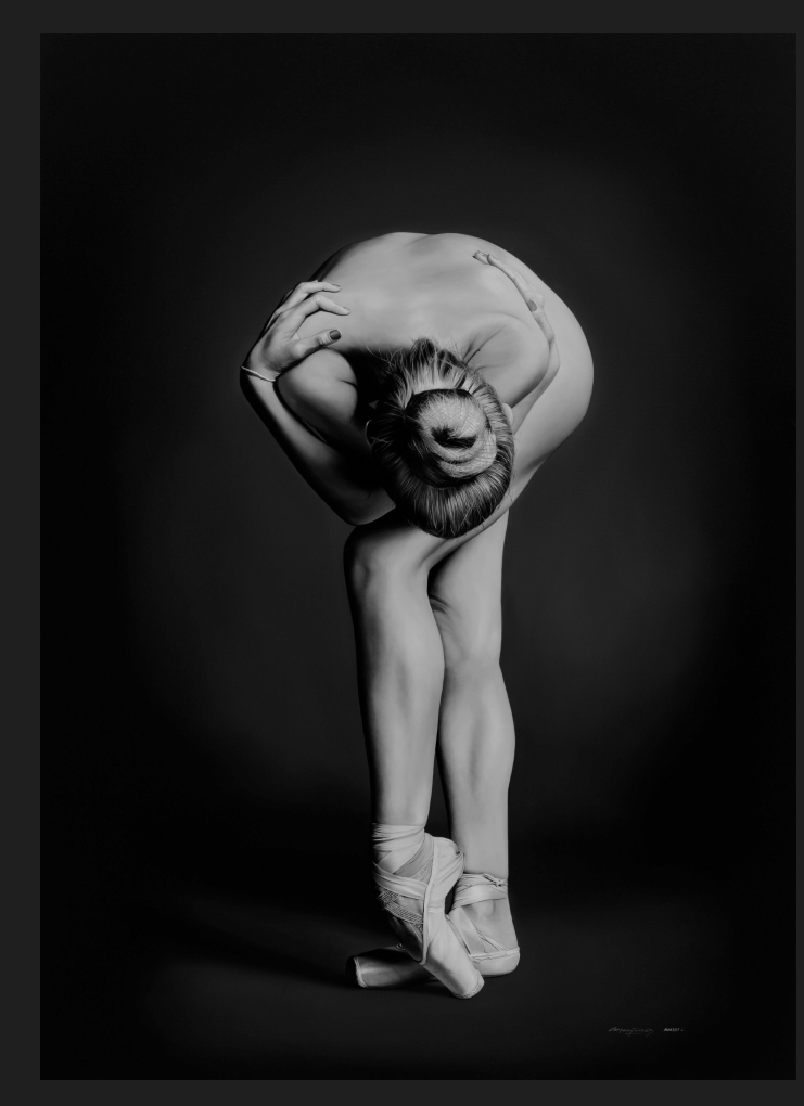
Dancer I , 2021, Oil on canvas, 180 x 130 cm