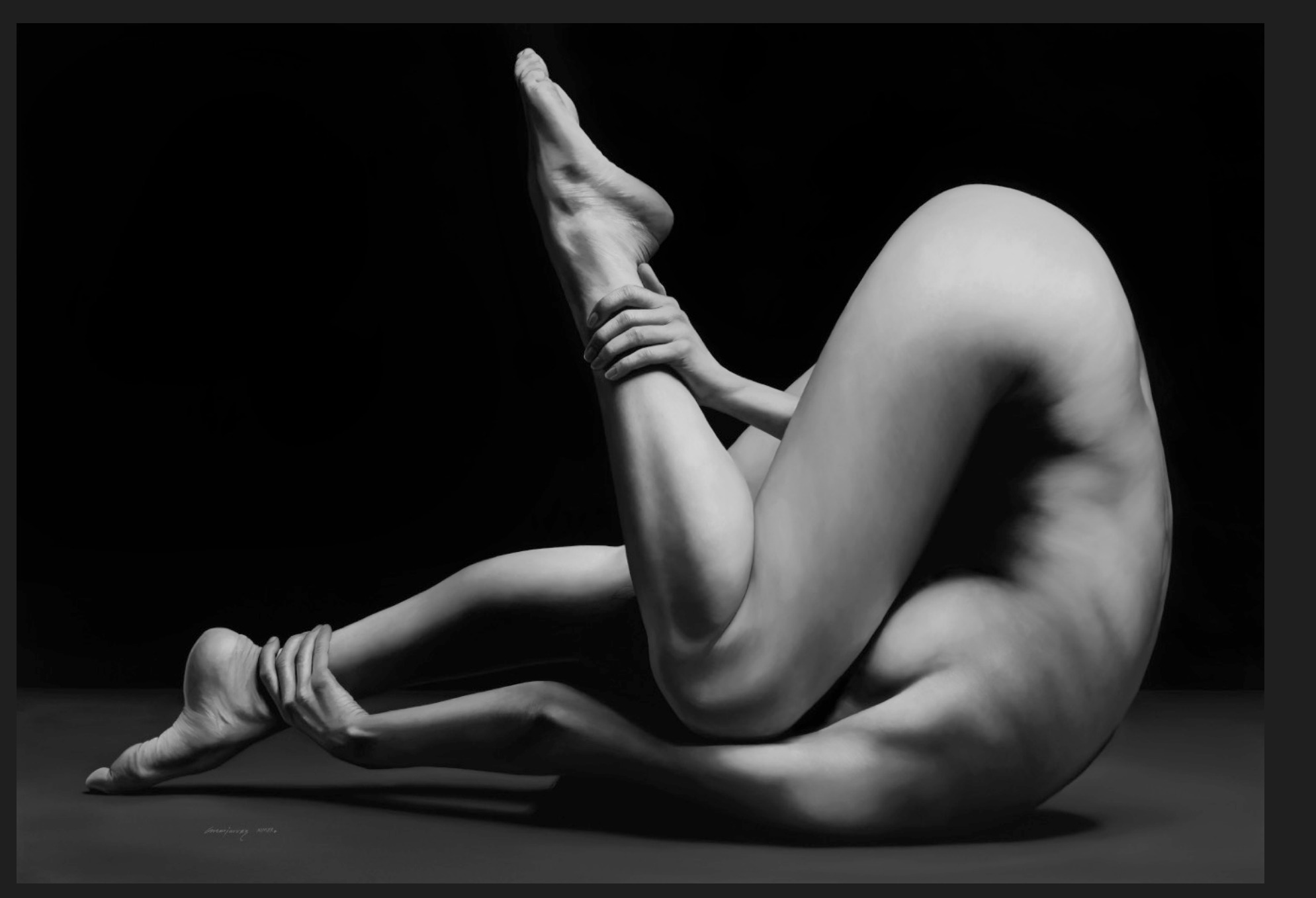
Abstract nude, 2021, Oil on canvas, 130 x 190 cm