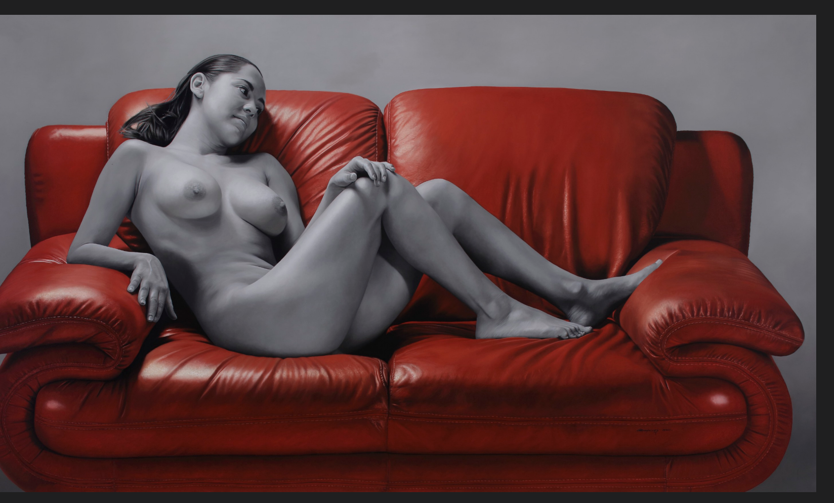
The Maja of the red chair, 2020, Oil on canvas, 140 x 250 cm