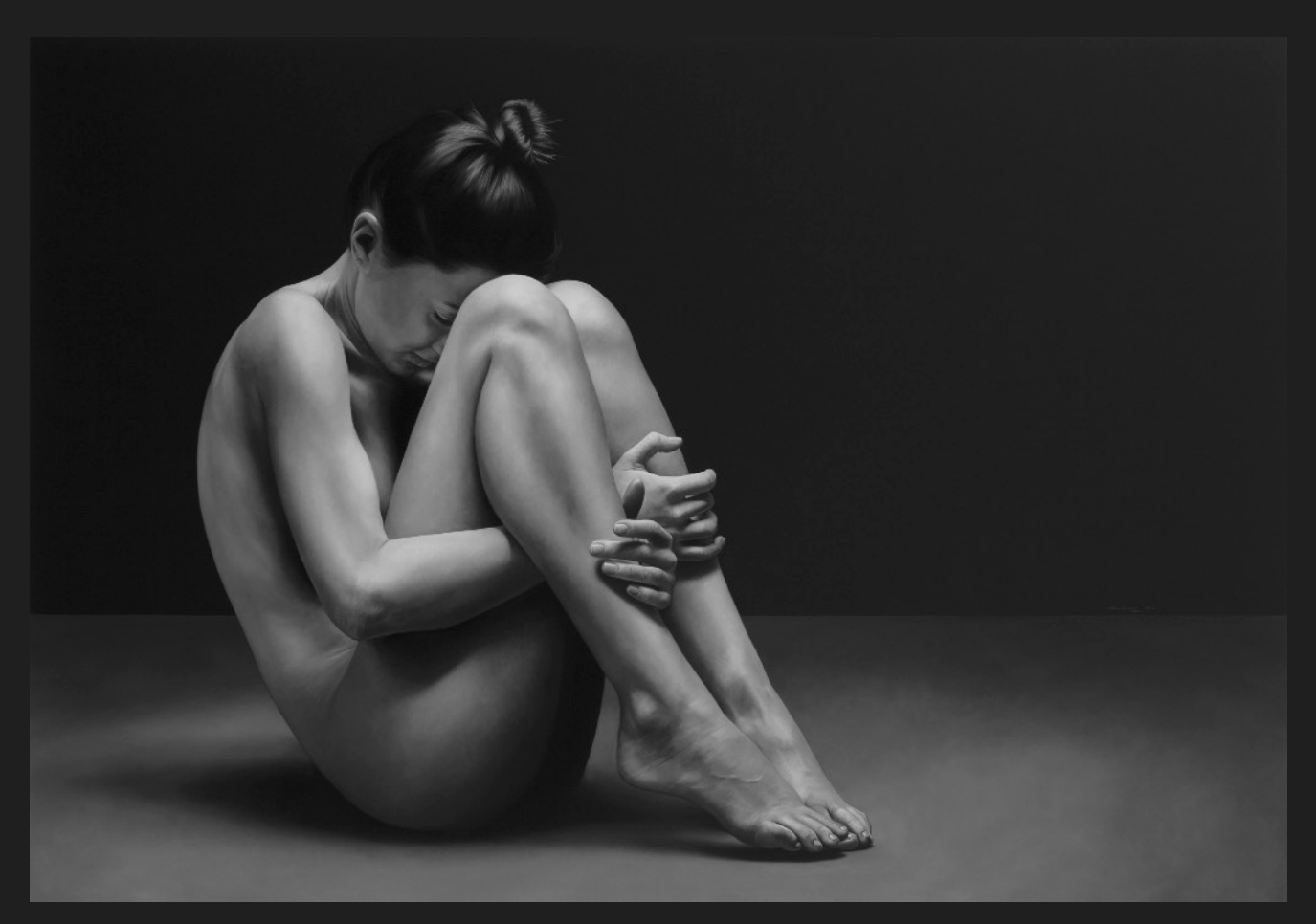
Introspection II, 2021, Oil on canvas, 165 x 240 cm