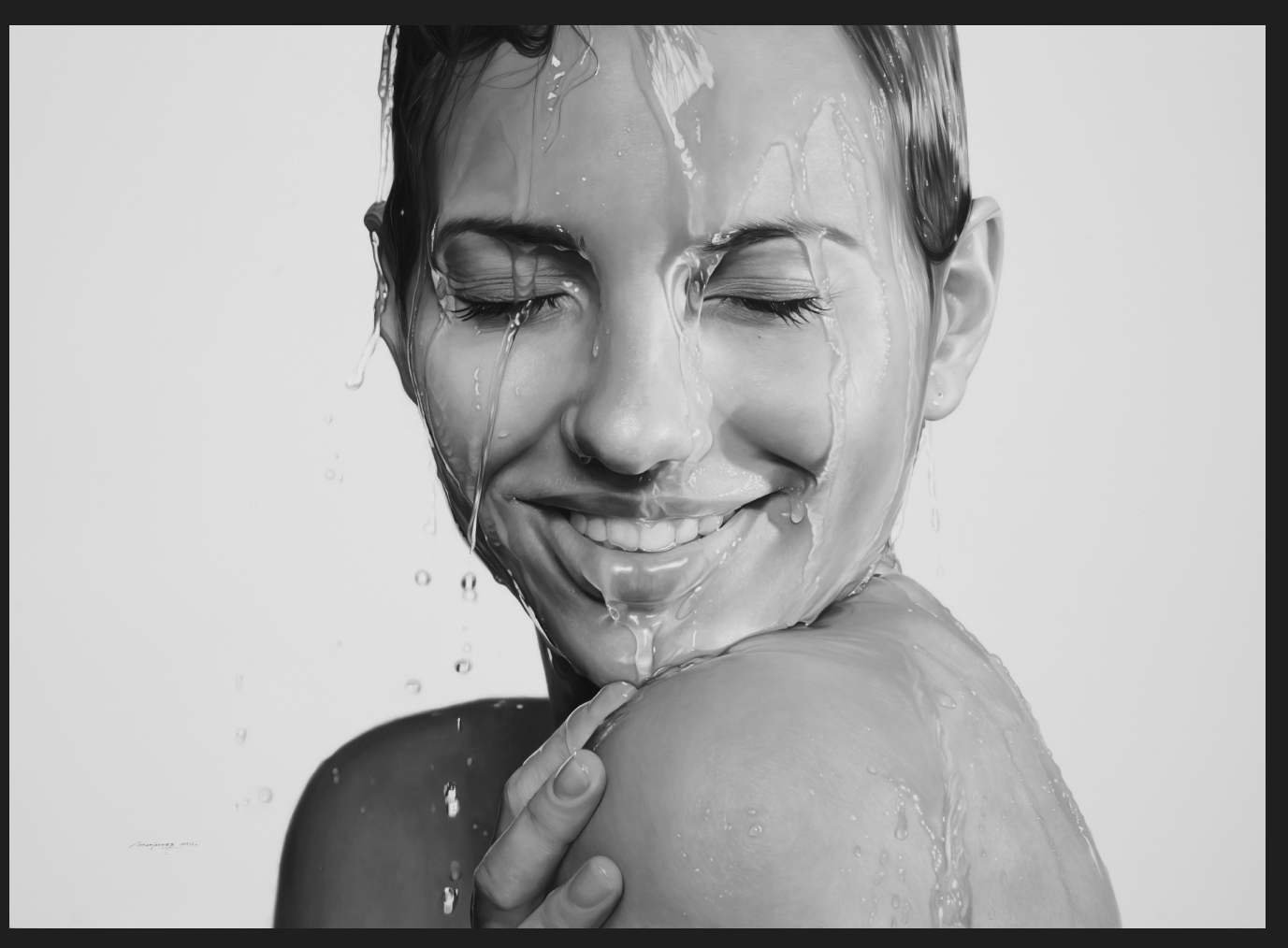
Refreshing I , 2020, Oil on canvas, 130 x 180 cm