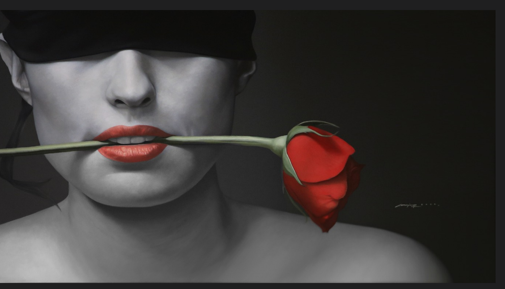
Fragility, 2012, Oil on canvas, 110 x 220 cm