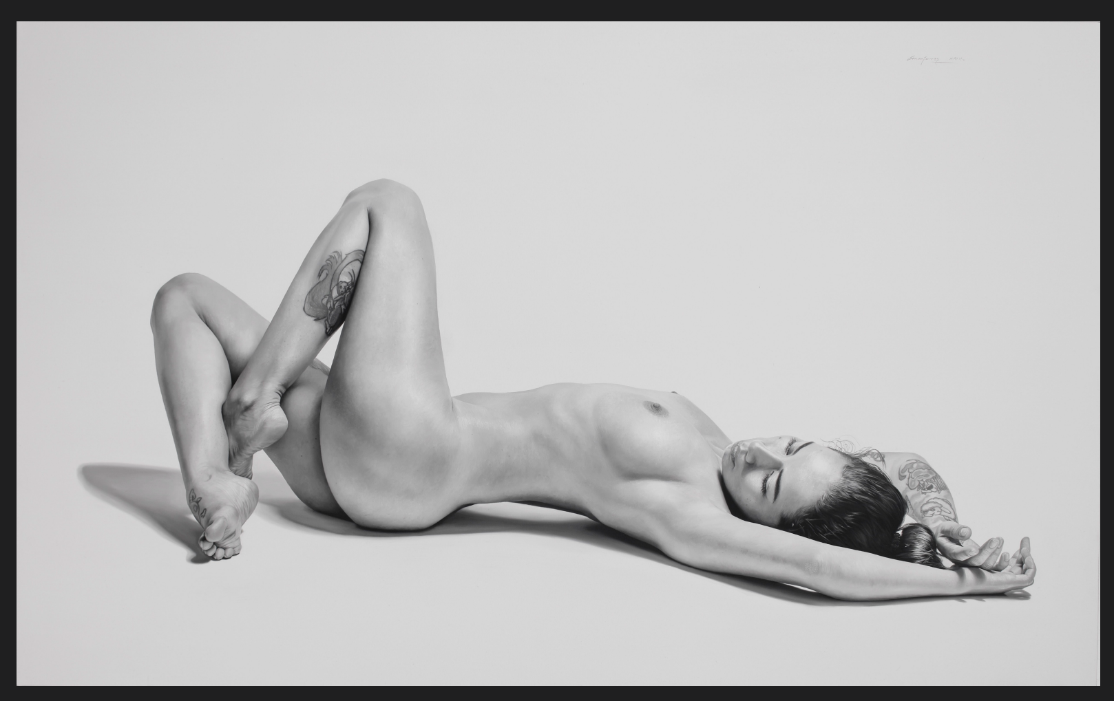
Alahia , 2019, Oil on canvas, 130 x 210 cm