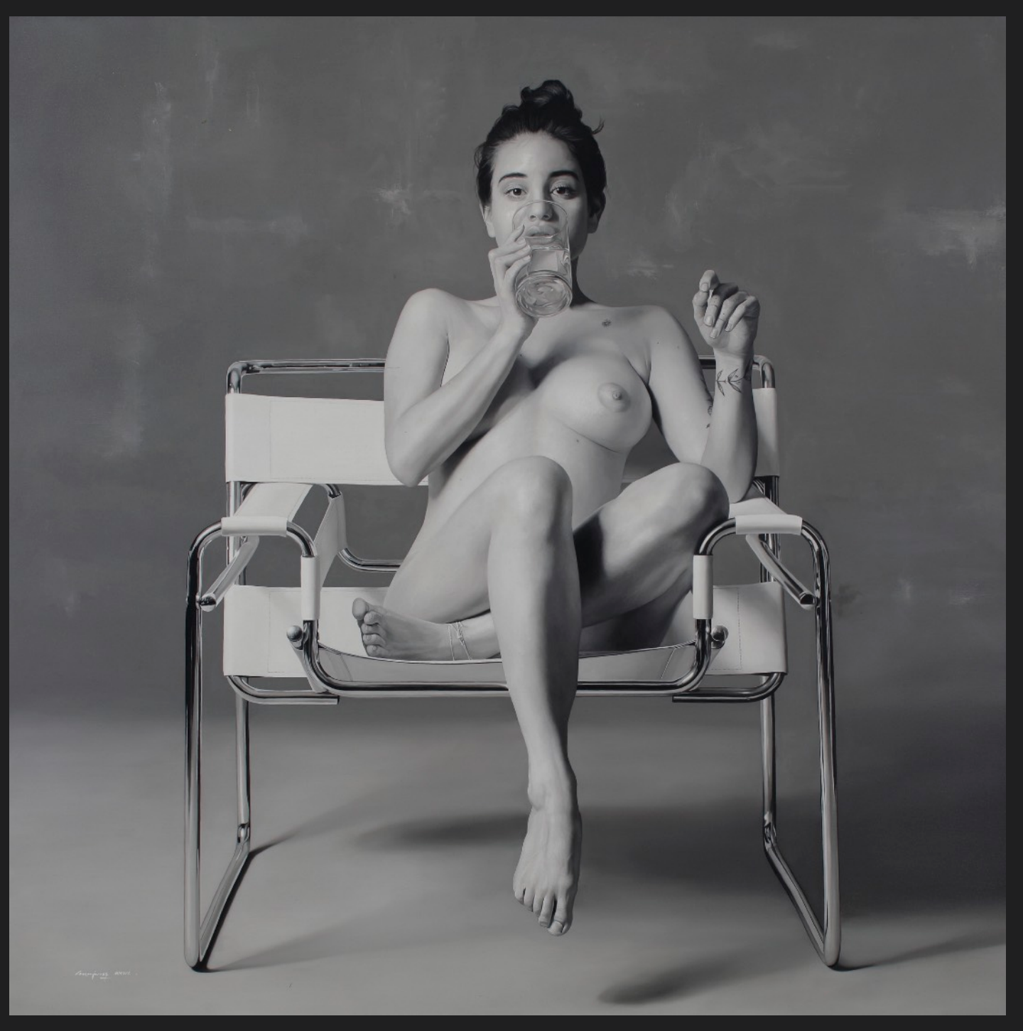
Glass of water, 2019, Oil on canvas, 180 x 180 cm