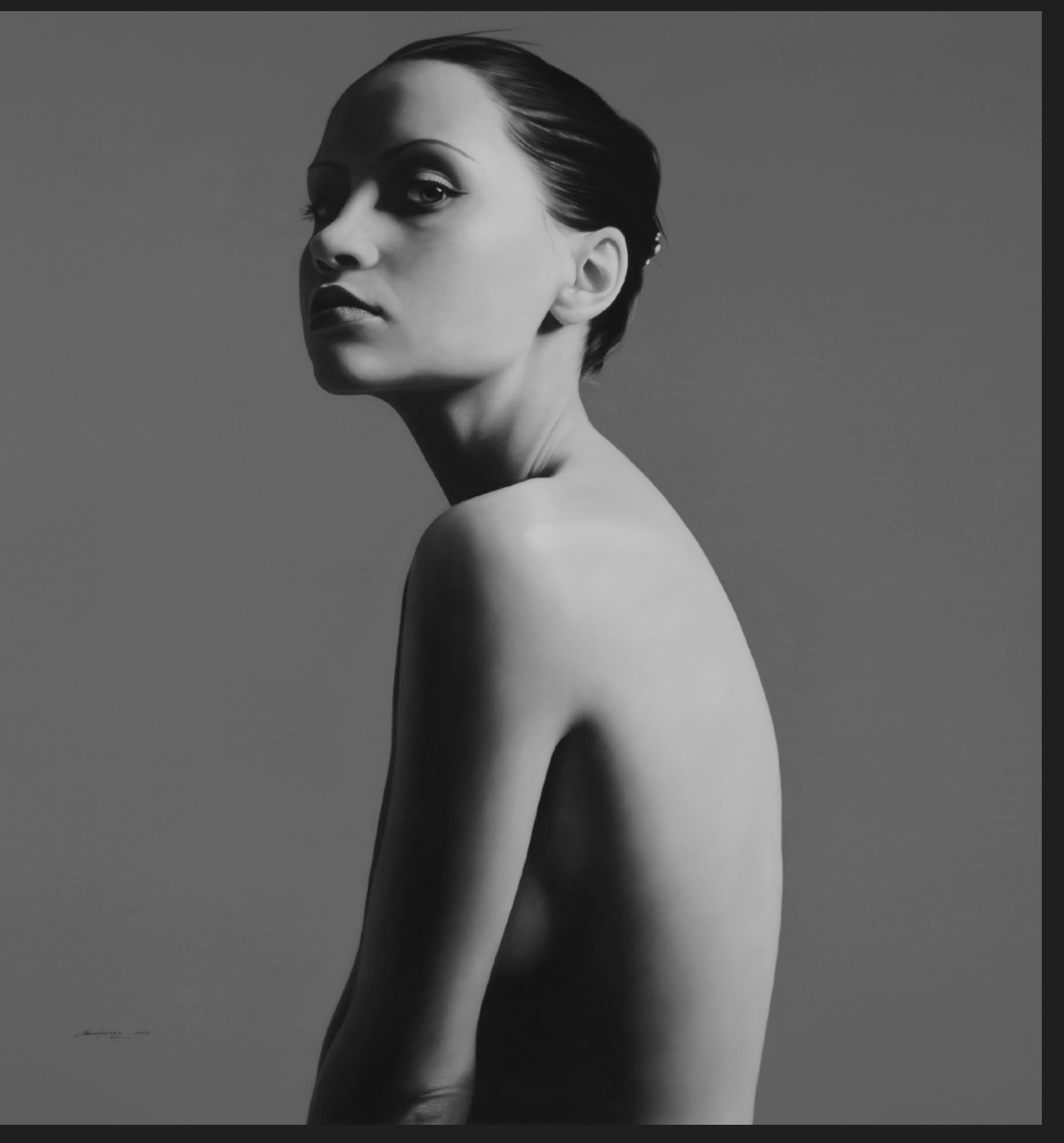
The challenge, 2021, Oil on canvas, 160 x 160 cm