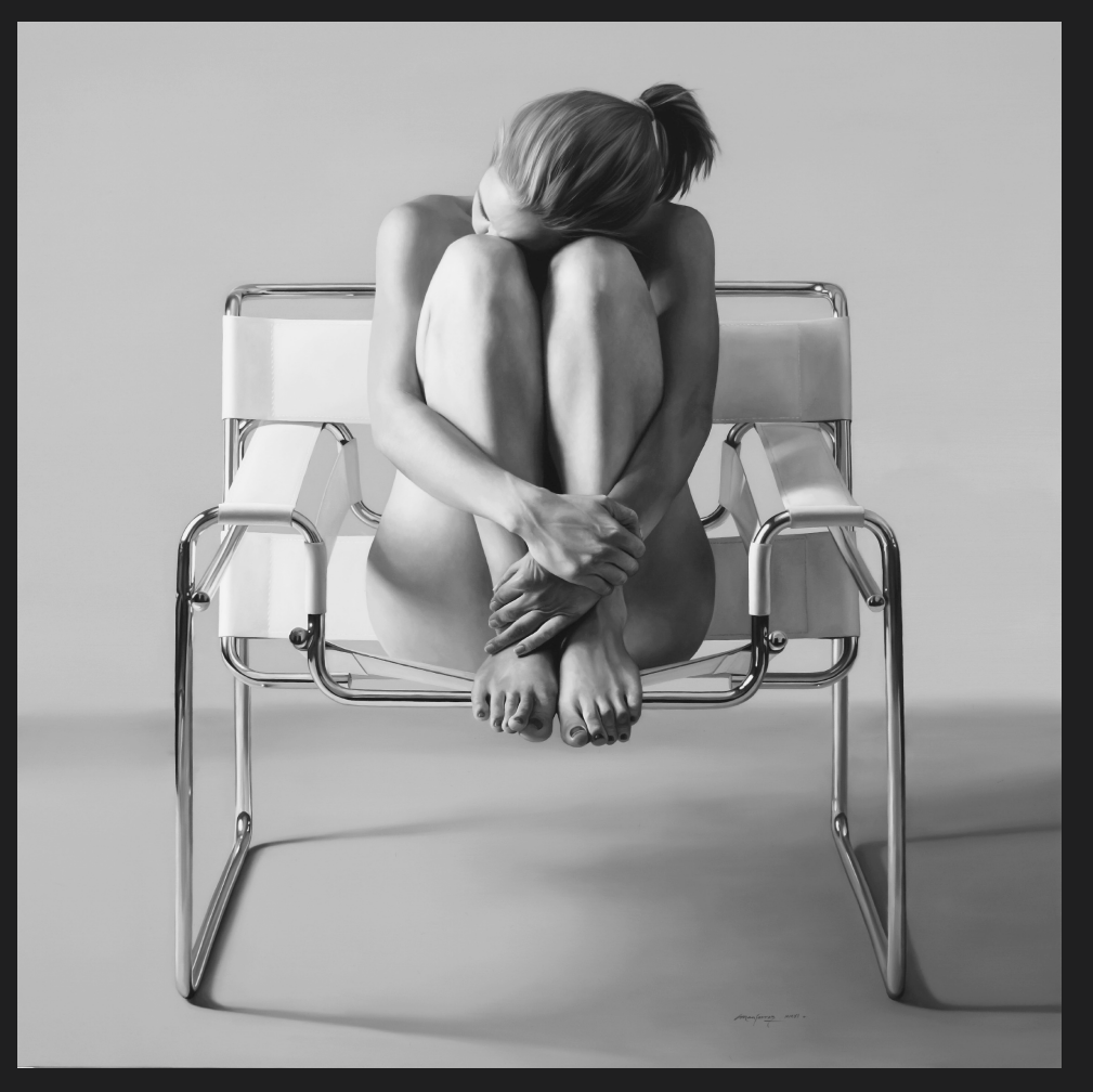
Introspection, 2011, Oil on canvas, 160 x 160 cm