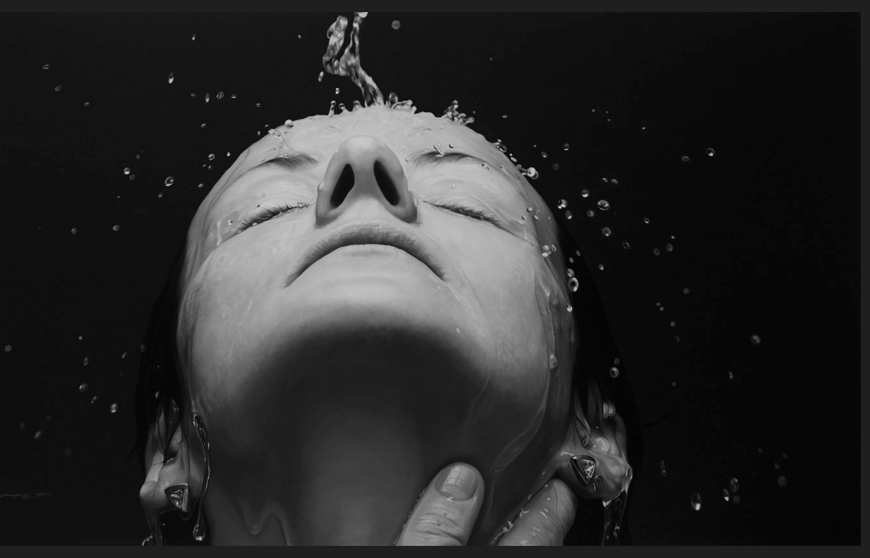
Refreshing , 2013, Oil on canvas, 130 x 230 cm