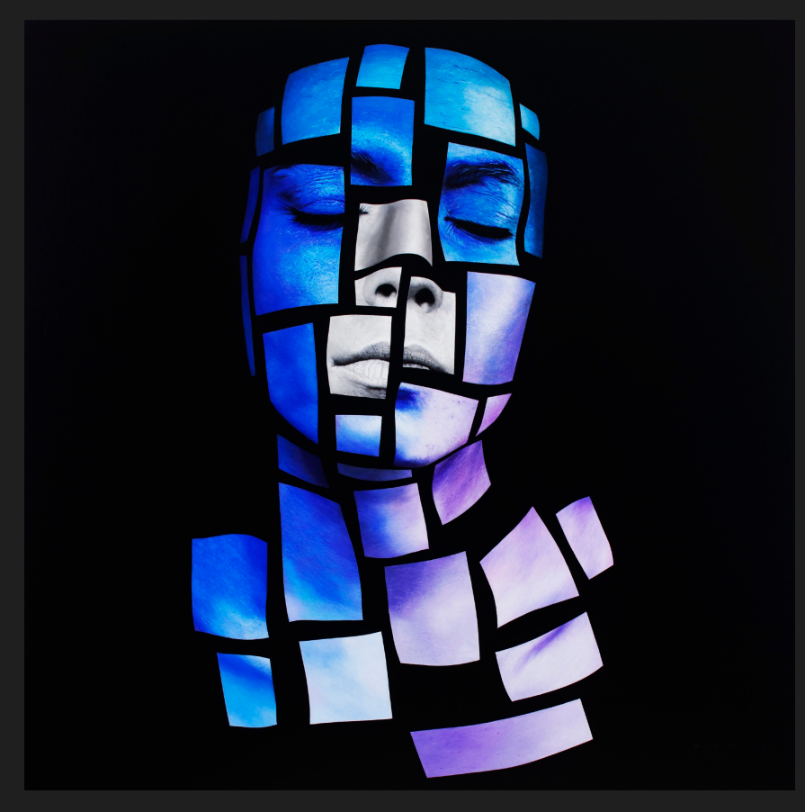
Fragmenta, 2021, Oil on canvas, 200 x 200 cm