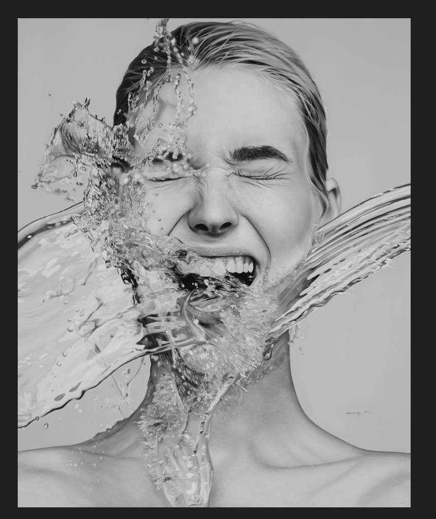
Splash!, 2021, Oil on canvas, 180 x 145 cm