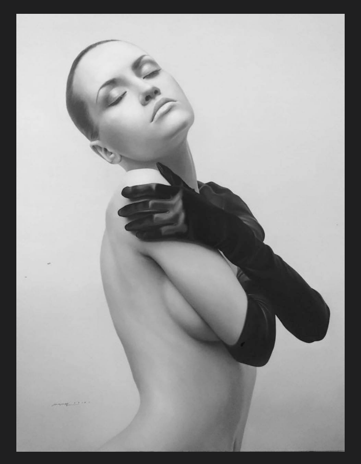
Black silk gloves, 2017, Oil on canvas, 200 x 147 cm