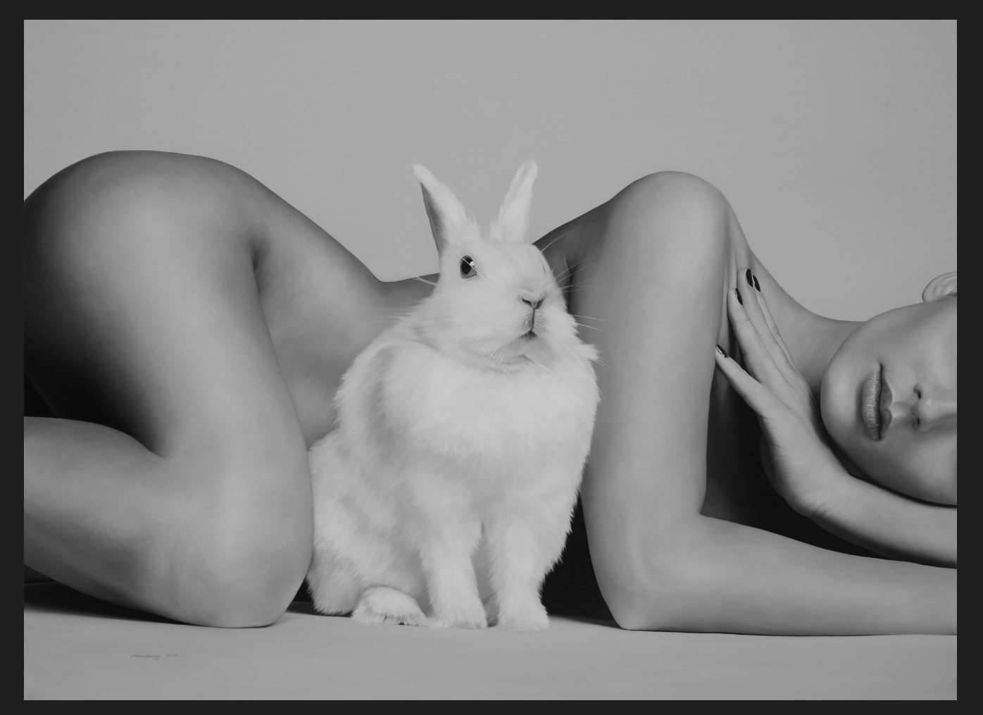
Lady rabbit I, 2020, Oil on canvas, 140 x 190 cm