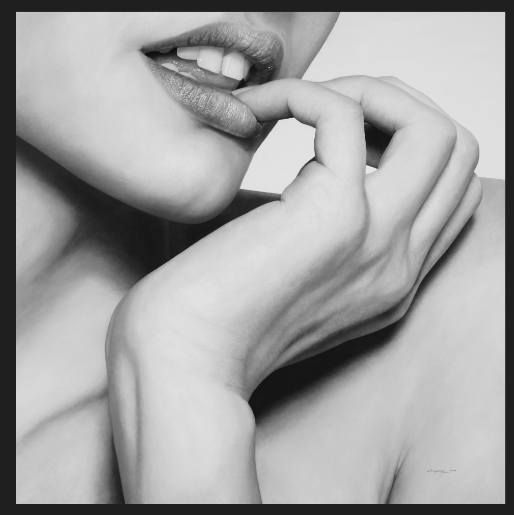
The little touch of seduction, 2020, Oil on canvas, 160 x 160 cm