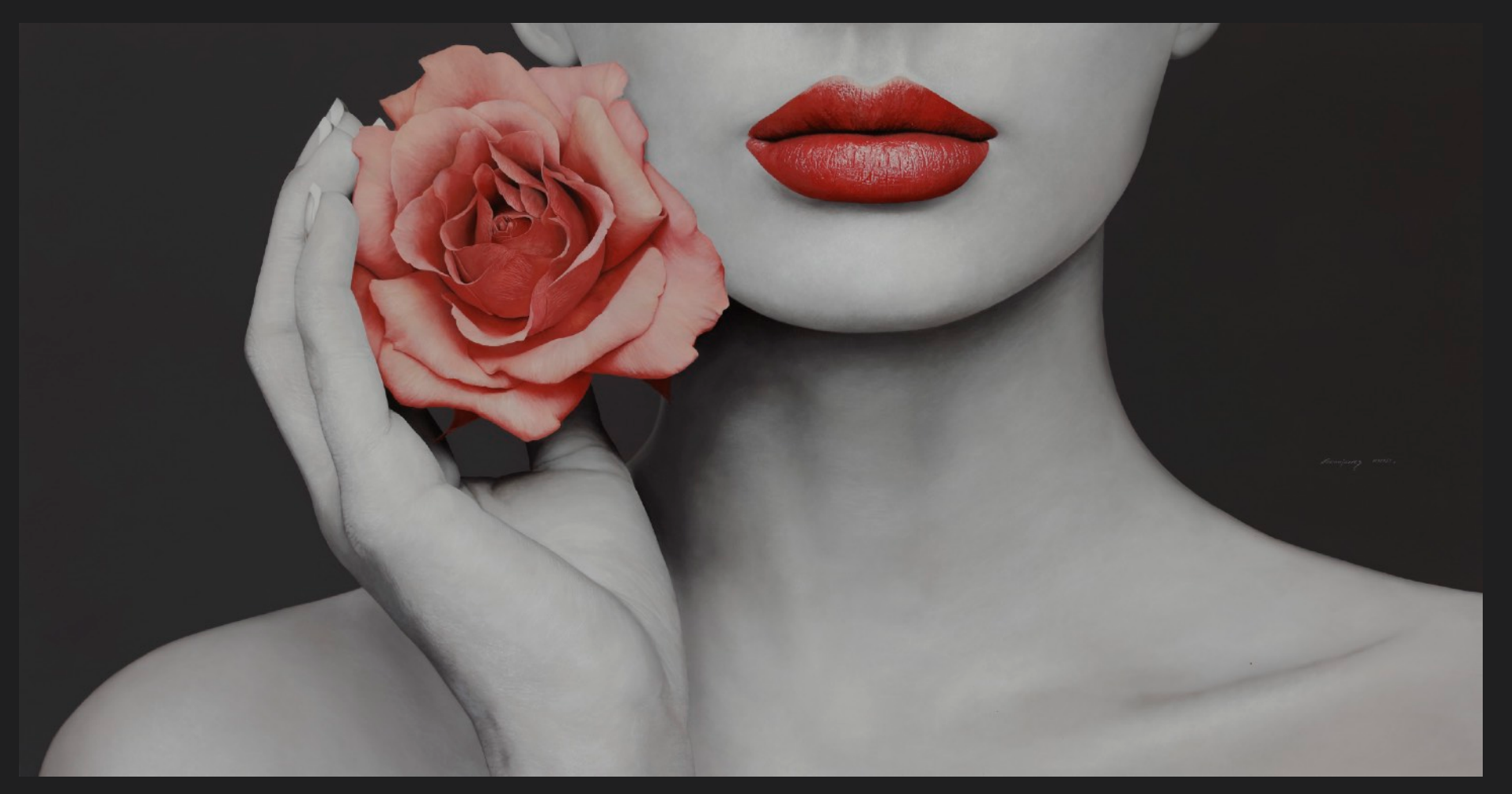
Fragility III, 2021, Oil on canvas, 130 x 250 cm