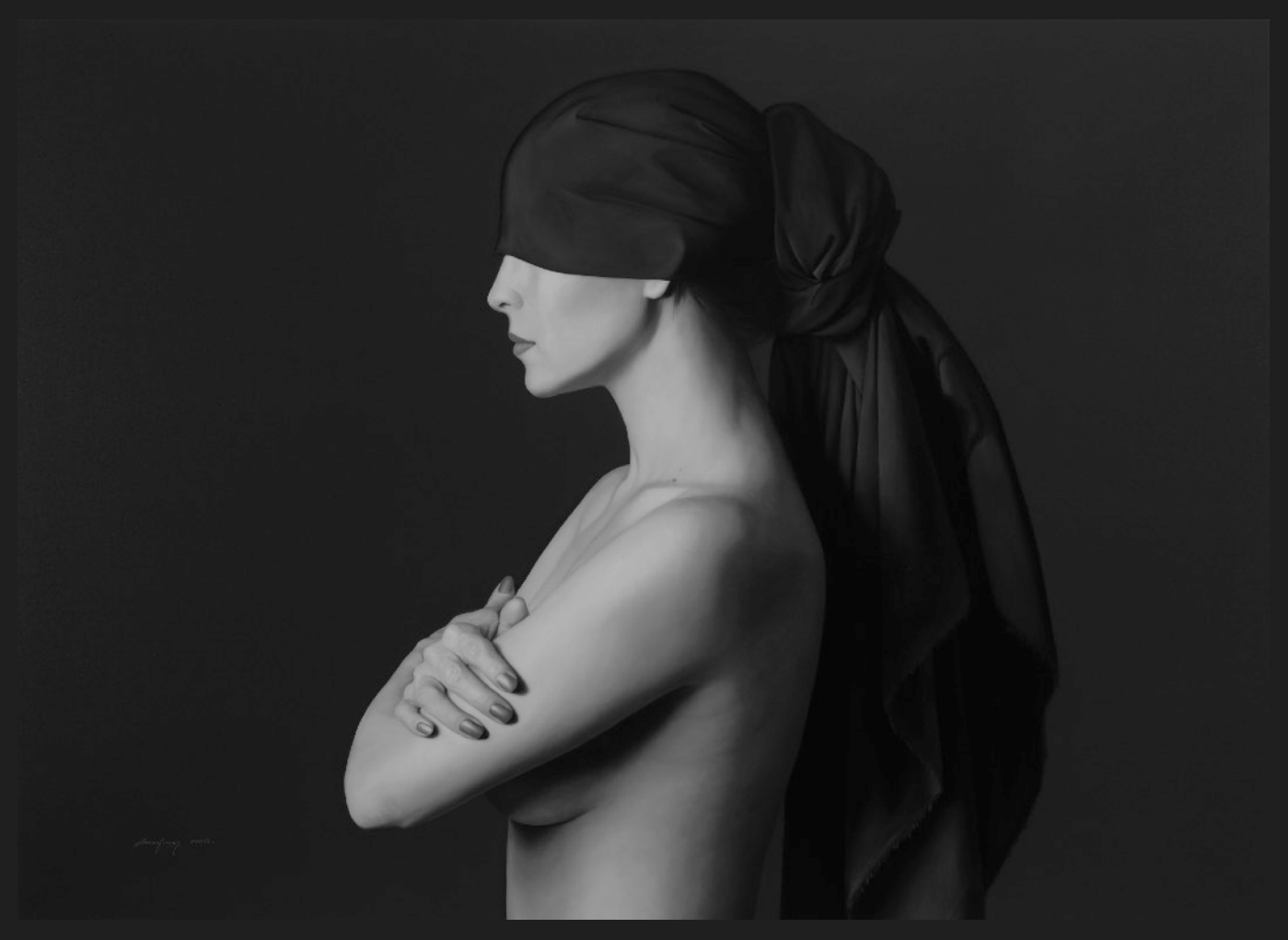
The unconditional wait, 2020, Oil on canvas, 130 x 180 cm