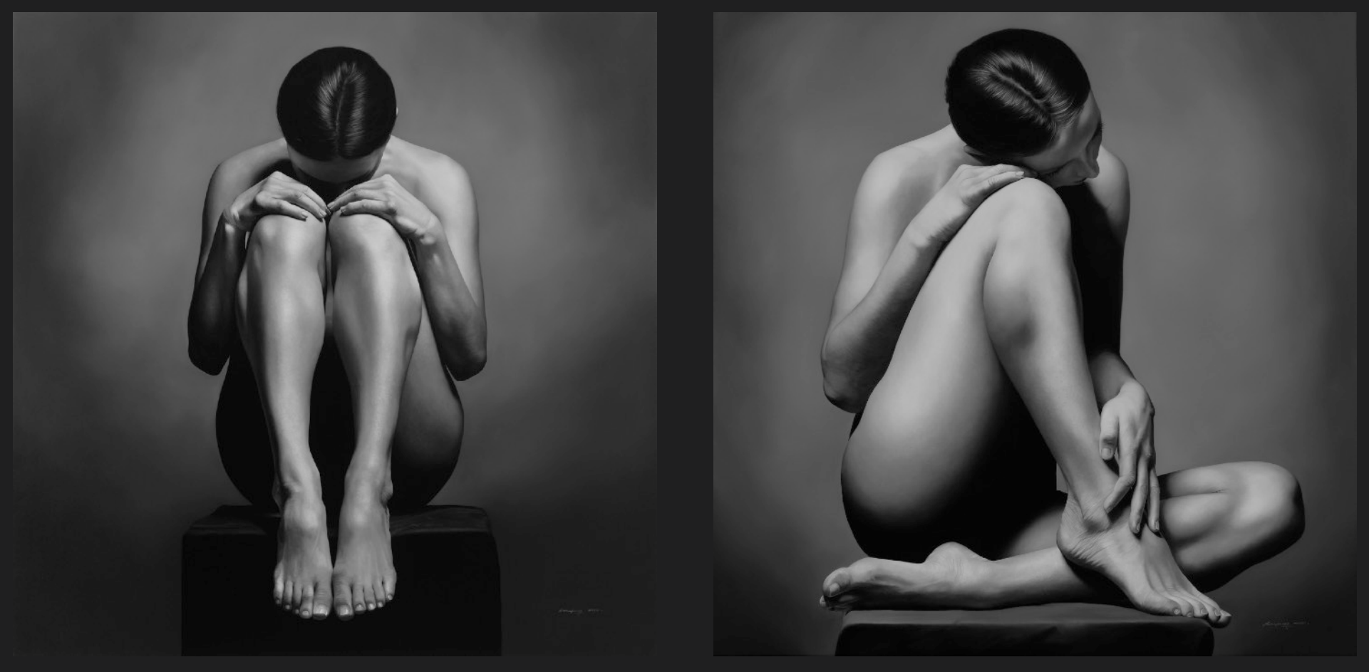
Introspection, 2019, Oil on canvas, 180 x 180 cm