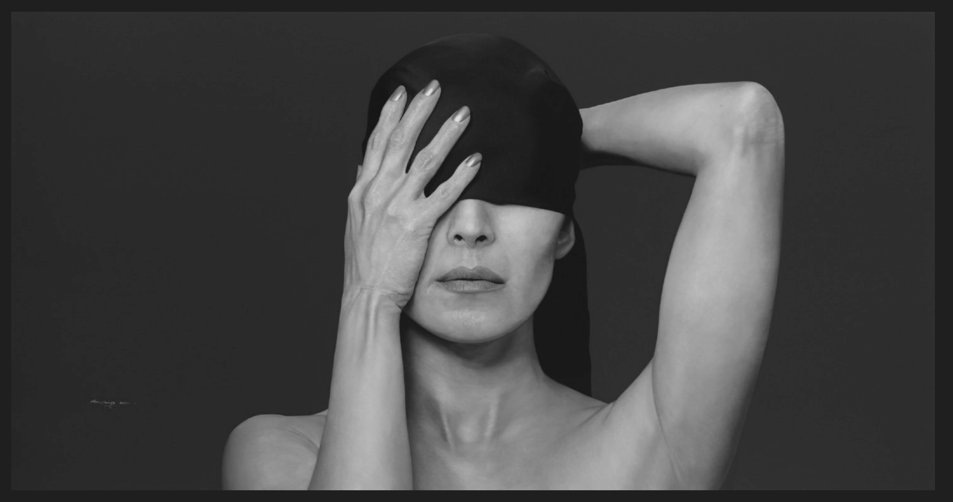
Essay on blindness, 2021, Oil on canvas, 130 x 250 cm