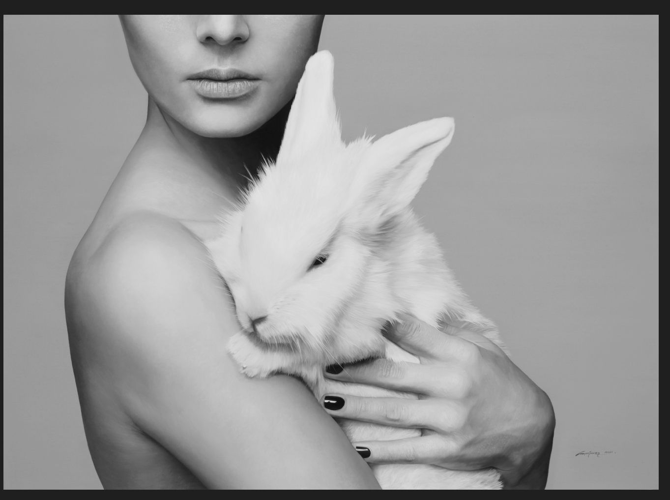
Lady rabbit, 2015, Oil on canvas, 130 x 180 cm