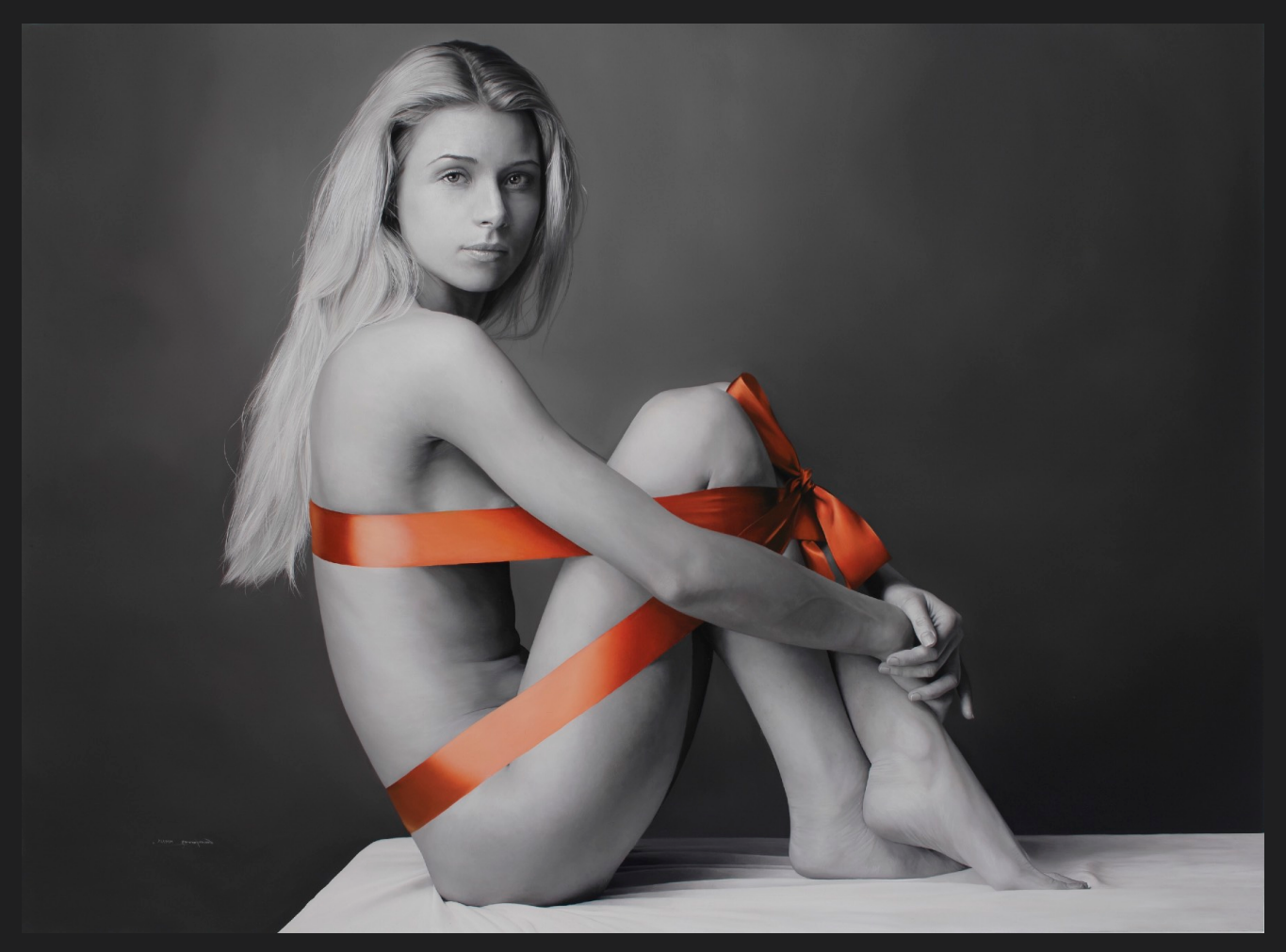
The gift , 2019, Oil on canvas, 147 x 200 cm