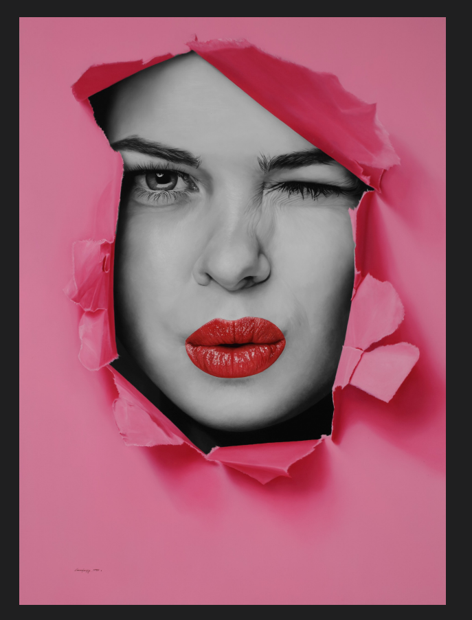
The kiss in pink package, 2021, Oil on canvas, 180 x 130 cm