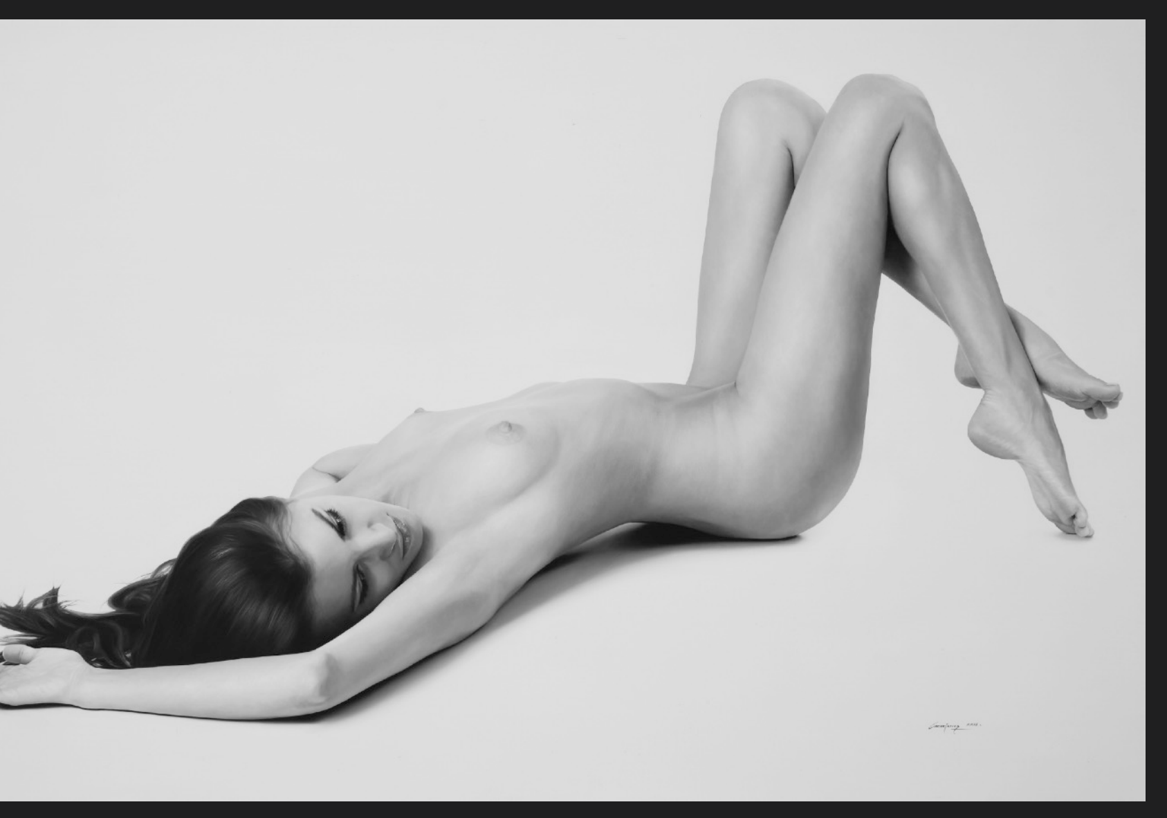
The awakening, 2020, Oil on canvas, 130 x 200 cm