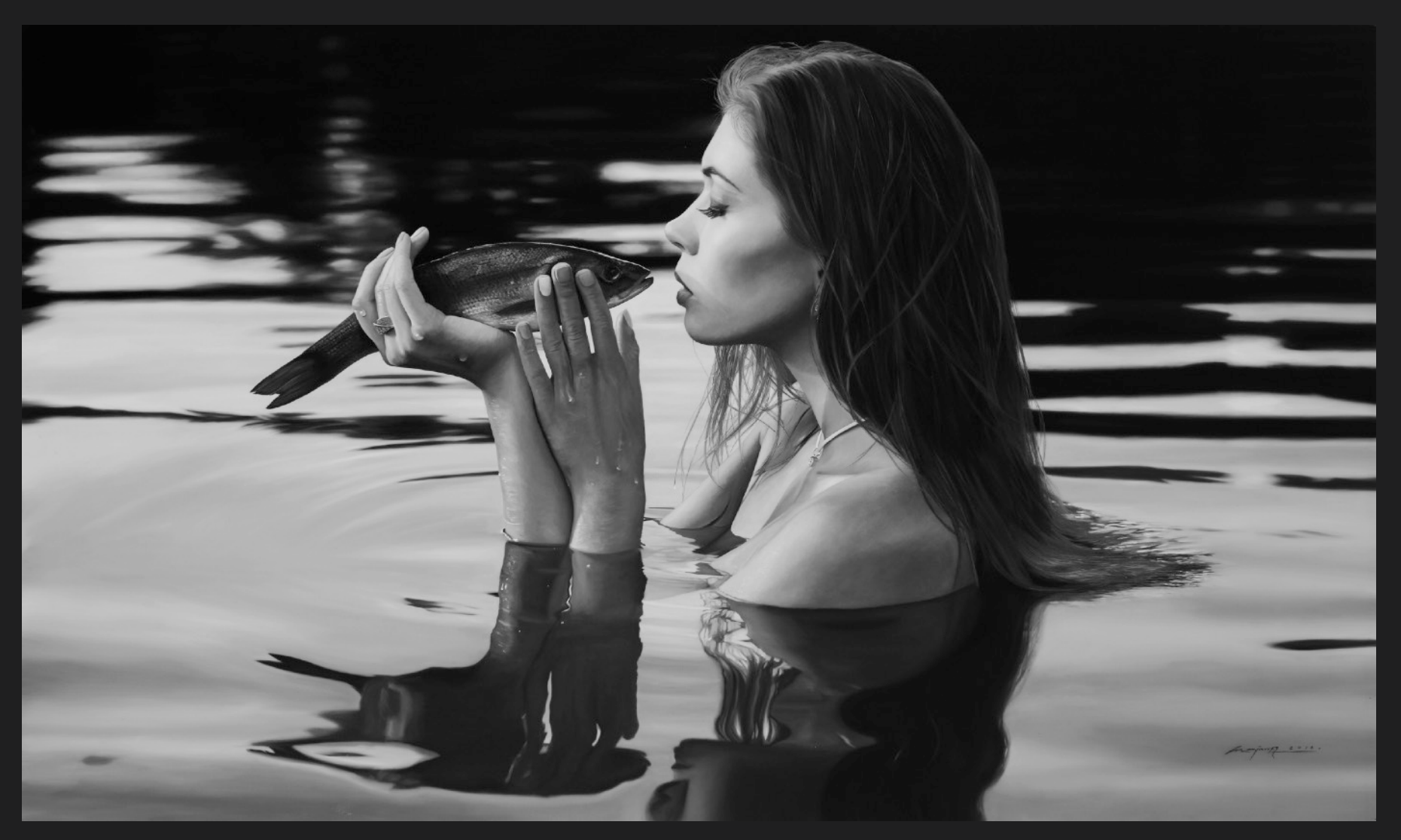
Inciting a kiss, 2018, Oil on canvas, 130 x 220 cm