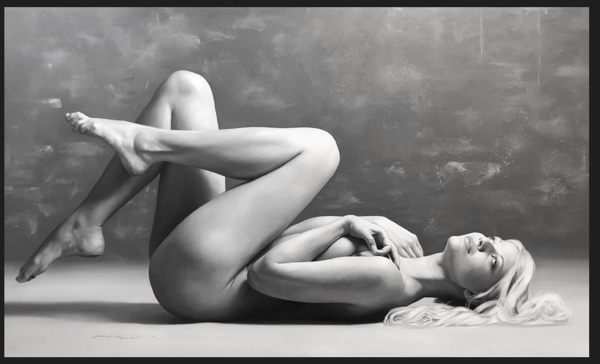
Dreaming , 2019, Oil on canvas, 120 x 200 cm