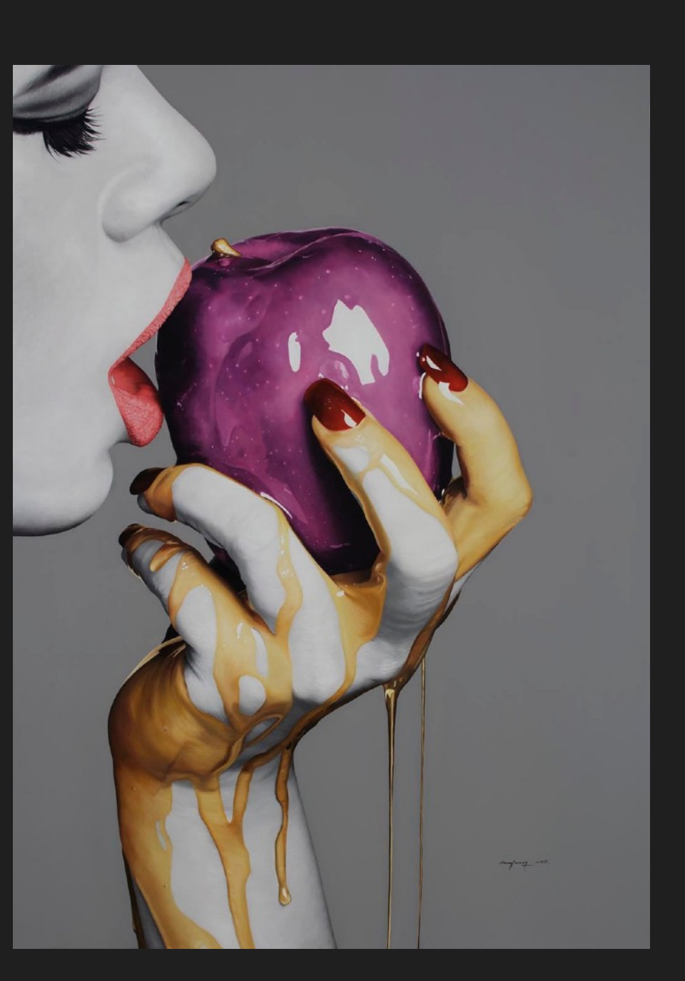
Eva's cynicism , 2020, Oil on canvas, Polyptych, 180 x 130 cm