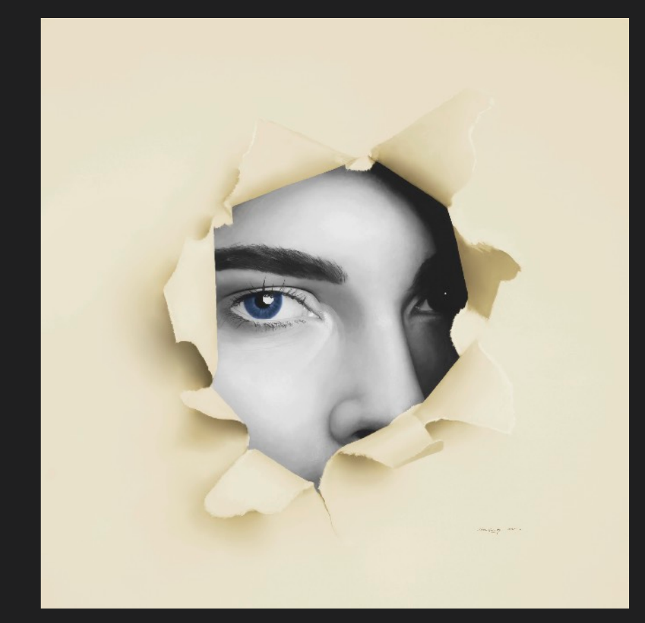
The beige package, 2021, Oil on canvas, Diptych, 150 x 150 cm