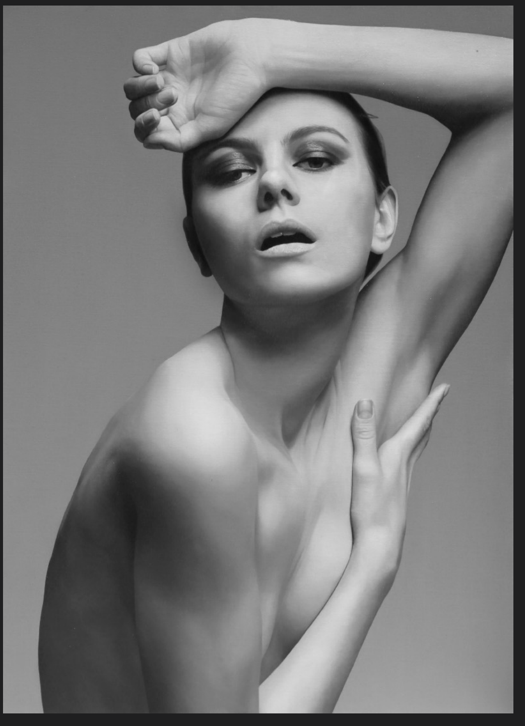
Intimate revelation, 2018, Oil on canvas, 180 x 130 cm