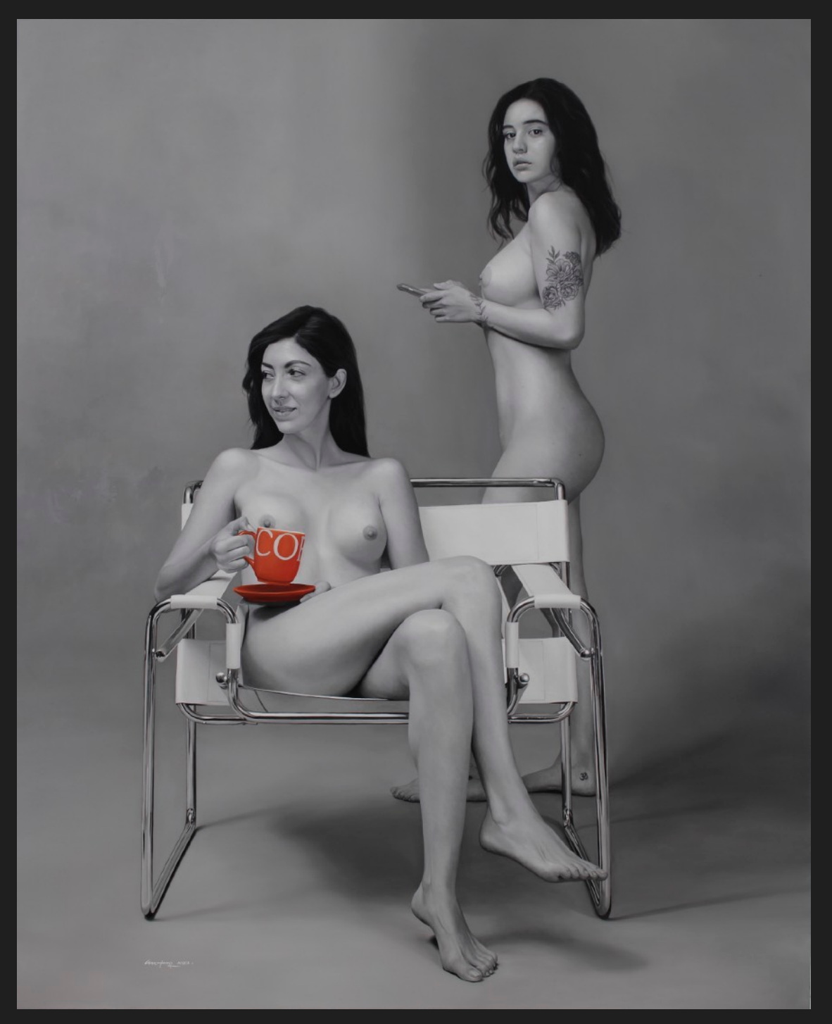
Coffee time , 2019, Oil on canvas, 240 x 185 cm