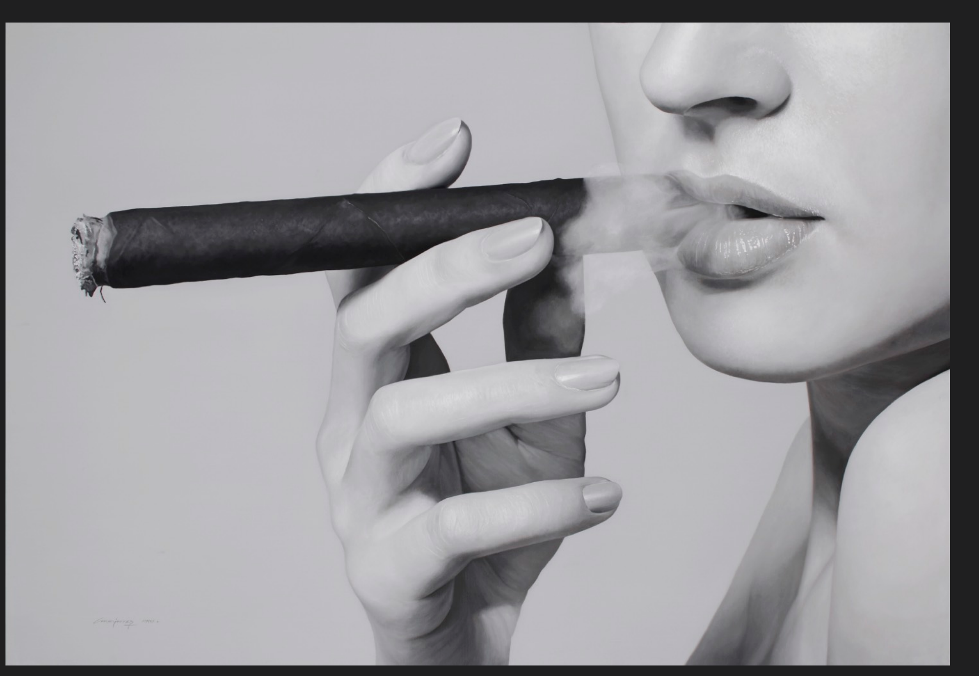
The Cigar , 2020, Oil on canvas, 130 x 200 cm