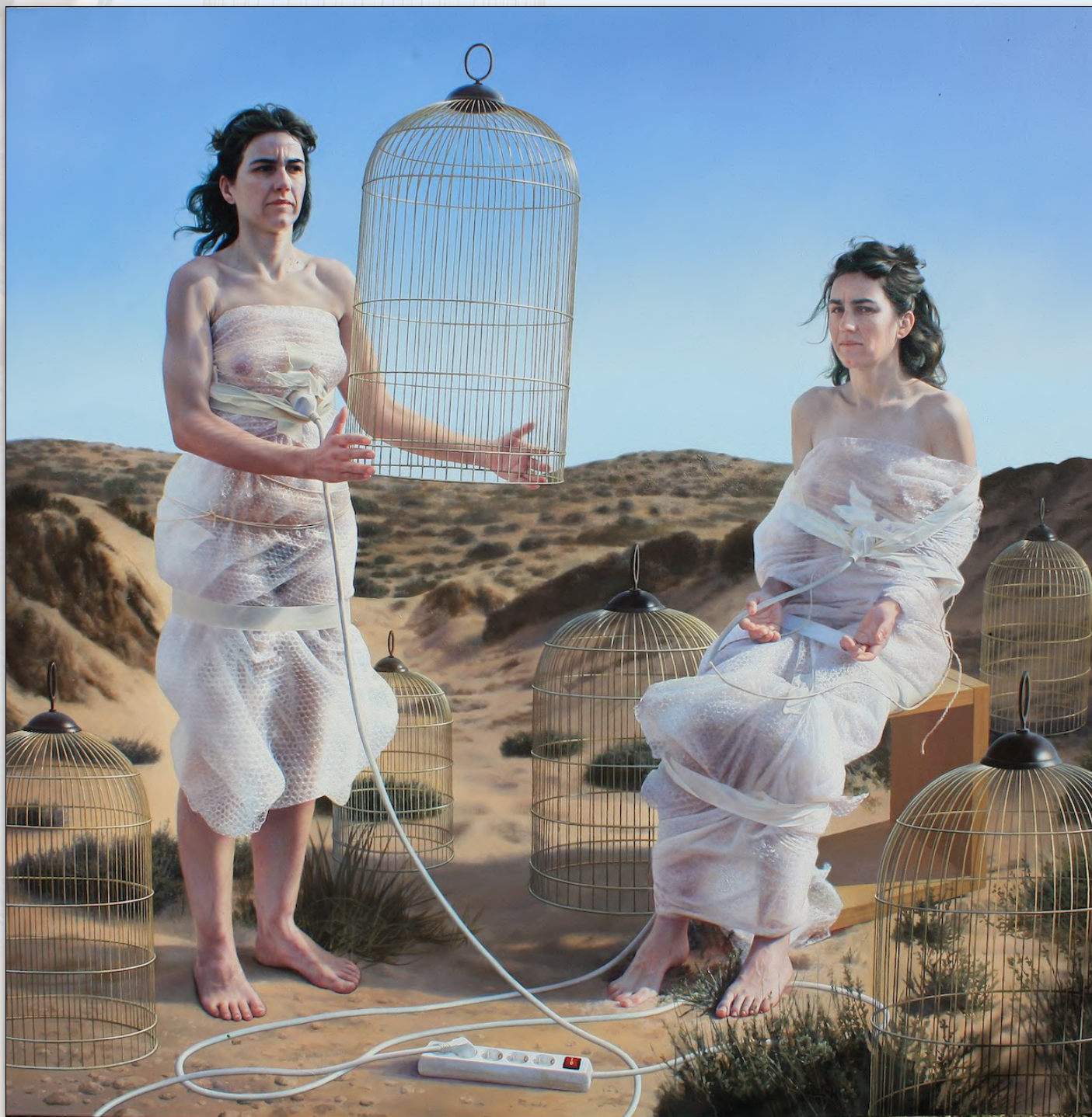
Alternating Current , 2010, Oil on Canvas, 200 x 200 cm © Edgar Mendoza