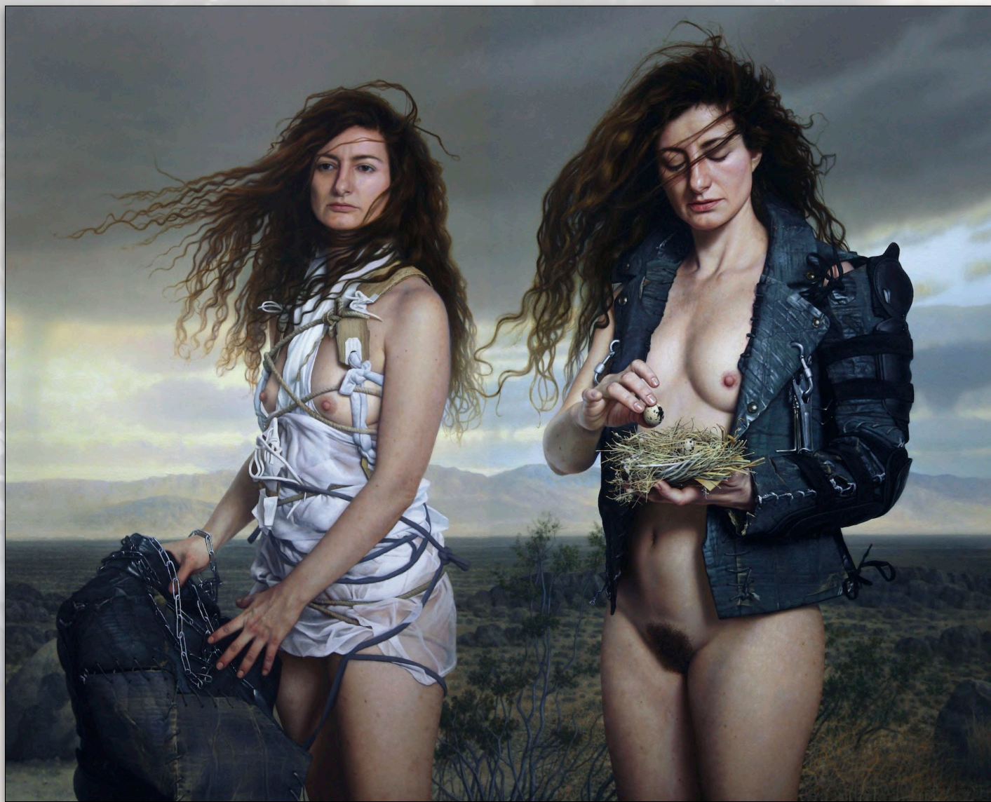
Nest , 2015, Oil on Canvas, 82 x 105 cm © Edgar Mendoza