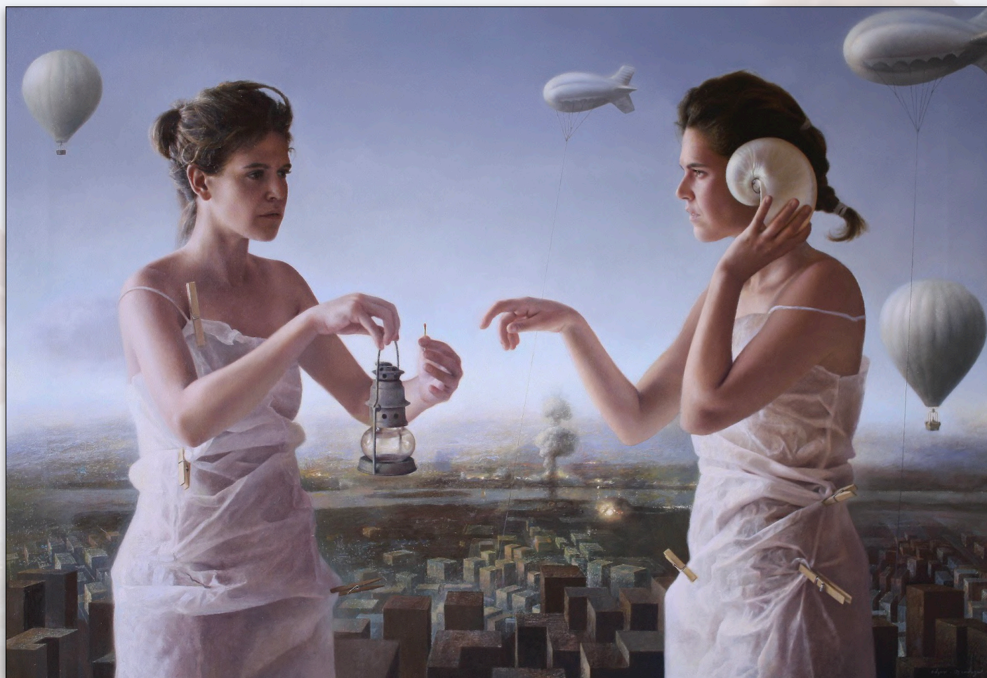
Two Pilares II , 2009, Oil on Canvas, 50 x 73 cm © Edgar Mendoza