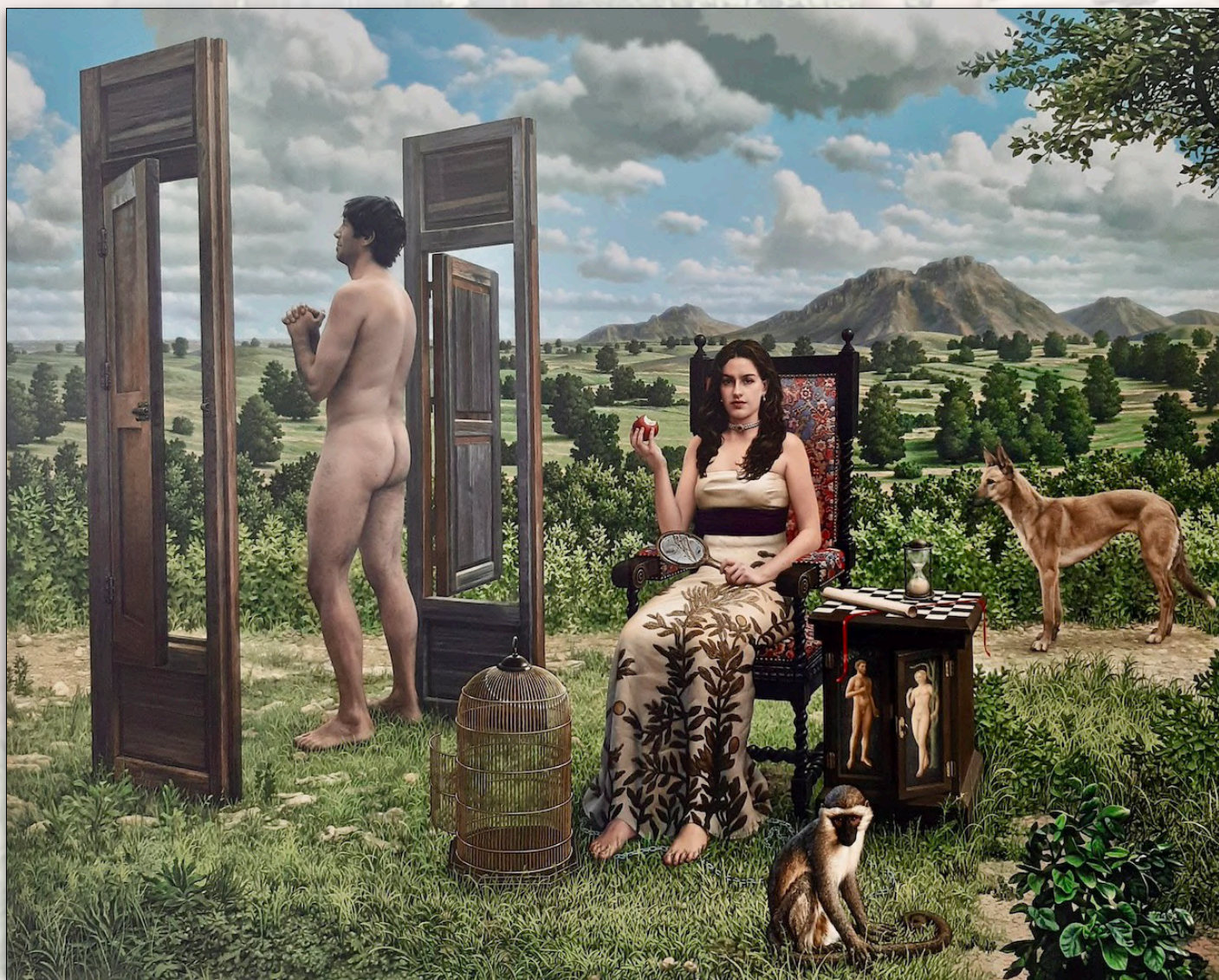
Adam and Eve , 2021, Oil on Linen, 130 x 195 cm © Edgar Mendoza