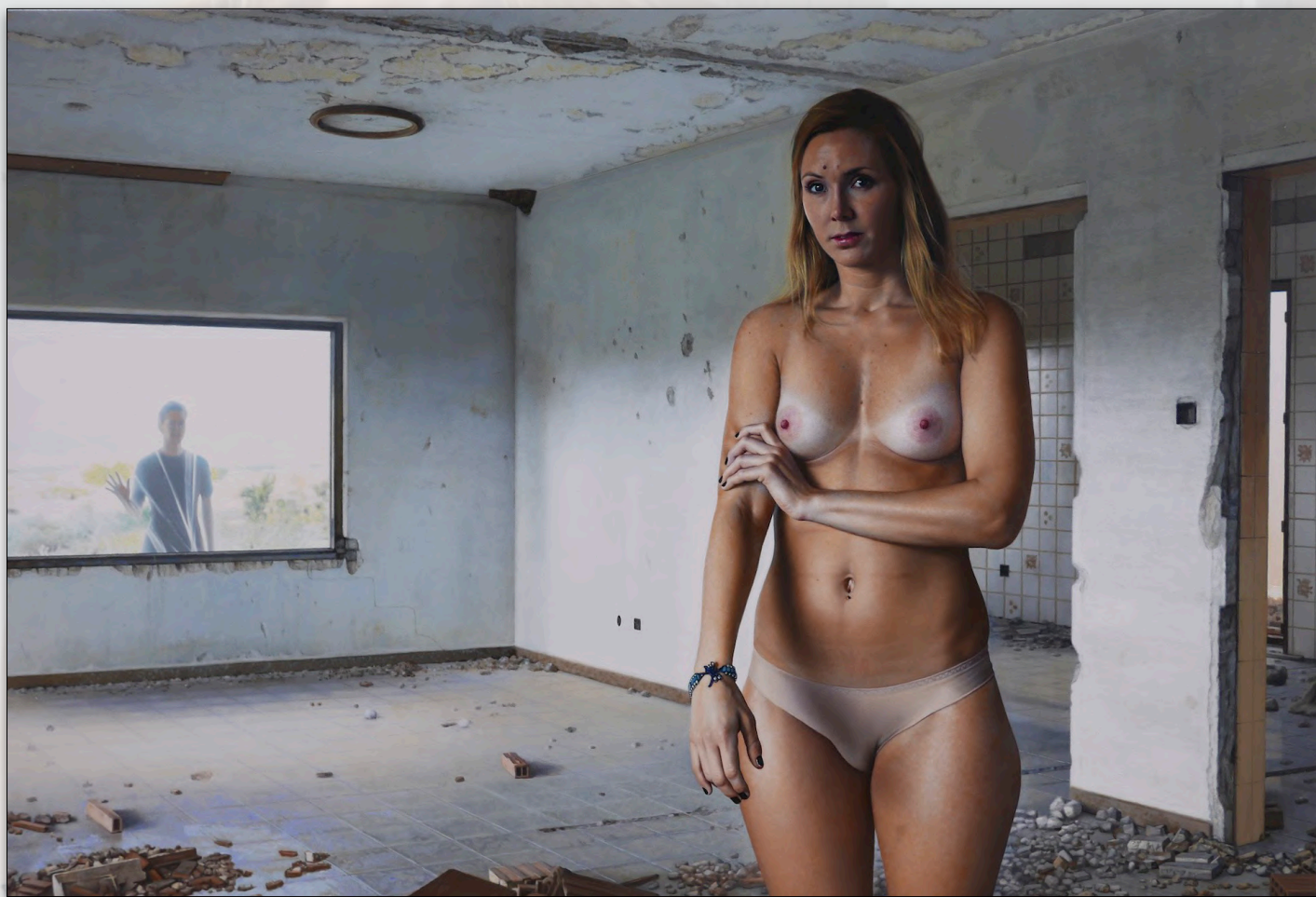
Visitor , 2020, Oil on Canvas, 89 x 130 cm © Edgar Mendoza