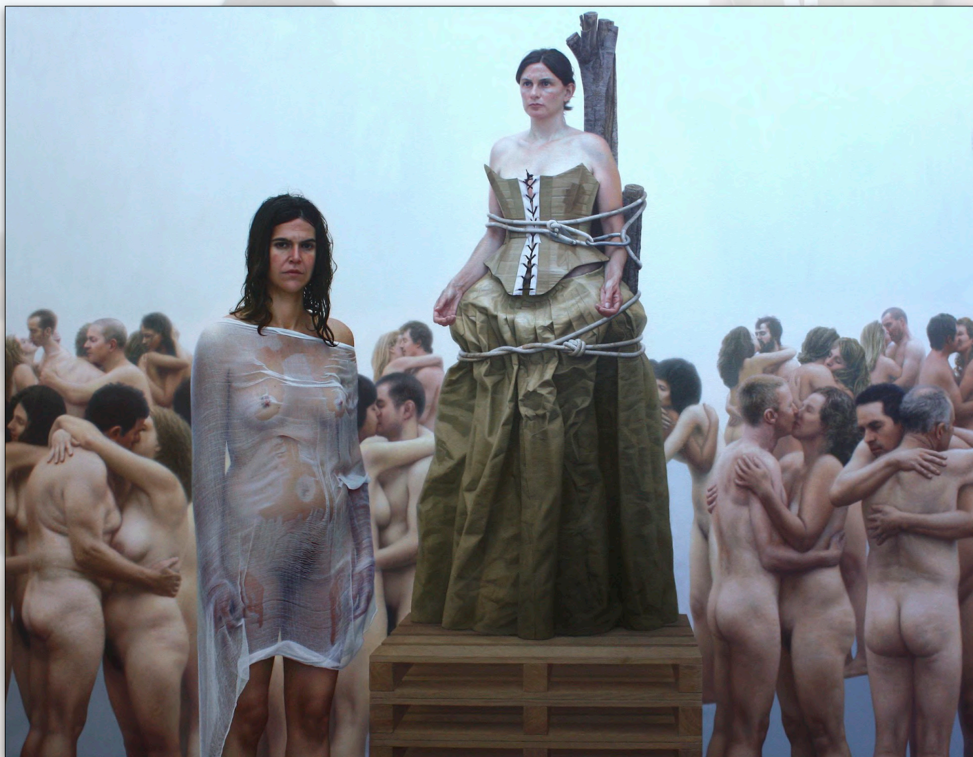
Symphony No. 1 , 2014, Oil on Canvas, 162 x 220 cm © Edgar Mendoza