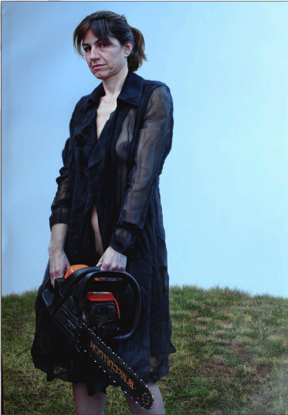
Mutant , 2013, Oil on Canvas, 162 x 114 cm © Edgar Mendoza