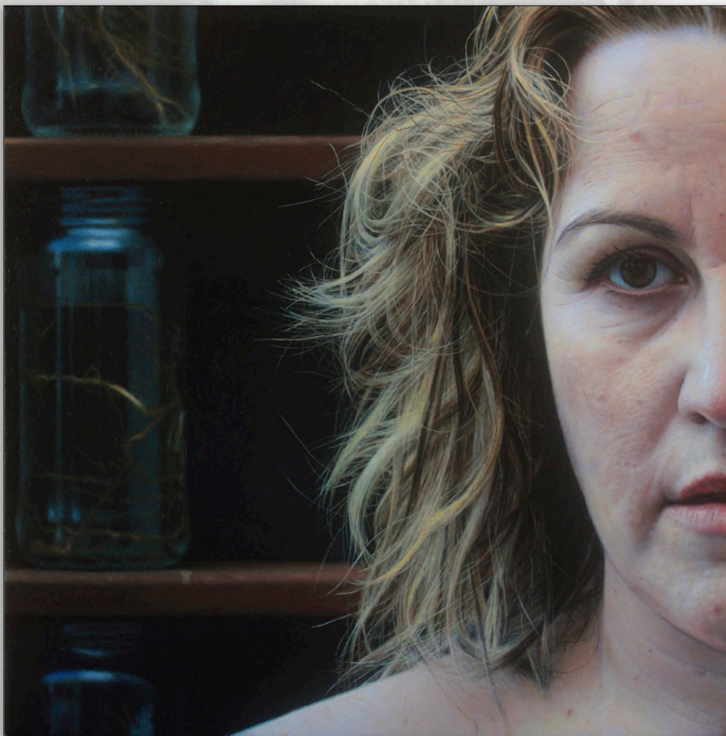
Silence , 2018, Oil on Canvas, 20 x 20 cm © Edgar Mendoza