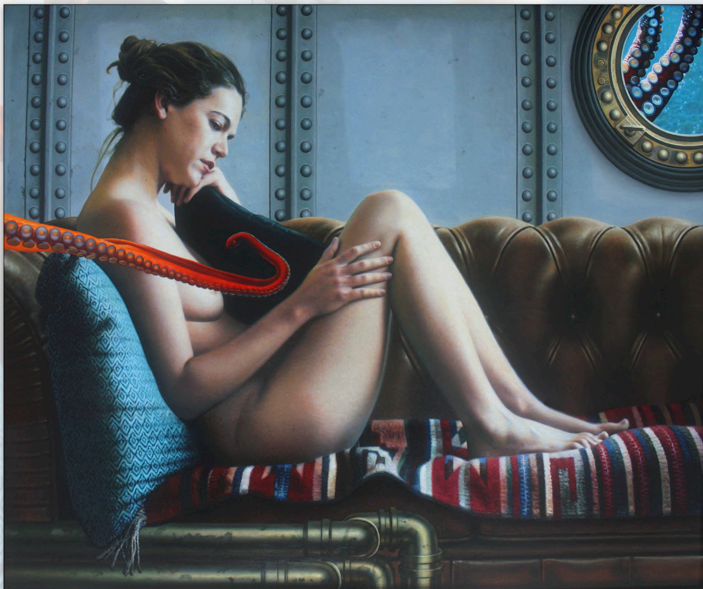
Submarine , 2018, Oil on Canvas, 71 x 61 cm © Edgar Mendoza