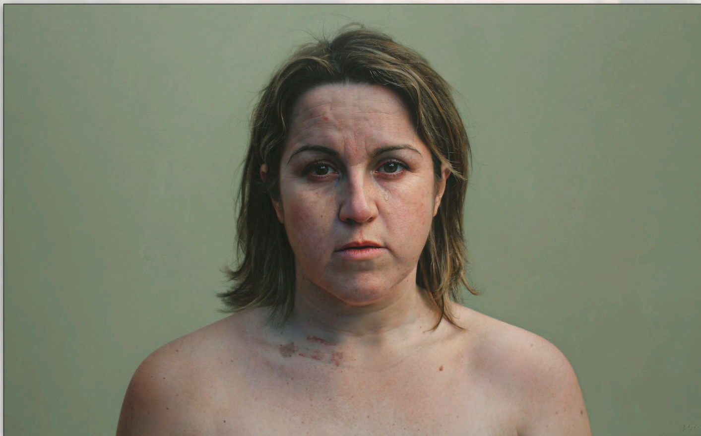
Phenotype II , 2013, Oil on Wood, 86 x 140 cm © Edgar Mendoza