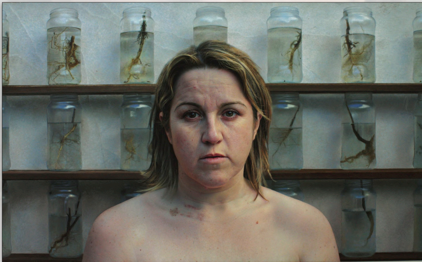
Phenotype I , 2013, Oil on Wood, 86 x 140 cm © Edgar Mendoza