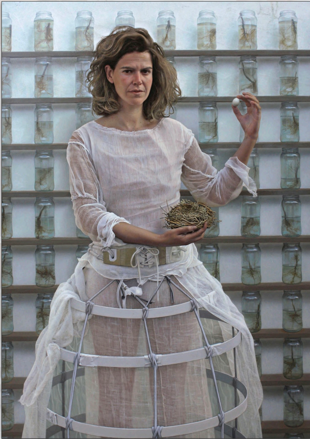
Bulbs , 2016, Oil on Canvas, 114 x 81 cm © Edgar Mendoza