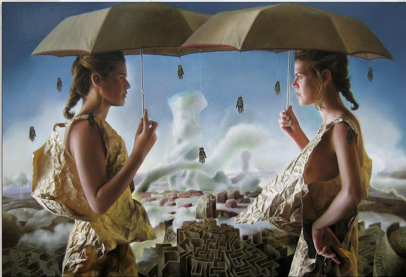
Two Pilares , 2006, Oil on Canvas, 50 x 73 cm © Edgar Mendoza