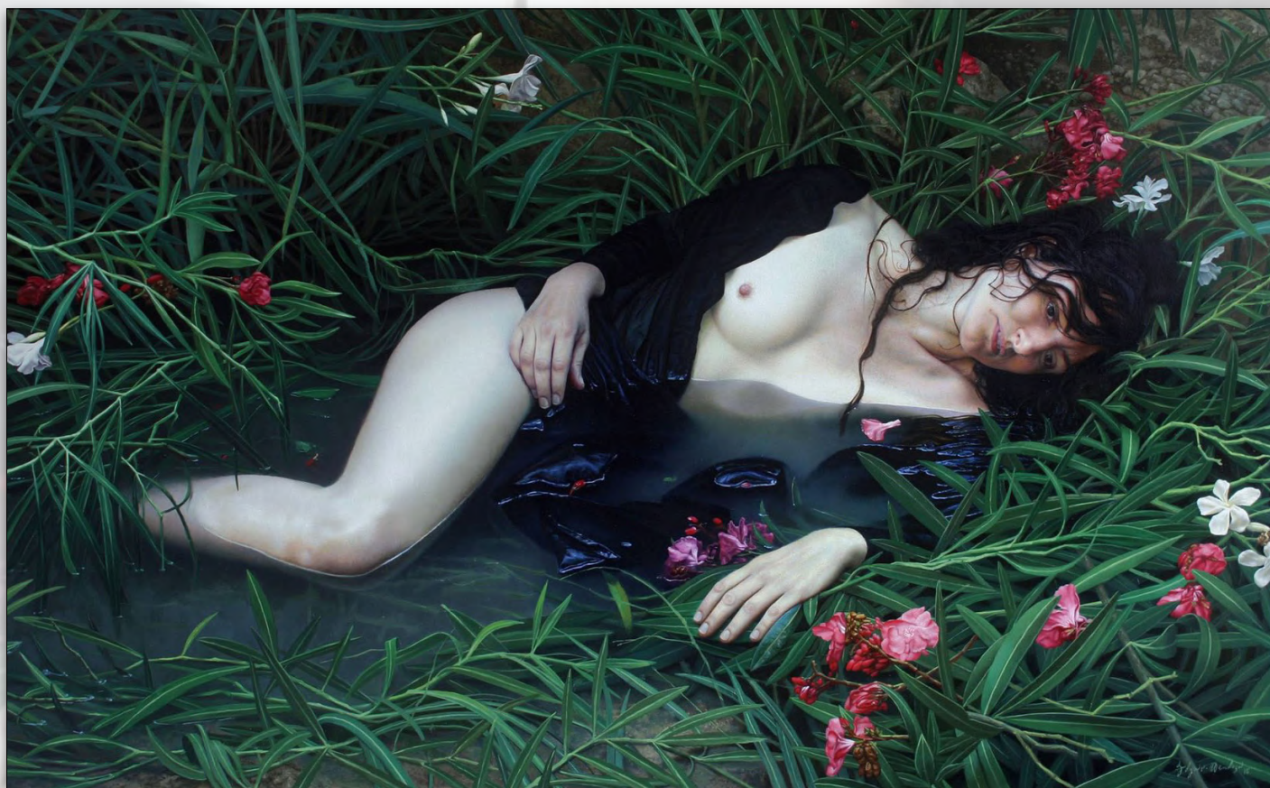
Ophelia , 2015, Oil on Canvas, 56 x 90 cm © Edgar Mendoza