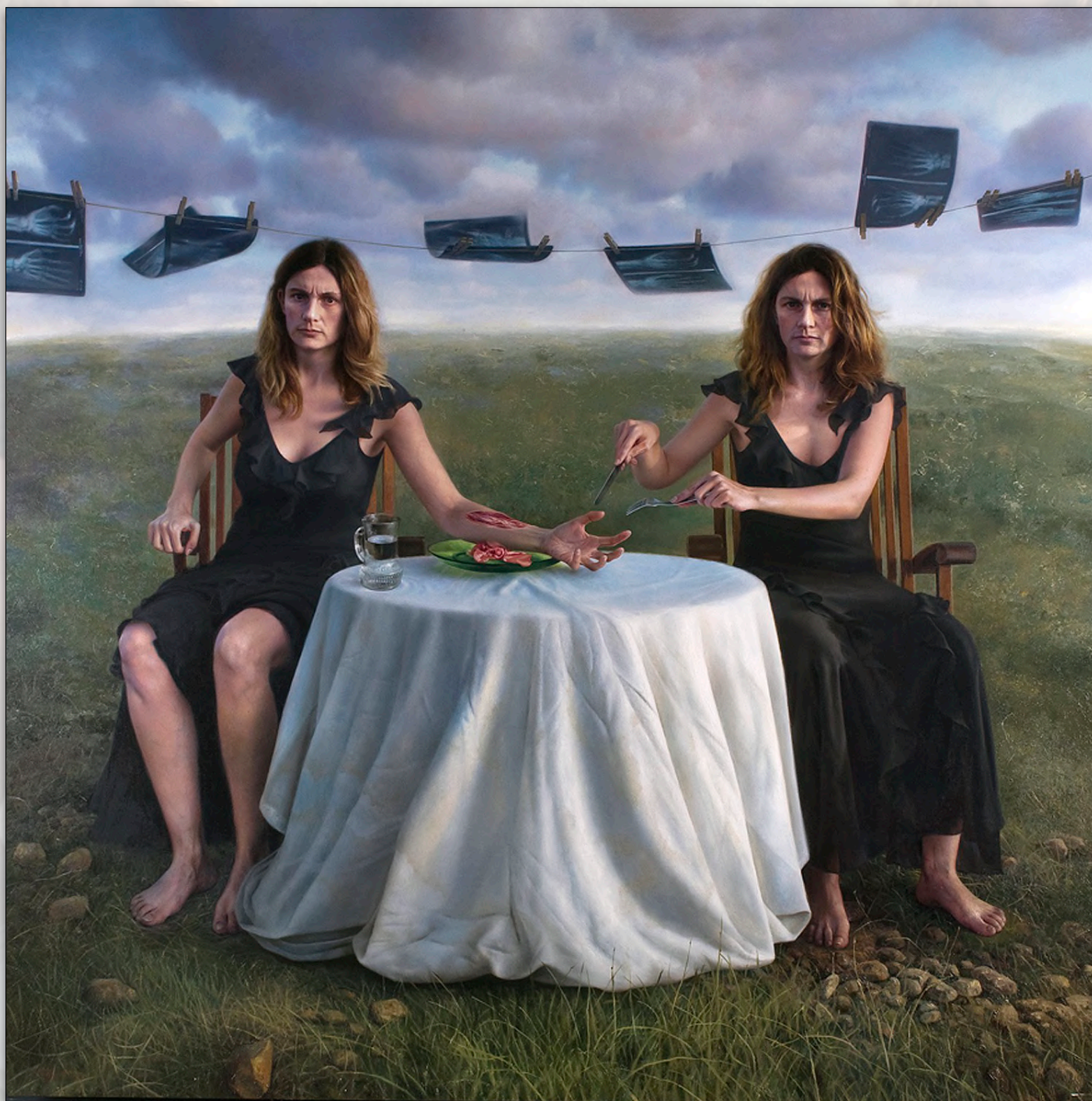
The picnic , 2008, Oil on Canvas, 200 x 200 cm © Edgar Mendoza