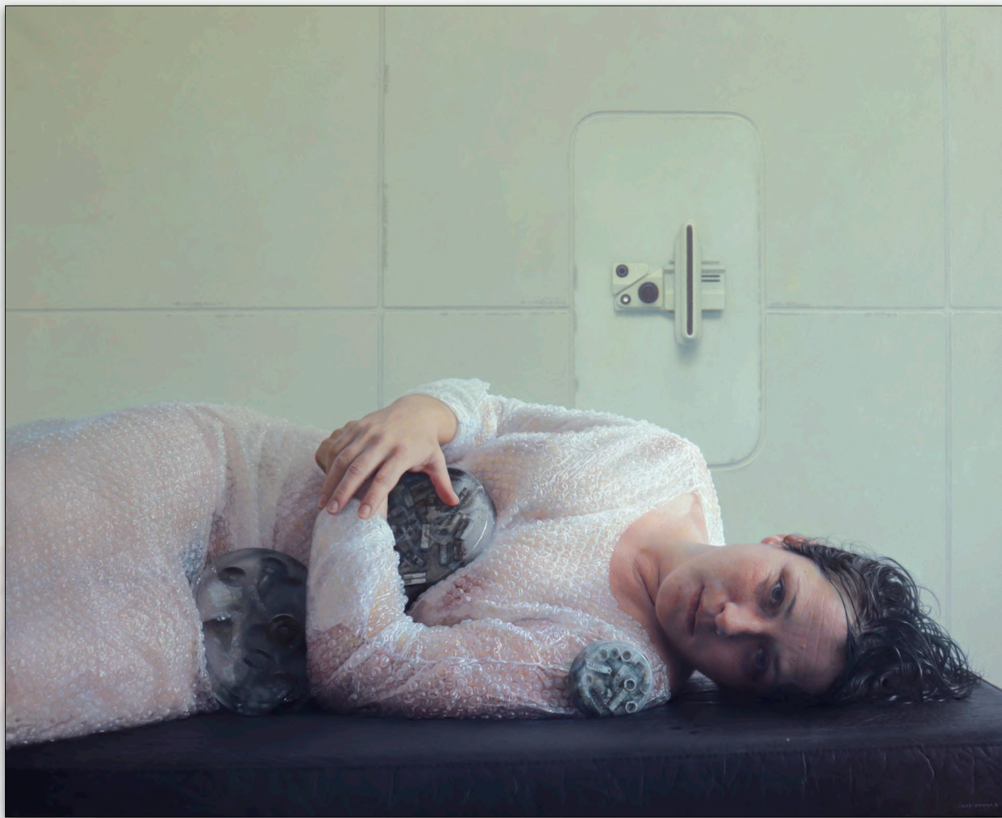
Nobody , 2021, Oil on Canvas, 81 x 100 cm © Edgar Mendoza