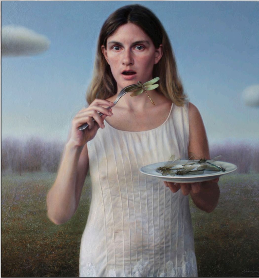
Entomophagous , 2009, Oil on Canvas, 60 x 60 cm © Edgar Mendoza