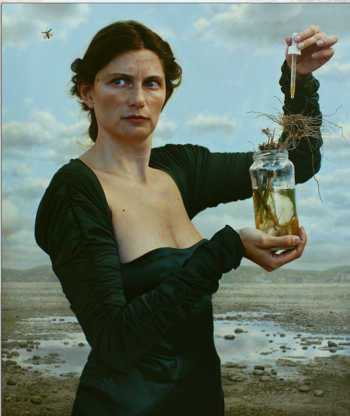
Lumen , 2012, Oil on Canvas, 89 x 75 cm © Edgar Mendoza