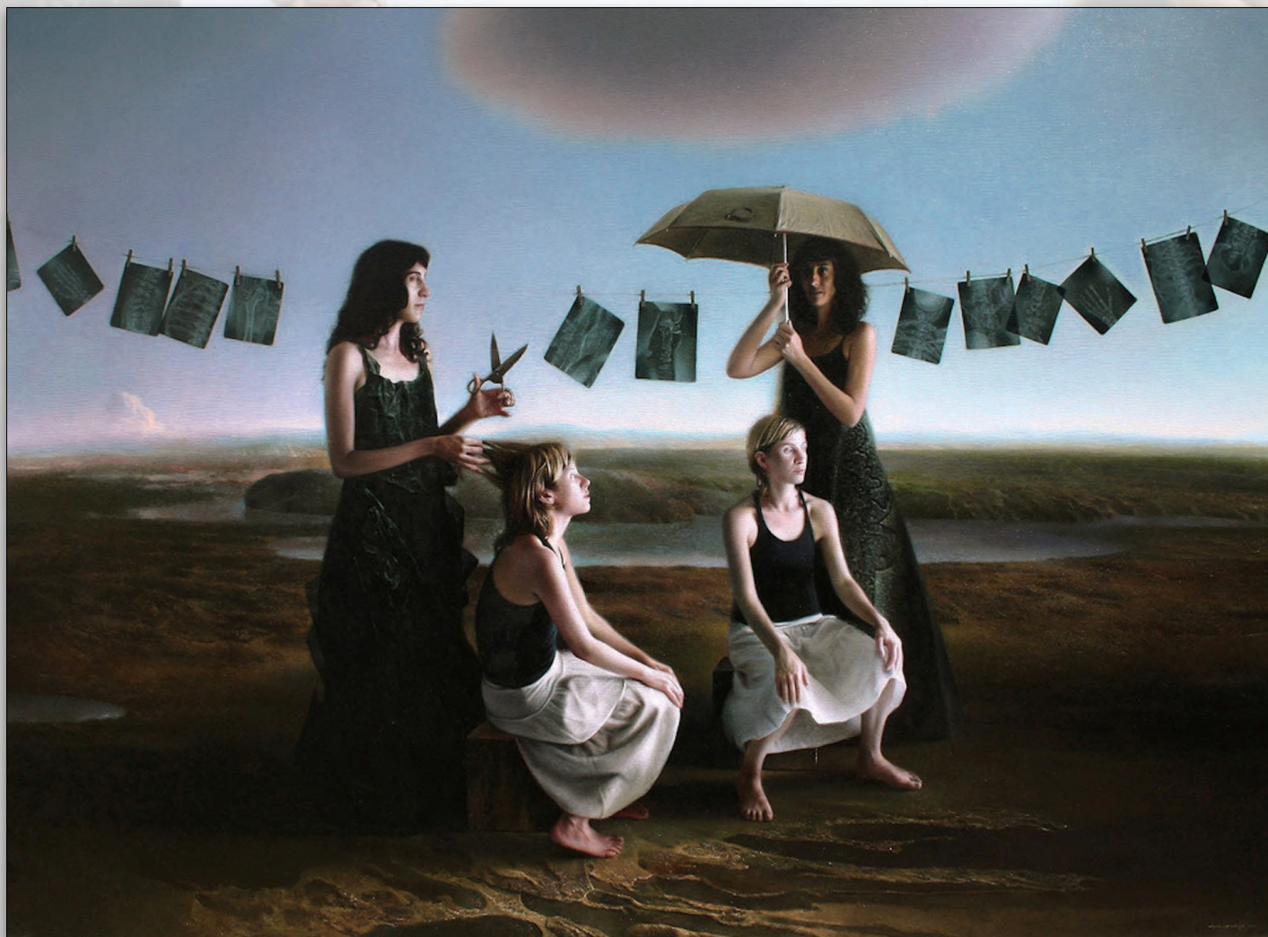
The surgeons , 2008, Oil on Canvas, 97 x 130 cm © Edgar Mendoza