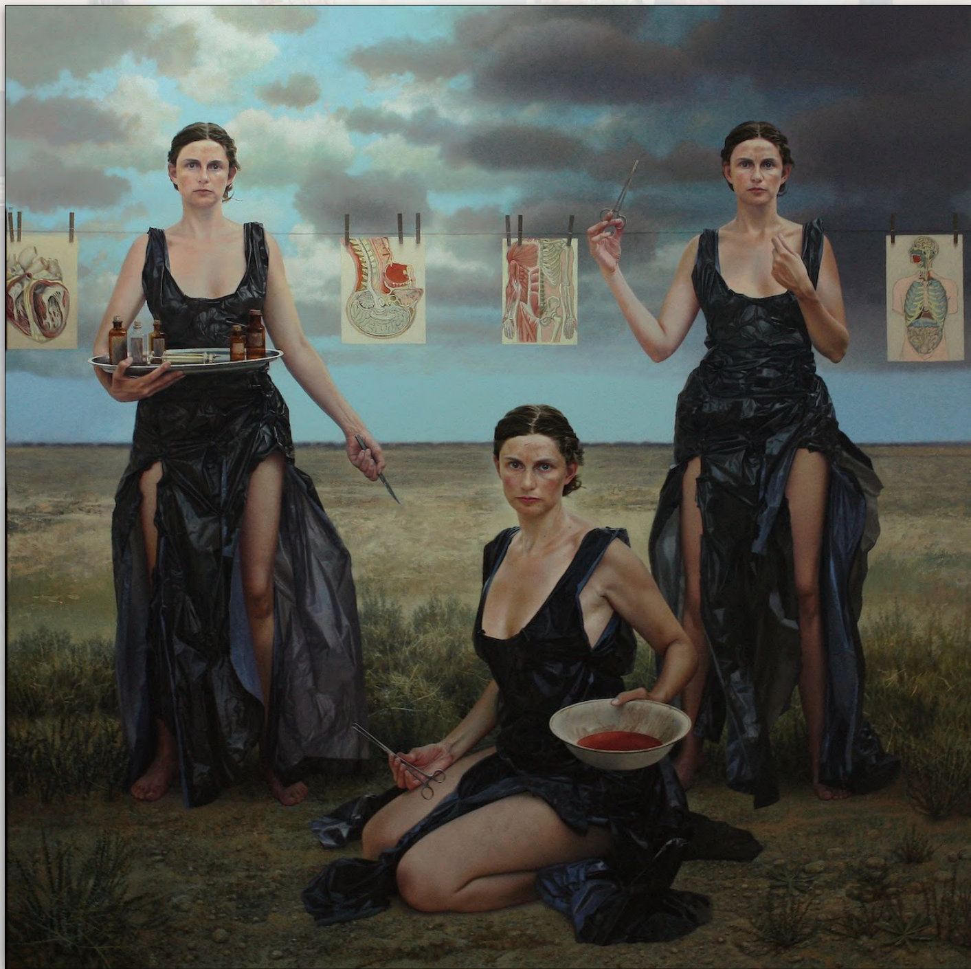
Extraction of the stone of madness , 2012, Oil on Canvas, 150 x 150 cm © Edgar Mendoza