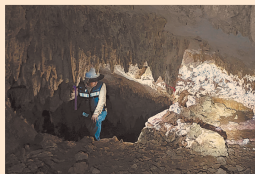
Cueva arqueológica. El hallazgo se encuentra al interior del Corredor Ecoarqueológico Paumul II.