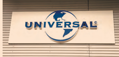
La discográfica debutará en el mercado de valores.