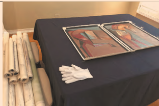
La pandemia transformó el sistema de comercialización y obligó a guardar los guantes.

Los Globos de Oro de este 2021, además de ser muy musicales, celebrarán a una nueva generación de cineastas afroestadounidenses.