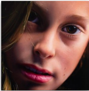
Ane II, 2020