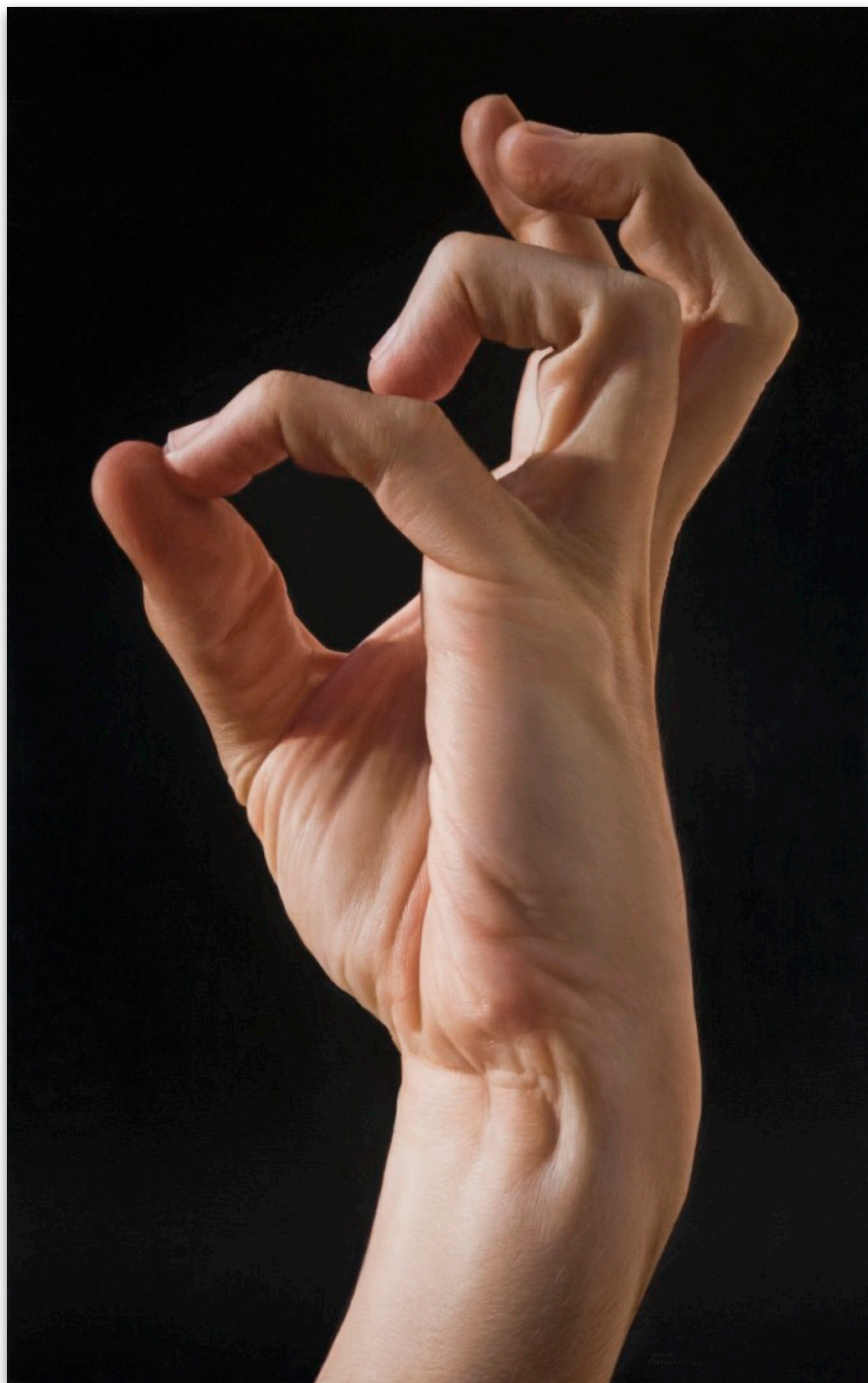
Hand I, 2010