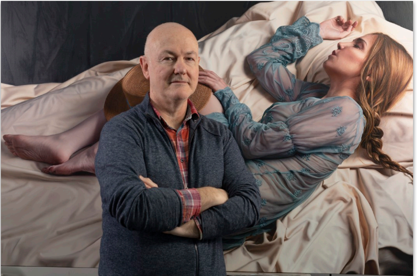
The artist at his studio in Irun, Spain | Art & Photo © Javier Arizabalo