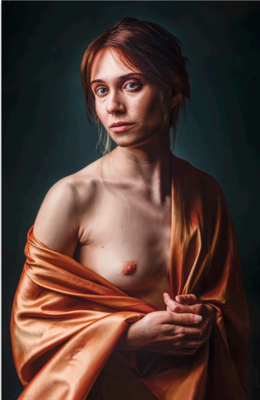
Irene I, 2023