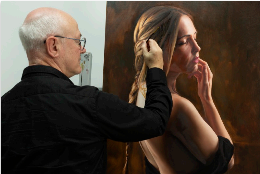
The artist at his studio in Irun, Spain | Art & Photo © Javier Arizabalo