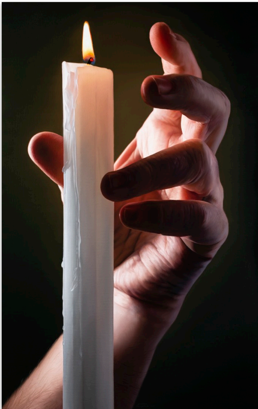
Hand II, 2021