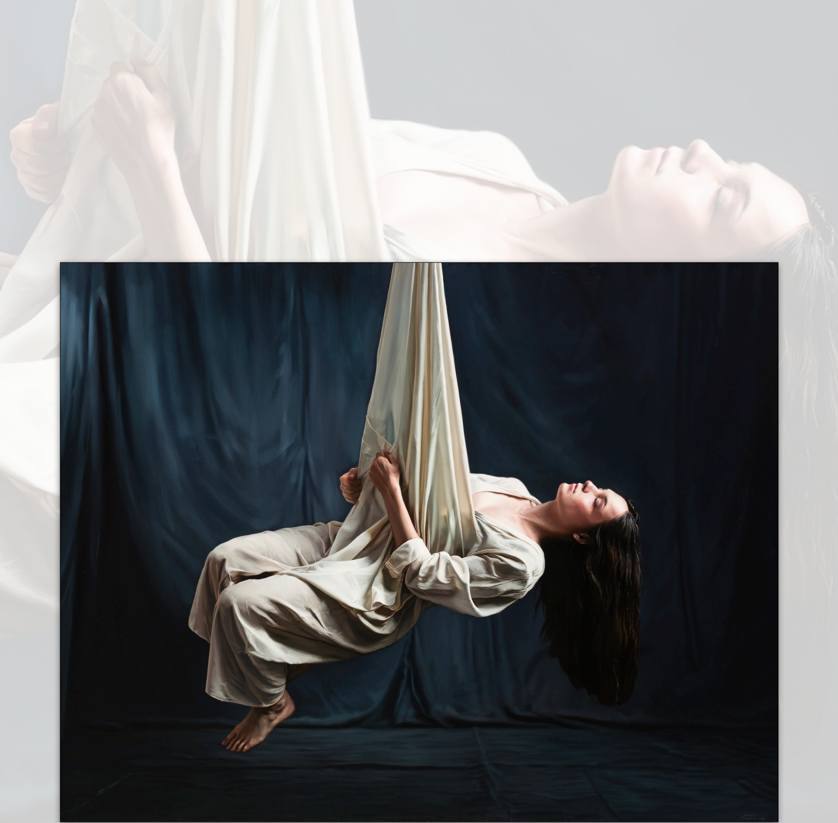
Suspension , Jun. 2025, Oil on Canvas, 114 x 146 cm, “Iconic” Sessions, “Girls” Series © Javier Arizabalo