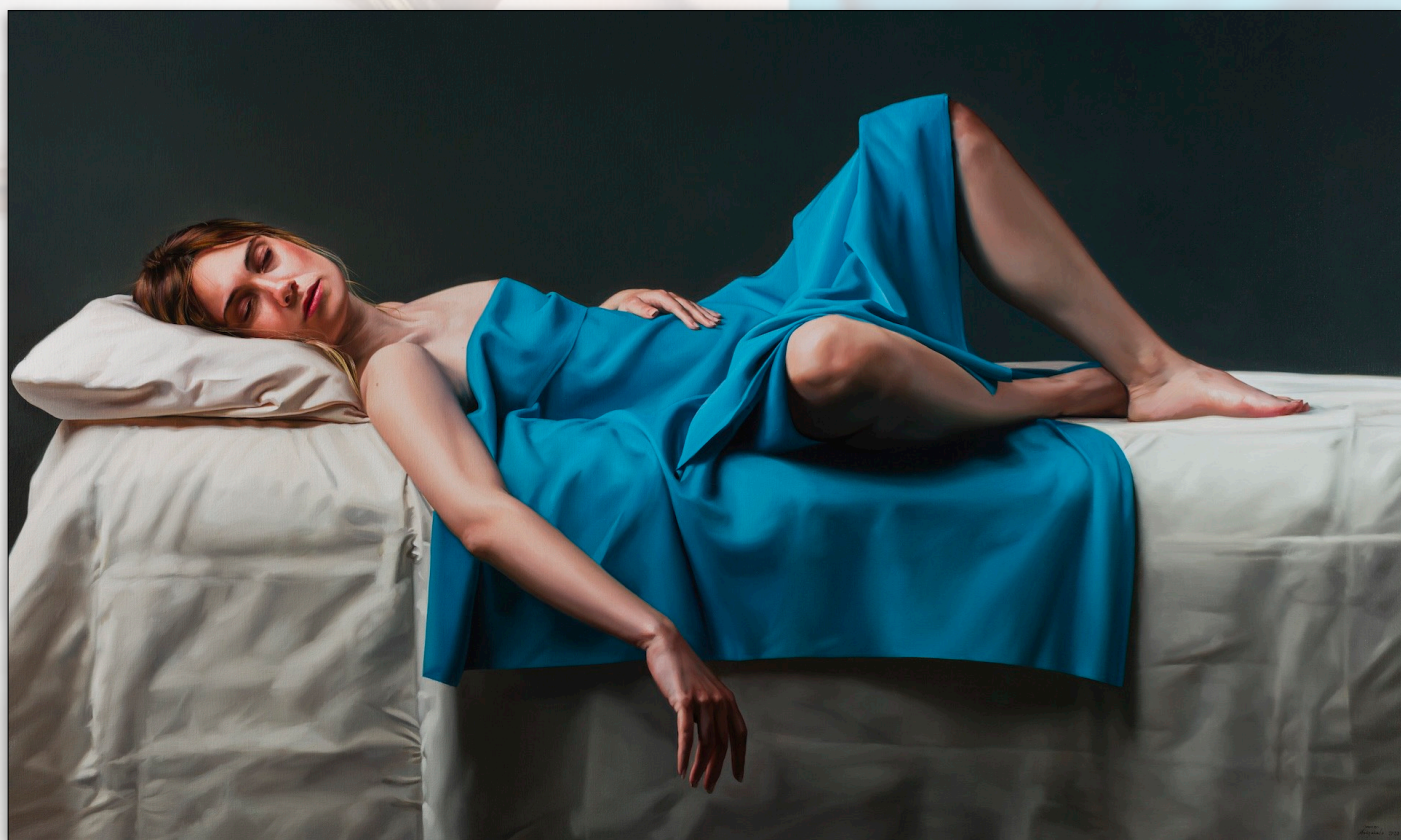
Irene , Jan. 2024, Oil on Canvas, 114 x 195 cm, “Irene” Sessions, “Girls” Series” © Javier Arizabalo