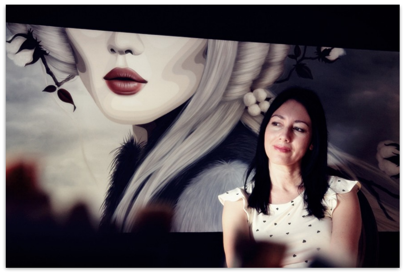
The artist at her studio in Lisbon, Portugal | Art & Photo © Duma Arantes