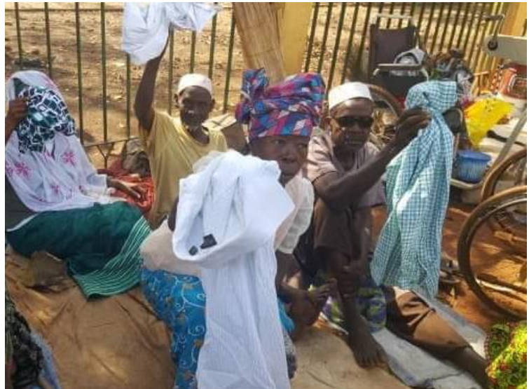
^ Above image of the beggars of Conakry streets receiving donated clothing