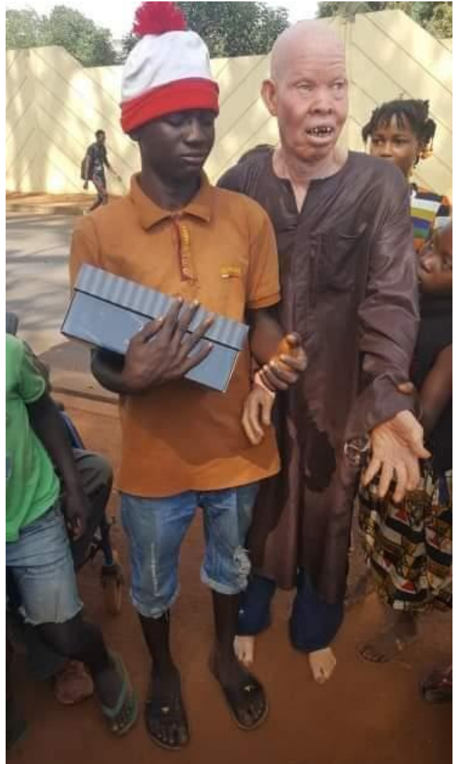
On this image homeless kankan albinos man> receiving donations of shoes and clothes.