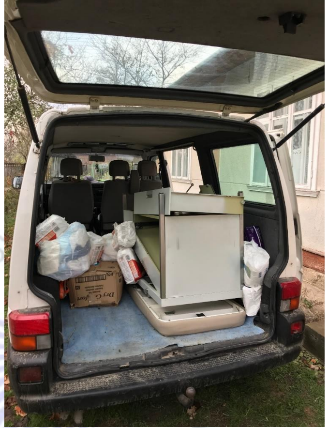
Church vehicle is used to deliver humanitarian aid as well as members of the church help haul humanitarian aid from a temporary warehouse to the permanent one.