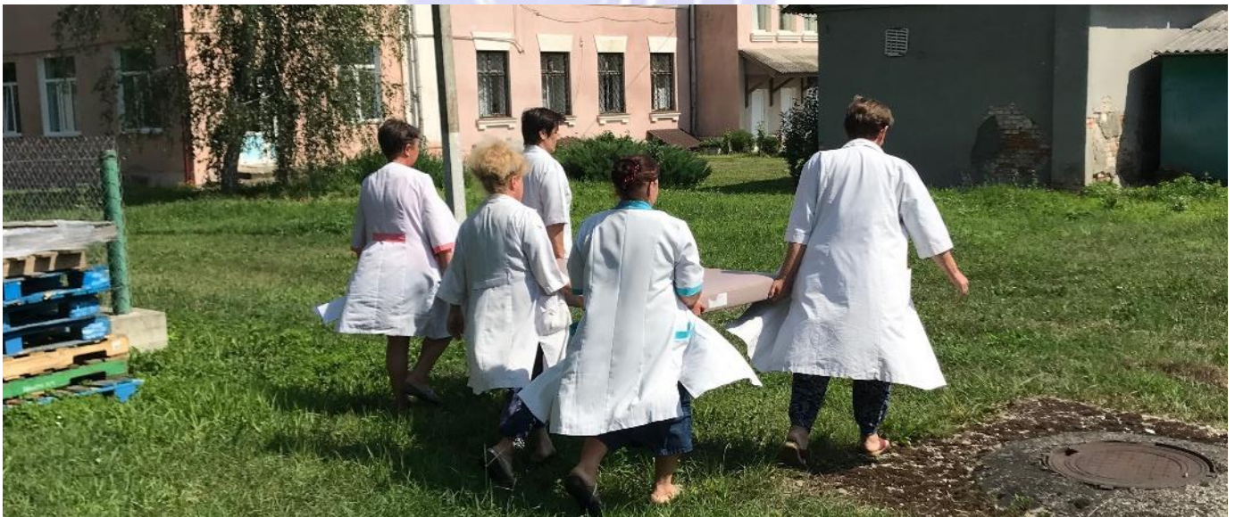
Medical nurses with an exam table they've taken for their clinic