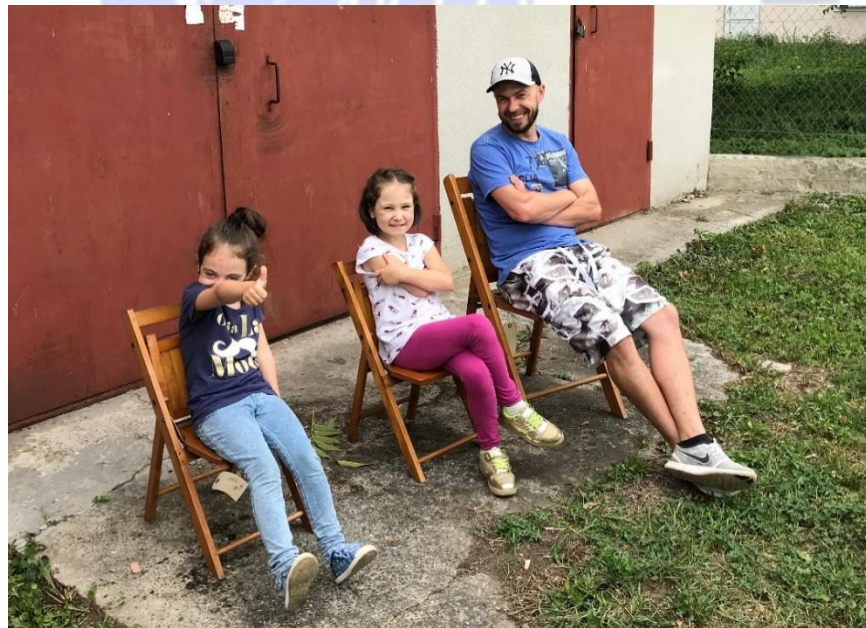
Children and adults are pleased with new chairs