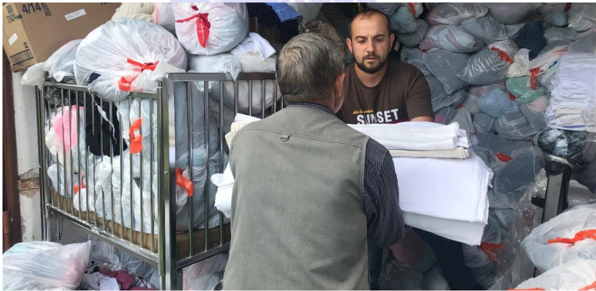
Hospital is receiving bed linens