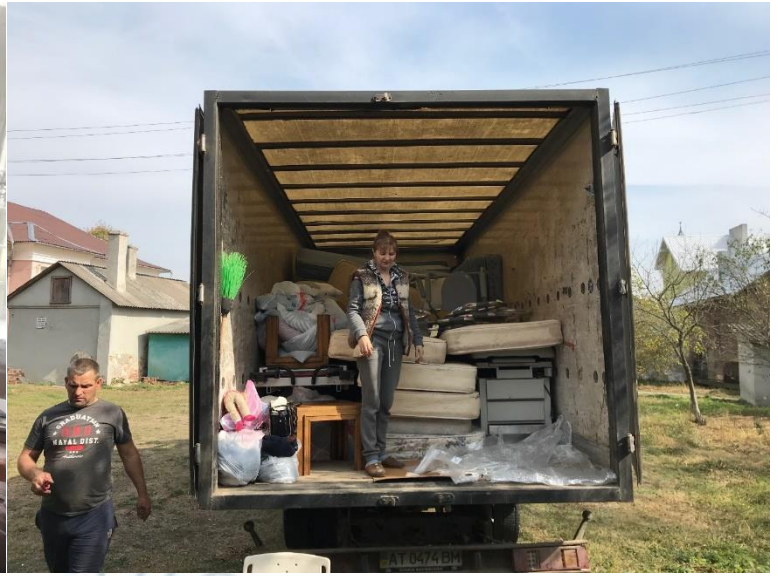
A truck full of aid for a distant mountain village