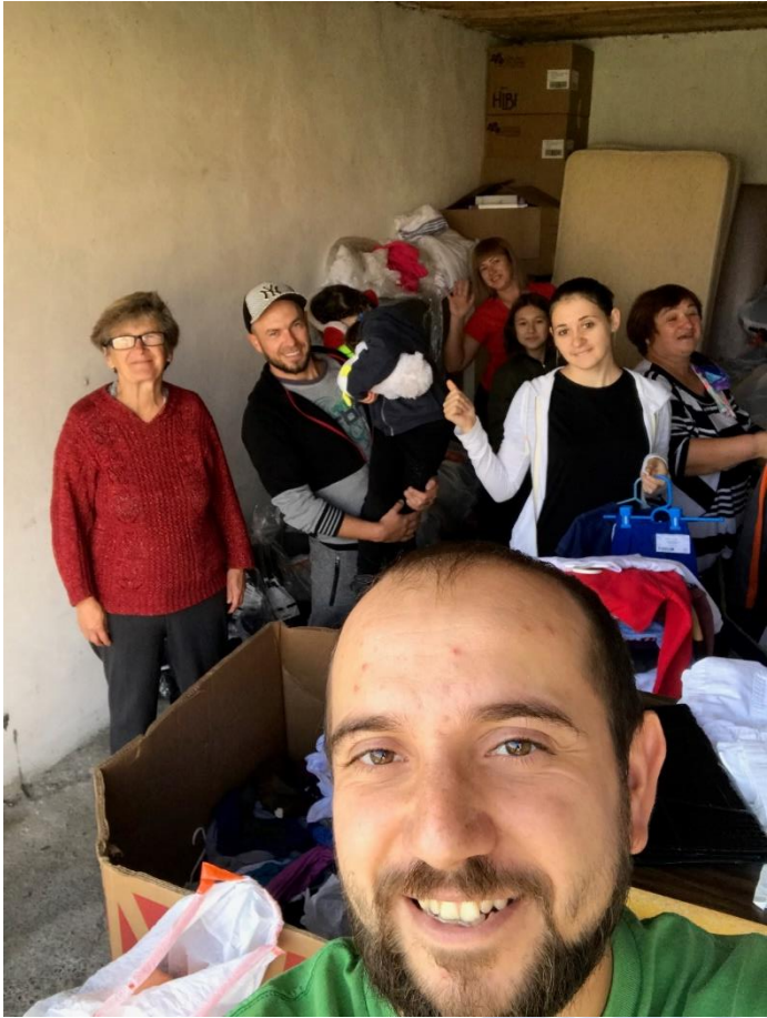
Distribution of clothes to the members of the church