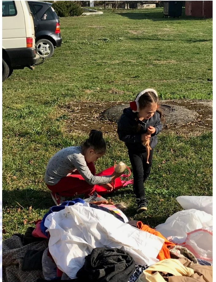
Children received toys from the container