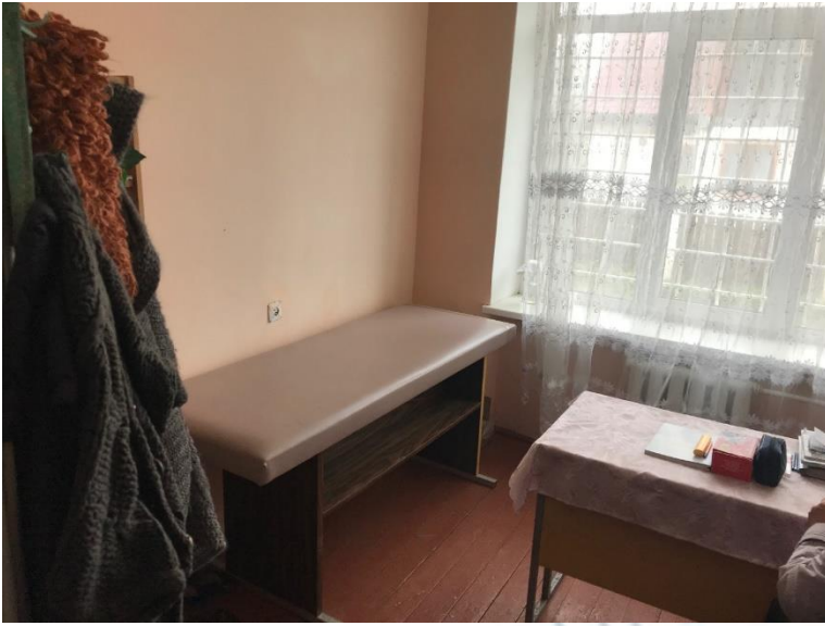
Exam table has found its destination in the school's nurse.