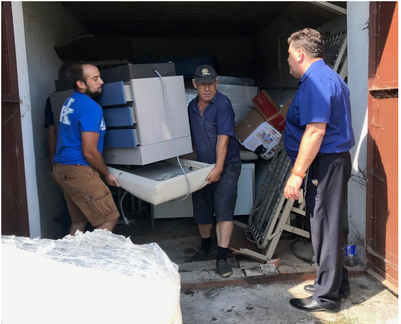
Head Doctor personally came to receive aid for the hospital