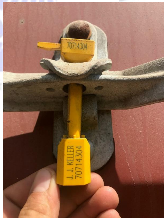
-Unloading at destination