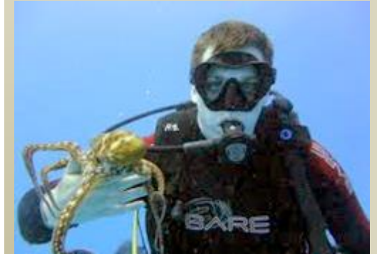
THIS IS “JOHN”, A “RECREATIONAL” DIVER ALLOWED TO DIVE ONLY FOR SPORT.