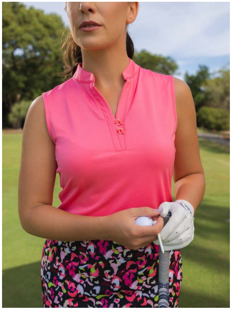
GOLF TV PERSONALITY CHANTEL MCCABE