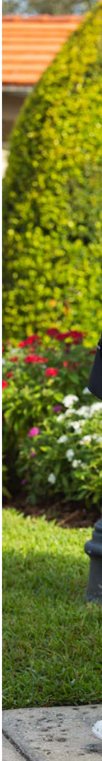
INTERLACHEN COUNTRY CLUB - WINTER PARK, FLORIDA