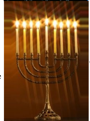
Unknown photo source

To remove your name from our mailing list, please email us with REMOVE in the subject line, call or write. Please visit our website for articles, studies, prayer aides, resources or to donate.