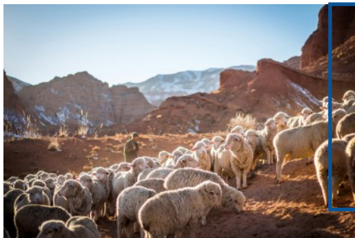
Faithfulness Cont. pg. 3