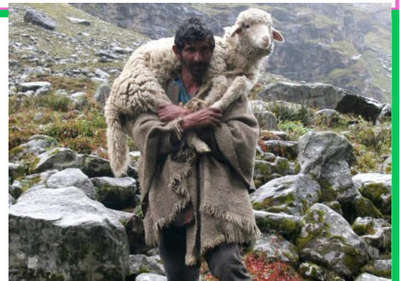
Shepherd on His way to Hampta