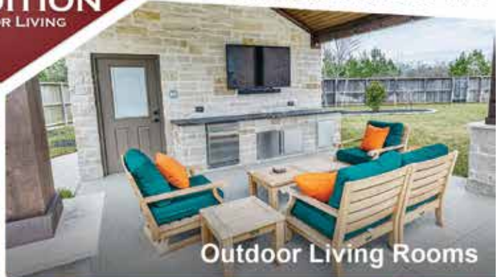
Outdoor Living Rooms