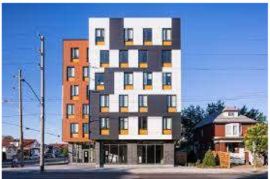
Indwell Rudy Hulst Commons 47-unit Affordable Accessible Housing Building near Future Kenilworth LRT Station Stop