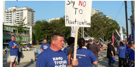
Protestors in Front of City Hall Rallying to Keep Transit Public

The Hamilton Community Benefits Network envisions Hamilton as an inclusive, thriving city in which all residents have equitable opportunities to contribute to building healthy communities and a just, prospering economy. Community Benefits Agreements (CBAs) are a proven approach to achieving this vision.