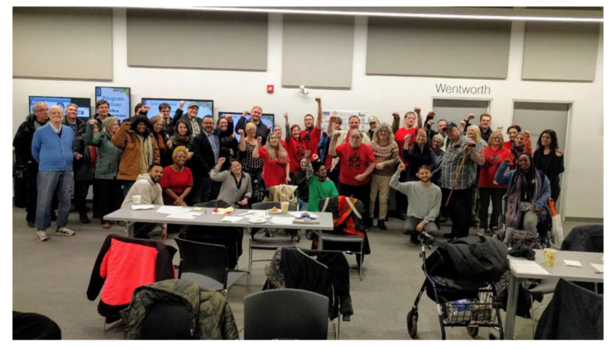
Group Photo from January 2019 Engagement Sessions

Participants were asked to list any additional concerns they had about the LRT project that should be communicated to Metrolinx and the City of Hamilton. These concerns are summarized in Table 10.