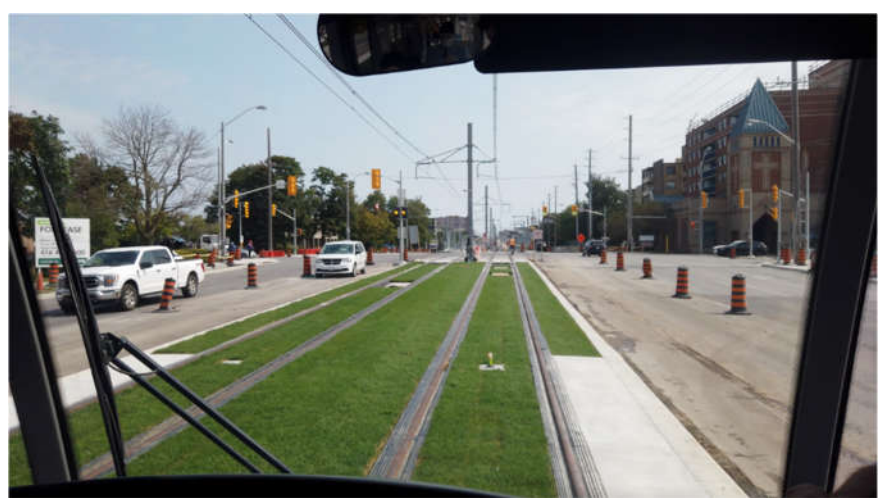
Green Tracks on Metrolinx Line 5 Eglinton Crosstown

The Hamilton Community Benefits Network envisions Hamilton as an inclusive, thriving city in which all residents have equitable opportunities to contribute to building healthy communities and a just, prospering economy. Community Benefits Agreements (CBAs) are a proven approach to achieving this vision.