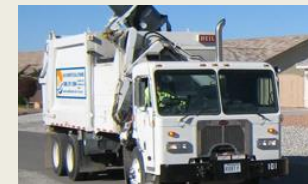
Pahrump Valley Disposal