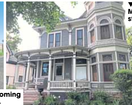
▼ The Mork and Mindy House; and stunning scenery.